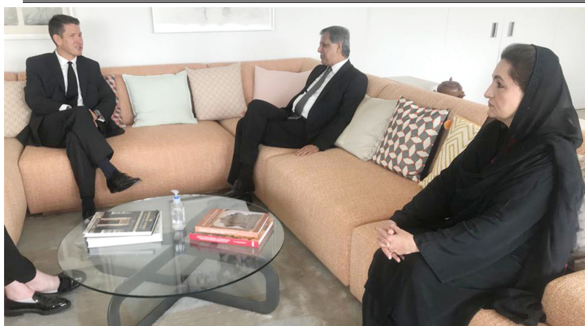
ISLAMABAD: Federal Minister for Law and Justice, Azam Nazeer Tarar meets British High Commissioner, Christian Turner to condole the demise of Queen Elizabeth II and extends solidarity with the UK.