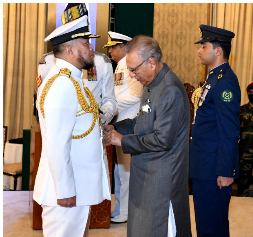
ISLAMABAD: President Dr Arif Alvi on Monday conferred Nishan-e-Imtiaz (military) on Chief of Royal Malaysian Navy Admiral Tan Sri Mohd Reza bin Mohd Sany at a special investiture ceremony.

OSLO: Norway, which has replaced Russia as Europe's leading supplier of natural gas, on Monday dashed the hopes of EU member states who wanted a cap on gas prices. Following his second phone call with European Commission President Ursula von der Leyen in the space of a few days, Norway's Prime Minister Jonas Gahr Store said he was "sceptical" about the idea of a gas price cap. "We agree to have an even closer dialogue with the EU in the future on the various proposals on the table", he said. European energy ministers who met Friday in Brussels said they were in favour of a series of measures aimed at combatting soaring gas and electricity prices, with some calling for a cap on the price of gas imports in the EU. With European Commission president Ursula von der Leyen expected in her annual State of the Union address on Wednesday to focus on energy, bureaucrats are trying to find common ground between the 27 member states to prevent blackouts and financial pain for businesses and consumers this winter.