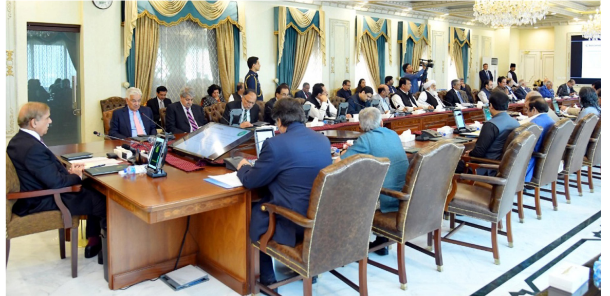
ISLAMABAD: Prime Minister Shehbaz Sharif chairs a meeting of federal cabinet.