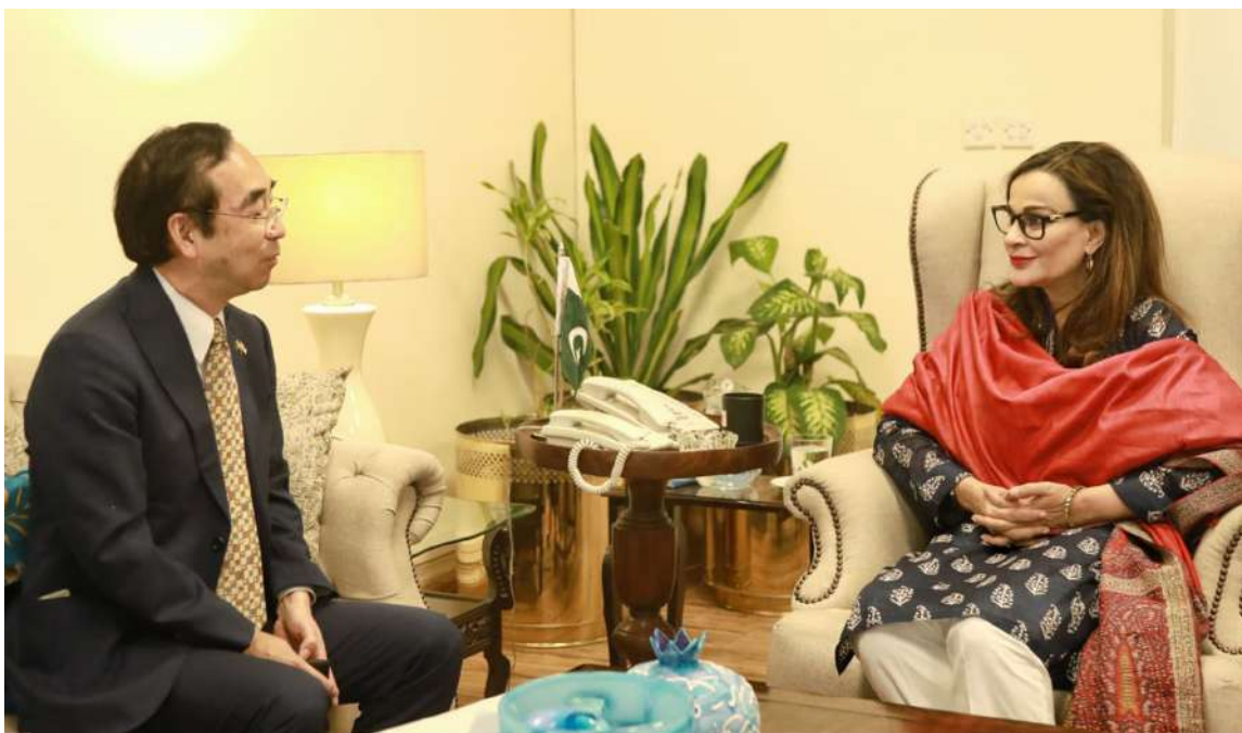
ISLAMABAD: Federal Minister for Climate Change Senator Sherry Rehman in a meeting with Japanese Ambassador.

The meeting took into consideration the upcoming by-elections in two constituencies of Karachi, NA-237 in District Malir and NA-239 in District Korangi, on October 16 and local government elections in the city on October 23.