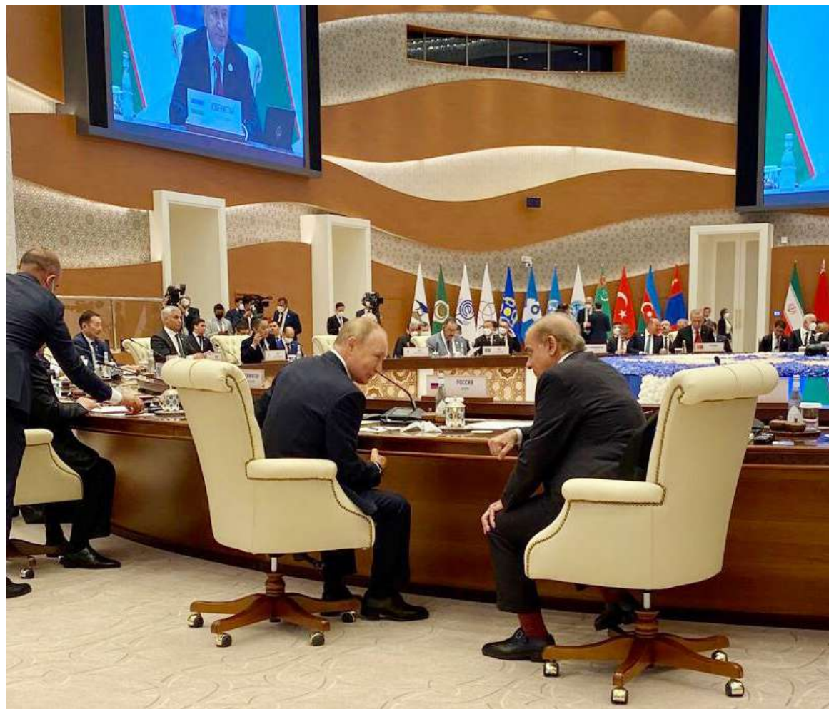
SAMARKAND: Prime Minister Shehbaz Sharif and Russian President Vladimir Putin confer during the SCO summit, in Samarkand.