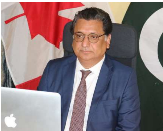
backing it up with another $25 million of funding in response to the impact of flooding in Pakistan, and to

Roshan Digital Account' as well as a fundraising dinner held in the Canadian capital under the auspices of Pakistani Canadian charitable organisation 'Dil Canada' for Pakistan flood relief. The High Commissioner said Pakistan had been hit by floods of biblical proportions and he was glad the Pakistani Diaspora in Canada had come forward in a big way to raise funds to help their fellow brethren in Pakistan. He also appreciated the Canadian government and the people for initially committing an aid of CAD 5 million and then