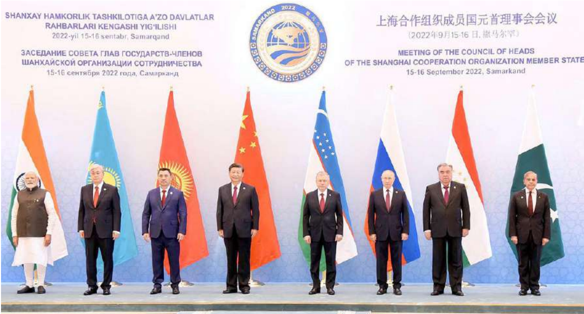
SAMARKAND: Prime Minister Shehbaz Sharif posing for a group picture with Heads of States of Shanghai Cooperation Organization member countries Summit in the Congress Center.

Hundreds of graves found in liberated Ukrainian city - Page 08