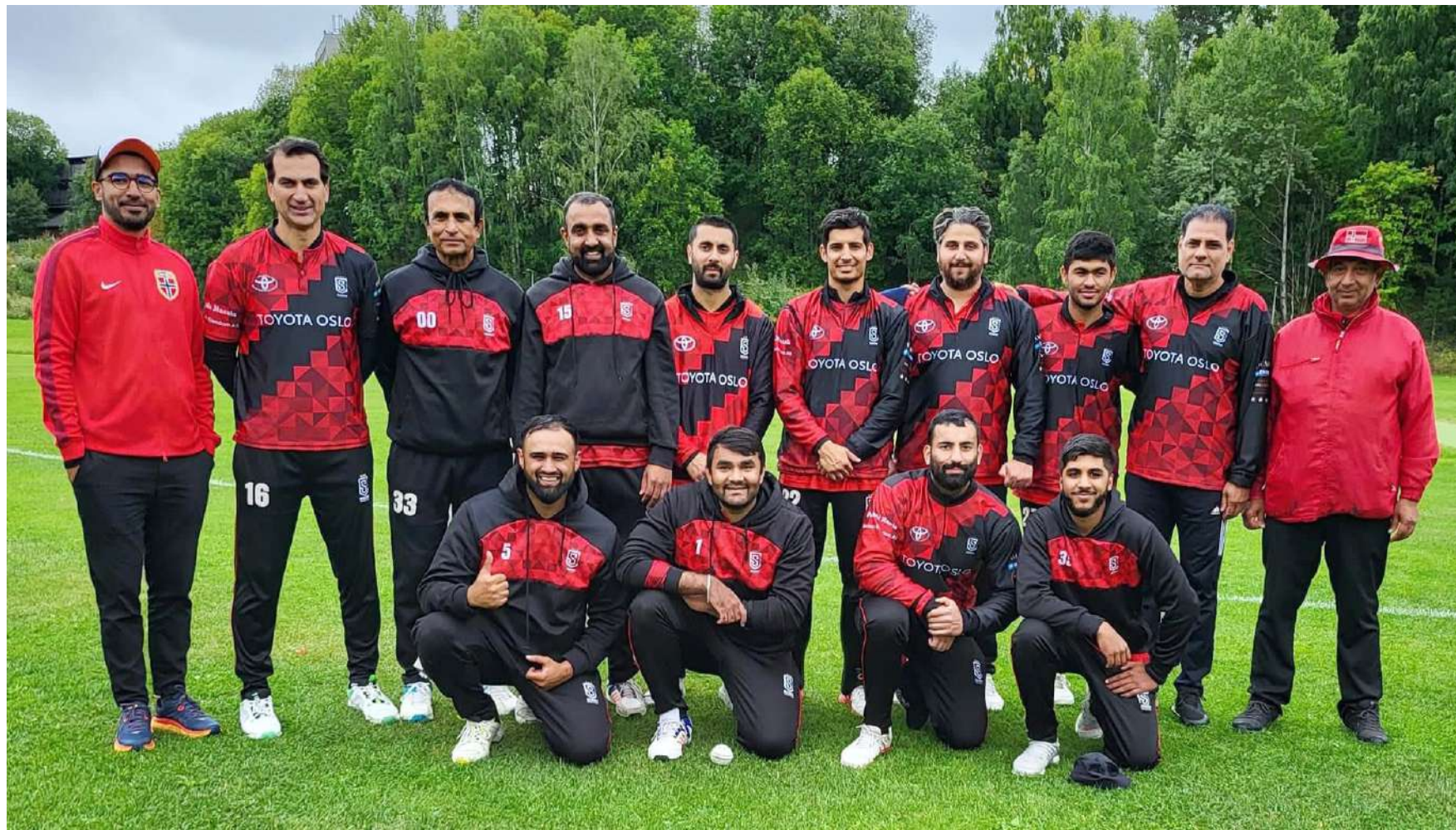
OSLO: Sinser Cricket Club players posing for a group picture. The Club won the Norwegian Cricket Championship for the fourth consecutive time.