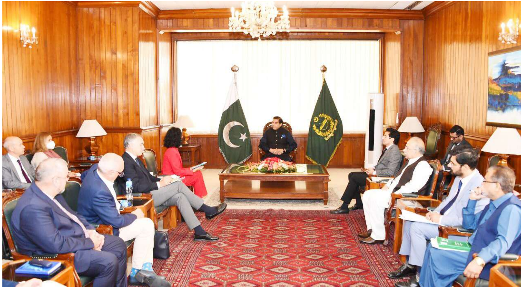
ISLAMABAD: Members of European Parliament meeting with Raja Pervez Ashraf Speaker of the National Assembly, on Tuesday.