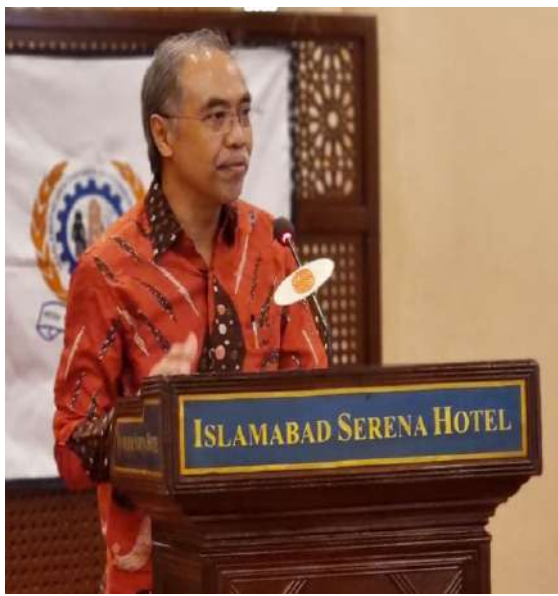
Lockdown policies, introduced by the government during COVID-19 have restricted the mobility of people.

Furthermore, MSMEs have high resilience that can support the country's economy during the pandemic.