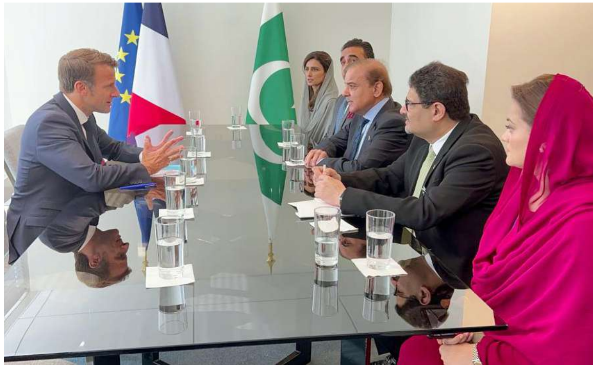
NEW YORK: Prime Minister Shehbaz Sharif meets with French President Emmanuel Macron on the sidelines of General Assembly session in United Nations. - DNA

ISLAMABAD: Pakistan Peoples Party (PPP) Senator Raza Rabbani on Tuesday called for a 'political ceasefire' owing to the calamitous situation caused by devastating floods. Raza Rabbani, former chairman of the Senate and a seasoned parliamentarian, in a statement said that the floods have wreaked havoc in Pakistan and people facing hardships owing to floodwater standing in large parts of the country.