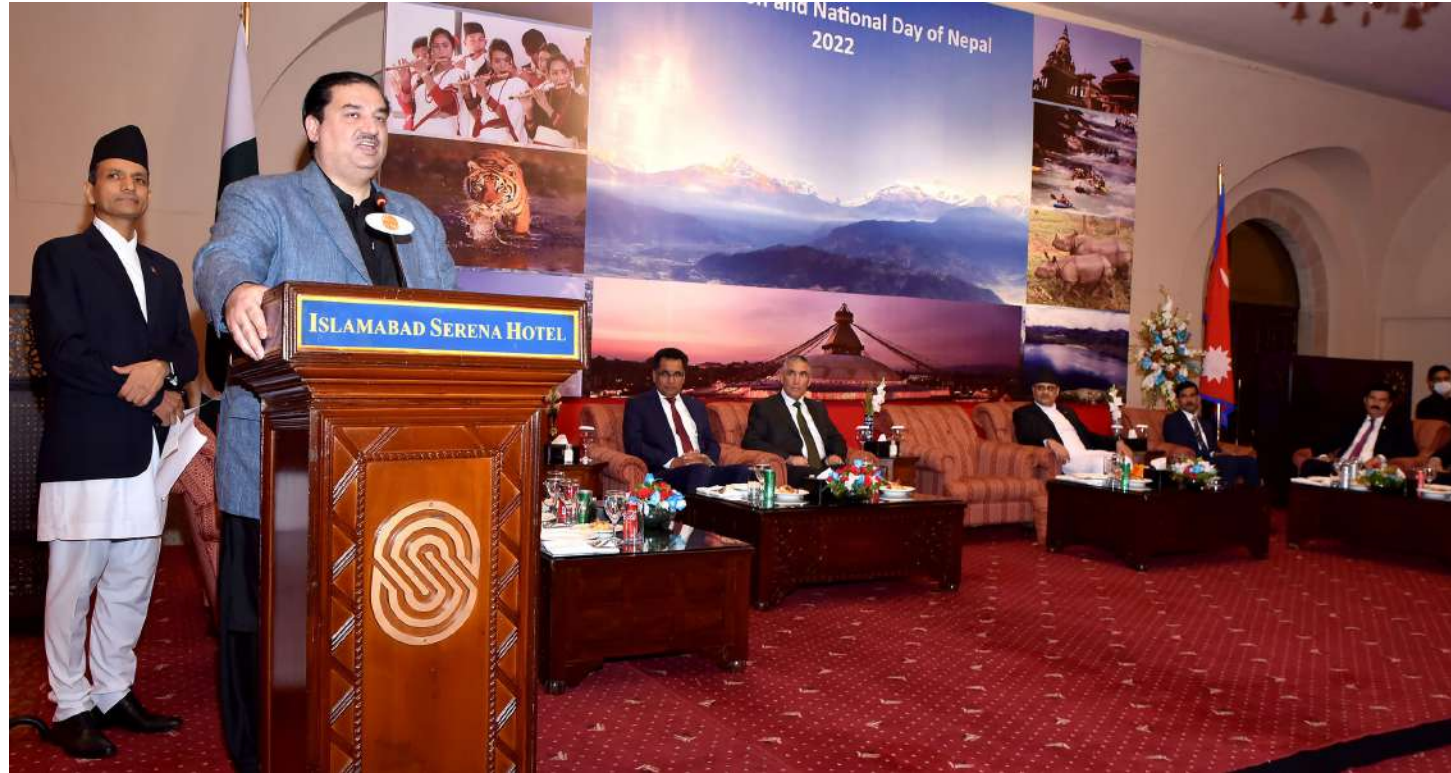
ISLAMABAD: Federal Minister for Power Engr. Khurram Dastgir speaking on the occasion of the Constitutional and National Day of Nepal, at Islamabad Serena Hotel.

Talking about the bilateral ties the Ambassador said, the relations between Nepal and Pakistan have always been cordial and friendly. The establishment of diplomatic relations in 1960 further strengthened the bond of friendship and cooperation. The relations are strong based on mutual trust and cooperation. Both countries are working together at various bilateral, regional and multilateral forums to promote friendship and cooperation. As founding members of South Asian