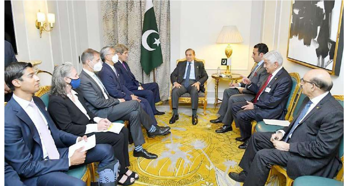
NEW YORK: John Kerry, Special Envoy of the USA for climate change calls on Prime Minister Shehbaz Sharif.