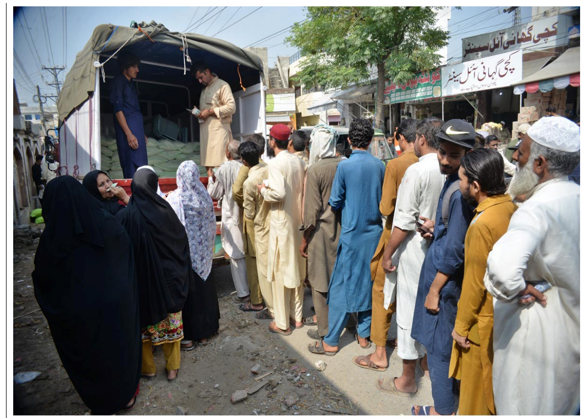
RAWALPINDI: People gathered for purchasing 10kg flour bags on subsidized rates from a truck at Dhok Sayedan Chowk.

"The manual water filter costs Rs 11ac whereas the solar based filter worth Rs 3 lac which is nominal for non-governmental organisations and philanthropists to donate for flood affected population," he added.-APP