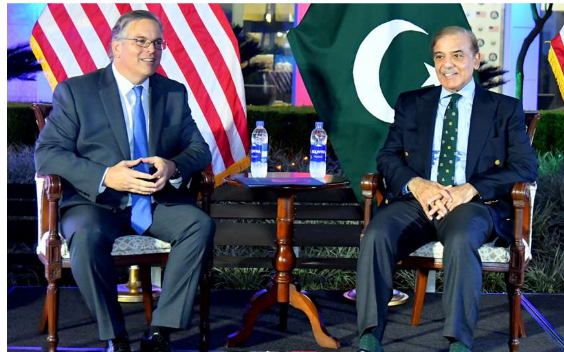
ISLAMABAD: Ambassador of United States Donald Blome meets Prime Minister Shehbaz Sharif on the occasion of completion of 75 years of diplomatic relations.— DNA

"Ishaq Dar only knows how to do illegal acts. Sindh people are suffering from the miseries of the floods, but Bilawal Bhutto is narrating stories abroad," he added.