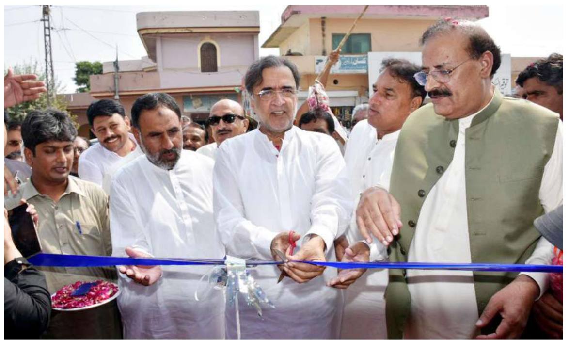
Kharian : Advisor to the PM on Kashmir Affairs and Gilgit Baltistan, Qamar Zaman Kaira cutting the ribbon for the groundbreaking of construction work of Bhago Ada to Malwana Road.