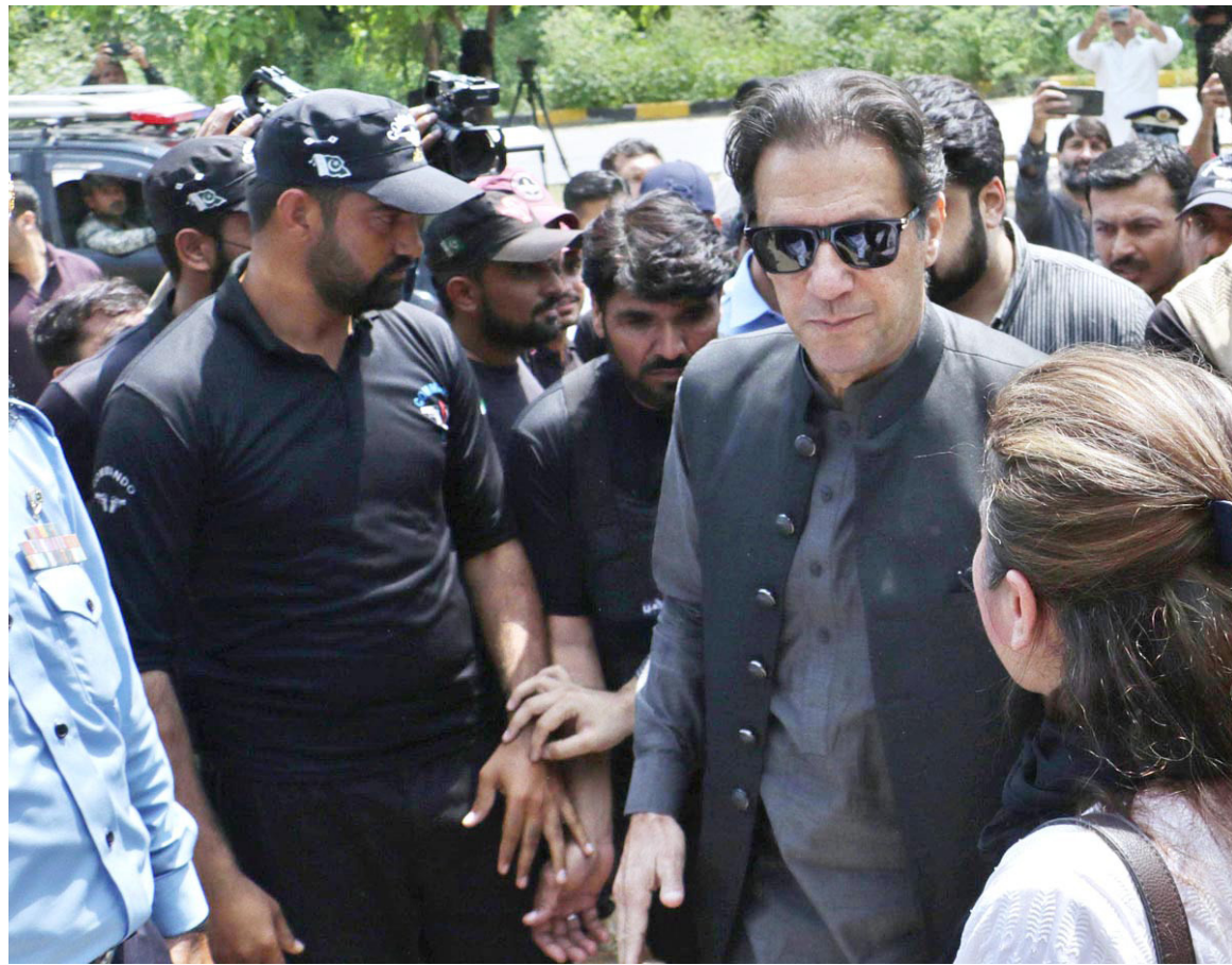
ISLAMABAD: Former Prime Minister and Chairman of Pakistan Tehreek-e-Insaf (PTI) Imran Khan arrives at Anti-Terrorism Court.

Cooperation of the Organization of Islamic Cooperation (OIC). The core mandate of COMSTECH is to nurture cooperation among OIC states in science and technology and enhance their capabilities through training in emerging areas. Permanent Inter-State Committee for Drought Control in the Sahel (CILSS), is an Intergovernmental Organization. The mandate of CILSS is to invest in the search for food and security and in the fight against the effects of climate change mainly of drought and desertification, for a new ecological balance in the Sahel. CILSS is headquartered in Ouagadougou, Burkina Faso.