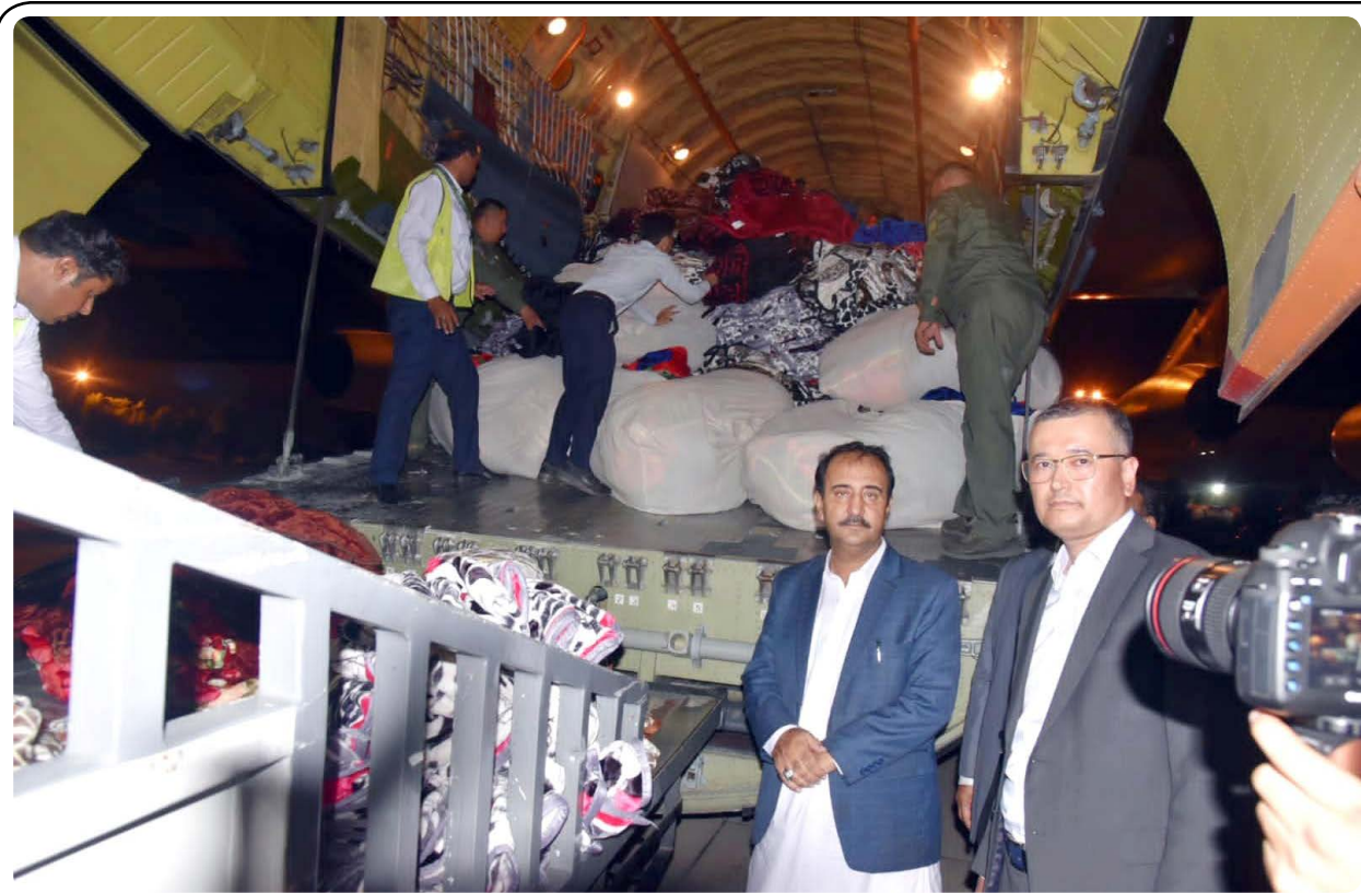
ISLAMABAD: Humanitarian assistance from Uzbekistan for flood victims being unloaded.

BERN: The Swiss government launched a voluntary campaign to urge consumers and businesses to conserve energy as shortages of gas and power loom this winter that could lead to rationing in a worst-case scenario. More than 40 partners from the public and private sector are backing the drive with the motto "Energy is scarce. Let's not waste it", the government said. "The aim is for as many people as possible to participate voluntarily - and to help prevent Switzerland from getting into a shortage situation in the first place," it said. The campaign is scheduled to last until April and features tips on how to cut demand, for instance by turning down thermostats, using less hot water, and turning off appliances and lighting when not in use.