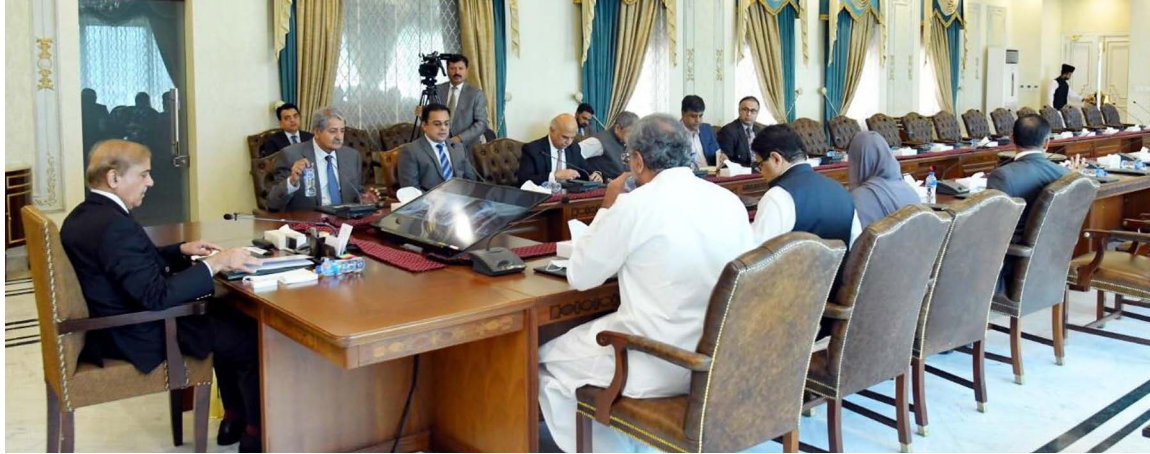
ISLAMABAD: Prime Minister Shehbaz Sharif chairing a meeting on Imported Fossil Fuel Substitution with Solar Energy.

STAFF REPORT ISLAMABAD: Pakistan Muslim League-Nawaz (PML-N) leader Shahid Khaqan Abbasi has said that the current state of the country is due to shortcomings and incompetence of the Imran Khan government. Addressing a press conference on Thursday, he said that Imran Khan's thought was anti-country and meaningless. "The audio leak of former Finance Minister Shaukat Tarin is a proof that Imran Khan is saving his politics."