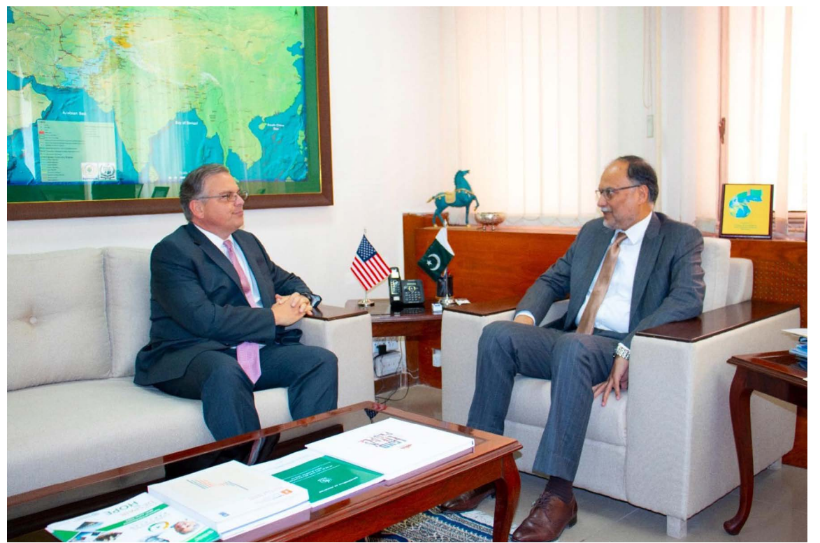
ISLAMABAD: US Ambassador Donald Blome called on Federal Minister for Planning and Development Professor Ahsan Iqbal.