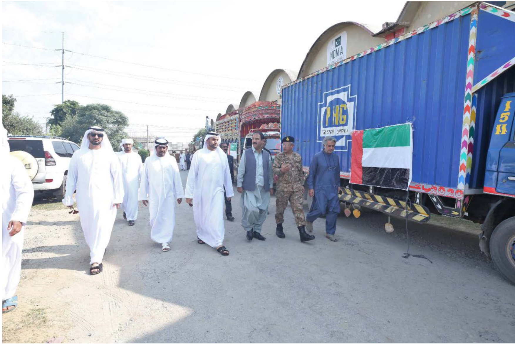
ISLAMABAD: Officials of the UAE Embassy handing over trucks of relief goods to the Pakistani authorities here on Friday.