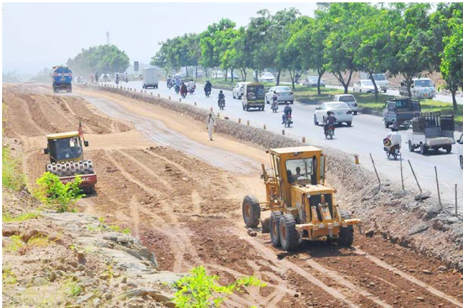
ISLAMABAD: Heavy machinery being used in construction work of Islamabad Expressway during development work in the city.