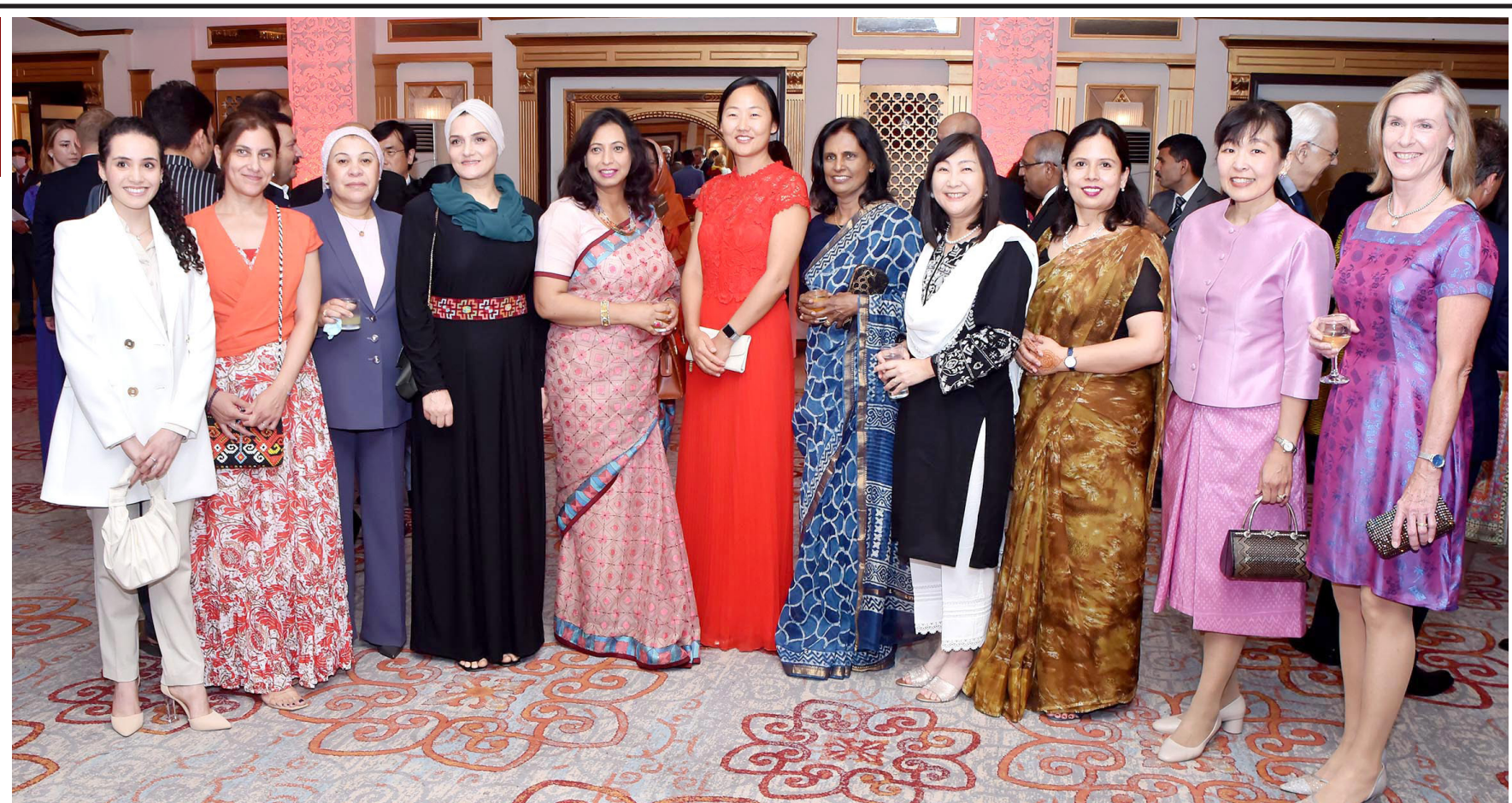
ISLAMABAD: Spouses of ambassadors and high commissioners posing for a group photo on the occasion of the National Day celebrations of Vietnam.