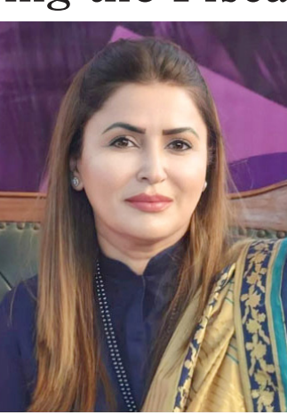
2022, since inception.

Besides this programme, BISP has been given the task of disbursing Rs. 25,000 per family to the flood