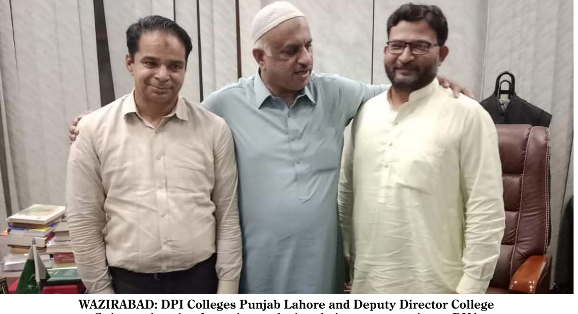
Gujranwal posing for a picture during their recent meeting.

tricts, forest fires, and environmental zoning have been taken into account in the new policy and changes have been made accordingly. Furthermore, the necessary steps to be taken by various government departments for effective implementation of the policy have also been elucidated. While commenting on the issue, the Chief Minister also mentioned similar steps taken by the provincial government aimed at promoting a healthy environment and to curb pollution which includes the Billion Tree Tsunami Afforestation Project completed by the Pakistan Tehreek e Insaaf led provincial government during their previous tenure and the plantation of another billion trees in the province under the present Ten Billion Trees Afforestation project.