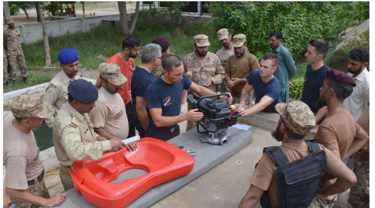
ISLAMABAD: French blue team busy with Pakistan Army in Sindh, training the officials for the use of super water pumps. The pumps are capable of evacuating of 3000 L water in a minute .