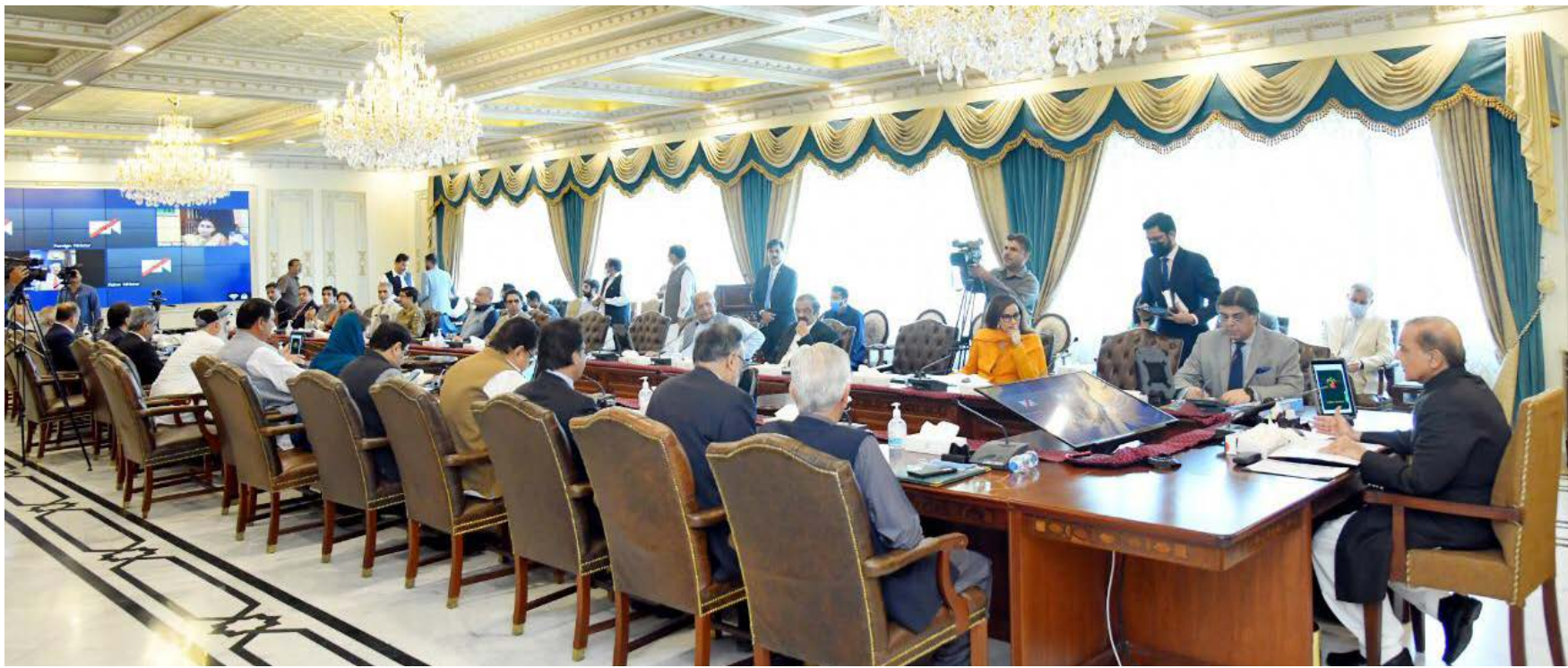
ISLAMABAD: Prime Minister Shahbaz Sharif chairing a meeting of the federal cabinet.

clash occurred at Boya of Tehsil Ghulam Khan whereas the second at Mirali. Captain Abdul Wali Wazir along with four other personnel killed when the security forces raided a din of alleged terrorists at Boya. The raid led to killing of four militants and recovery of a huge quantity of modern and sophisticated weapons and explosive material as well. The ISPR added that raid in Mirali led to killing of a notorious militant commander Tufail who was wanted to law enforcing agencies in a number of terror acts. It added that after clashes the security forces also went on search operation in the area. On the other hand overall situation in Miranshah and other parts of North Waziristan remained calm but tense. Almost trade, business and other routine activities remained in progress whereas security forces tightened security on all important roads.