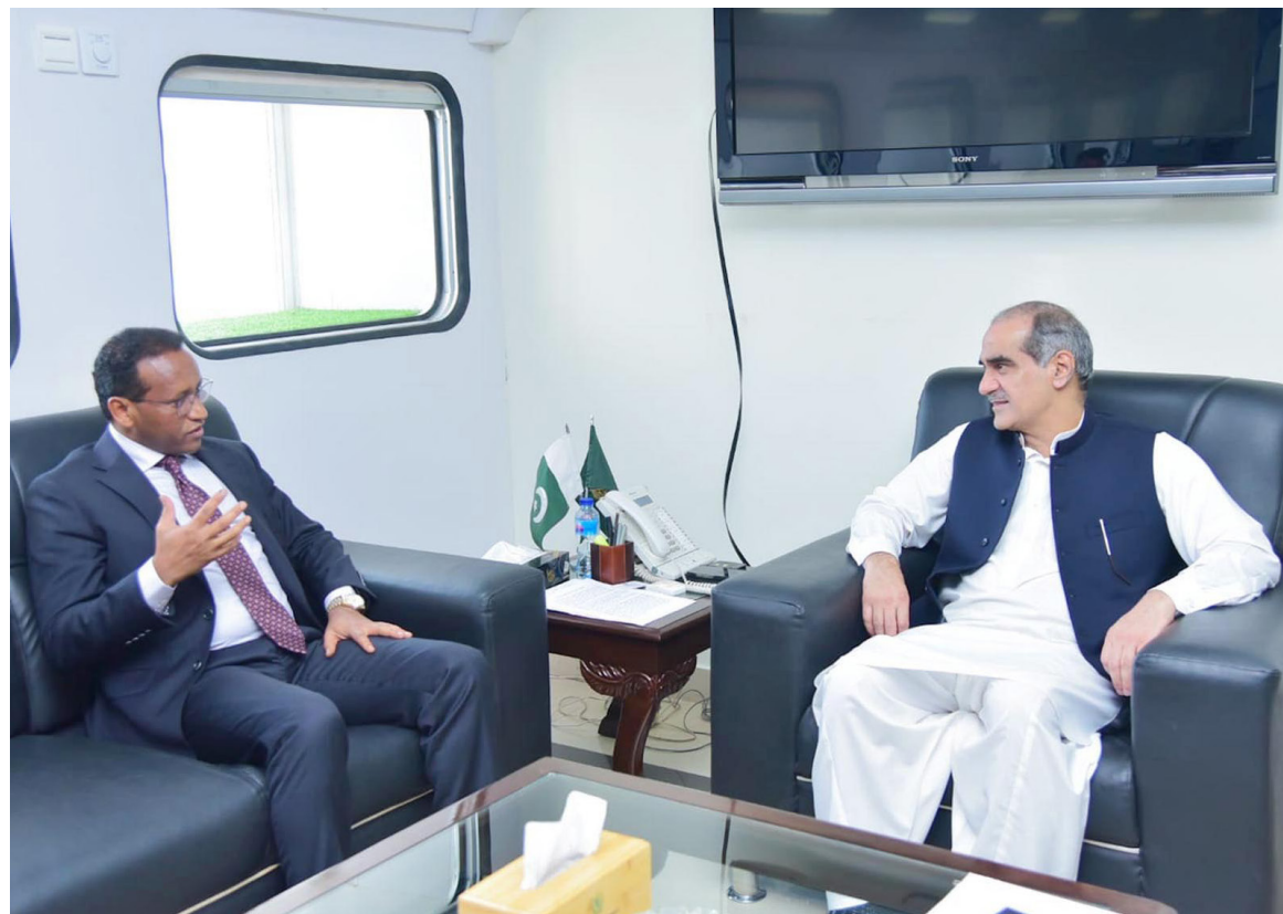
ISLAMABAD: Jemal Beker Abdula, the Ambassador of Ethiopia to Pakistan called on to Khawaja Saad Rafique, Federal Minister for Railways and Aviation in his office.

ISLAMABAD: Pakistan Railways had been suffering losses of around Rs90 million per day due to unexpected monsoon rains and flash floods across the country. "The relentless monsoon rains and floods have not only destroyed the many railway tracks, but also damaged the bridges which disconnected Sindh and Balochistan with other parts of the country," sources in the Ministry of Railways told APP. They said during the last month, Quetta was disconnected from the rest of the country after bridge collapse at Mach Station, which had resulted in the cancellation of seven important trains between Karachi and Quetta. Pakistan Railways had also announced the suspension of the operations of five express major trains on the Main Line-I (ML-I) a few days ago until the rehabilitation of railway tracks, they said. They said the main line of Pakistan Railways was under the flood-water between Tando Masti Khan-Gambat and Mehrabpur-Lakro sections. Similarly, the track was sub merged at various spots in Balochistan. The sources said that furthermore, Pakistan Railways had already asked the passengers who want their tickets refunded can contact the respective reservation offices. They said that the flood water would drain in the next 7 to 10 days, which would allow for the rehabilitation and eventual resumption of operations while the freight van operations have been resumed on a few tracks at a slow pace of 10-20 kilometers per hour. - APP