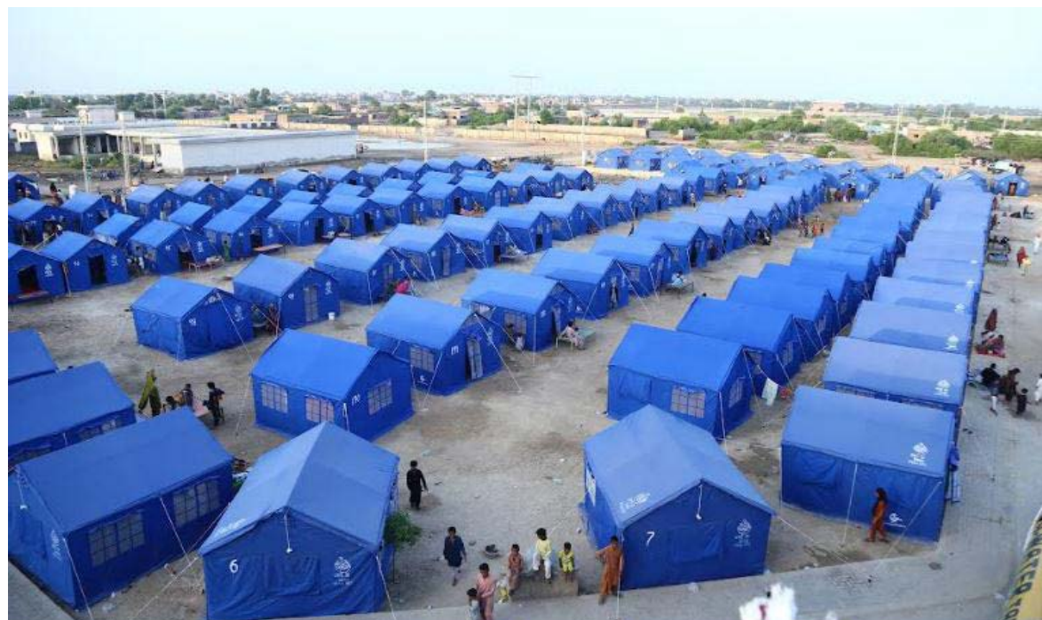
HYDERABAD: A view tent basti established by district government in Hyderabad for flood affected families.