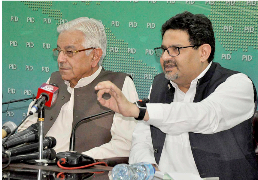
The finance minister said the PTI government had put the country's economy on the verge of default and Pakistan was on fourth number of the defaulting states. However, he said due to the prudent policies of the current coalition government, the country had come out of crisis. Miftah

ISLAMABAD, Terming the hike in electricity and petroleum prices a result of unwise policies of the previous government of Pakistan Tehreek-e-Insaf (PTI), Minister for Finance and Revenue Miftah Ismail Wednesday hinted at slowing down the inflation rate from next month. "The nation would have to bear the higher rates for one more month", he said while addressing a press conference here along with the Defence Minister Khawaja Muhammad Asif. He said former Prime Minister Imran Khan did not follow the commitment made with the International Monetary Fund (IMF) especially with regard to subsidies on electricity, gas and petroleum products. He said the previous government had committed to the IMF that the government would not give any amnesty to the businessmen and subsidies on petroleum, gas and electricity but going against the commitment, then government offered amnesty in February 2022 and then providing subsidy on electricity on petroleum products and the electricity. He said this was the reason why the rates of electricity and petroleum products sky rocketed now.