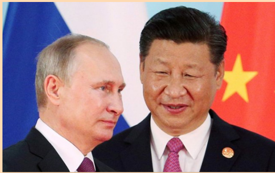
BEIJING: Xi Jinping and Vladimir Putin will meet next week during a regional summit in Uzbekistan, a Russian