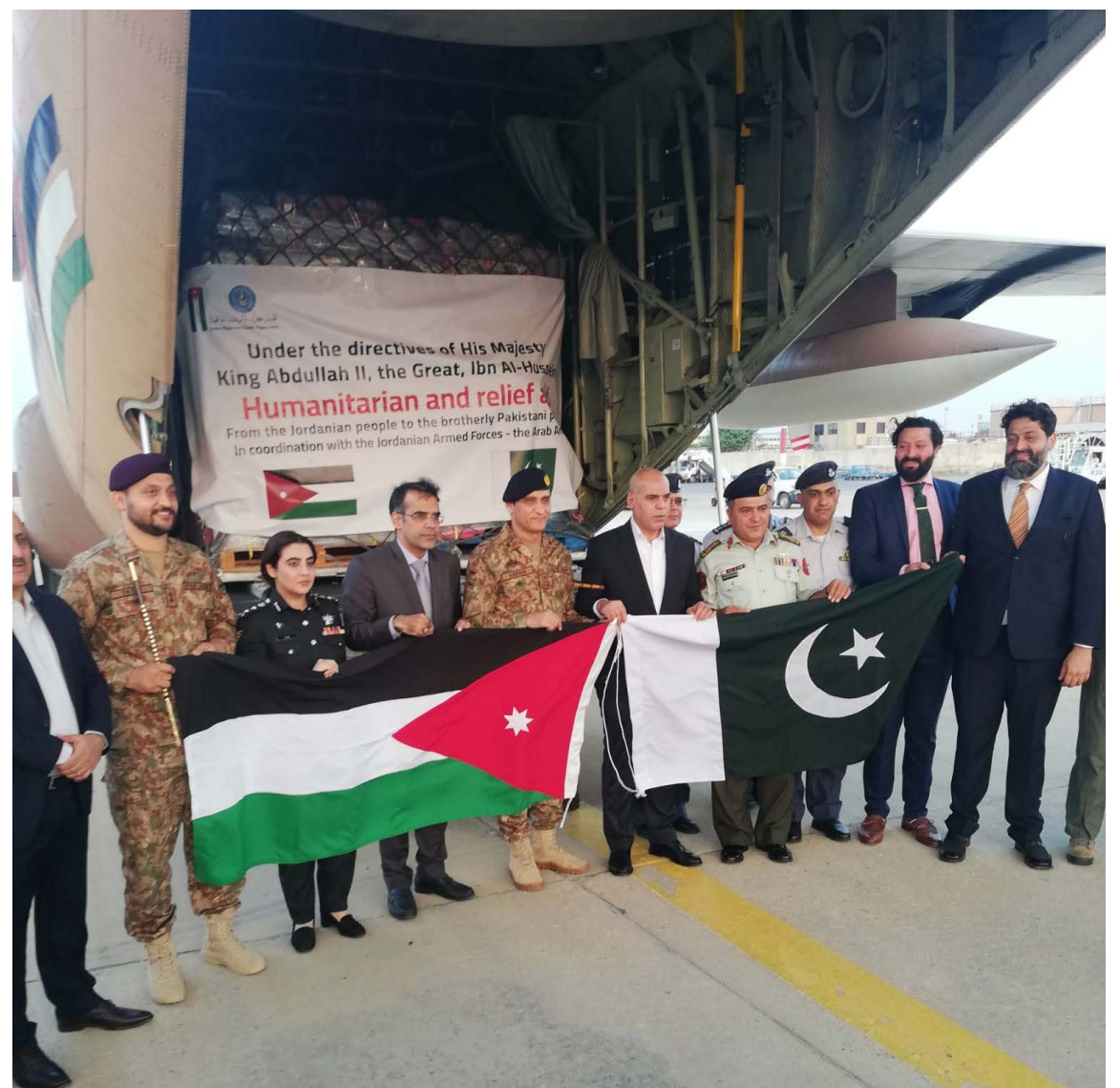
KARACHI: First humanitarian assistance flight from Jordan has landed at Jinnah International Airport Karachi, Pakistan.