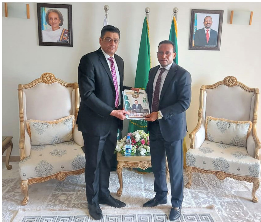
taking a business delegation to Ethiopia to promote connectivity with Ethiopian counterparts and explore business collaborations. He proposed that ICCI should sign a MoU with Ethiopian Chamber of Commerce to promote business linkages between the private sectors of both countries and assured that his Embassy would facilitate Pakistani entrepreneurs in exploring the Ethiopian market for business and investment.

He highlighted marble, pharmaceuticals, textiles and construction as potential areas of bilateral cooperation between Ethiopia and Pakistan. He said that ICCI should consider