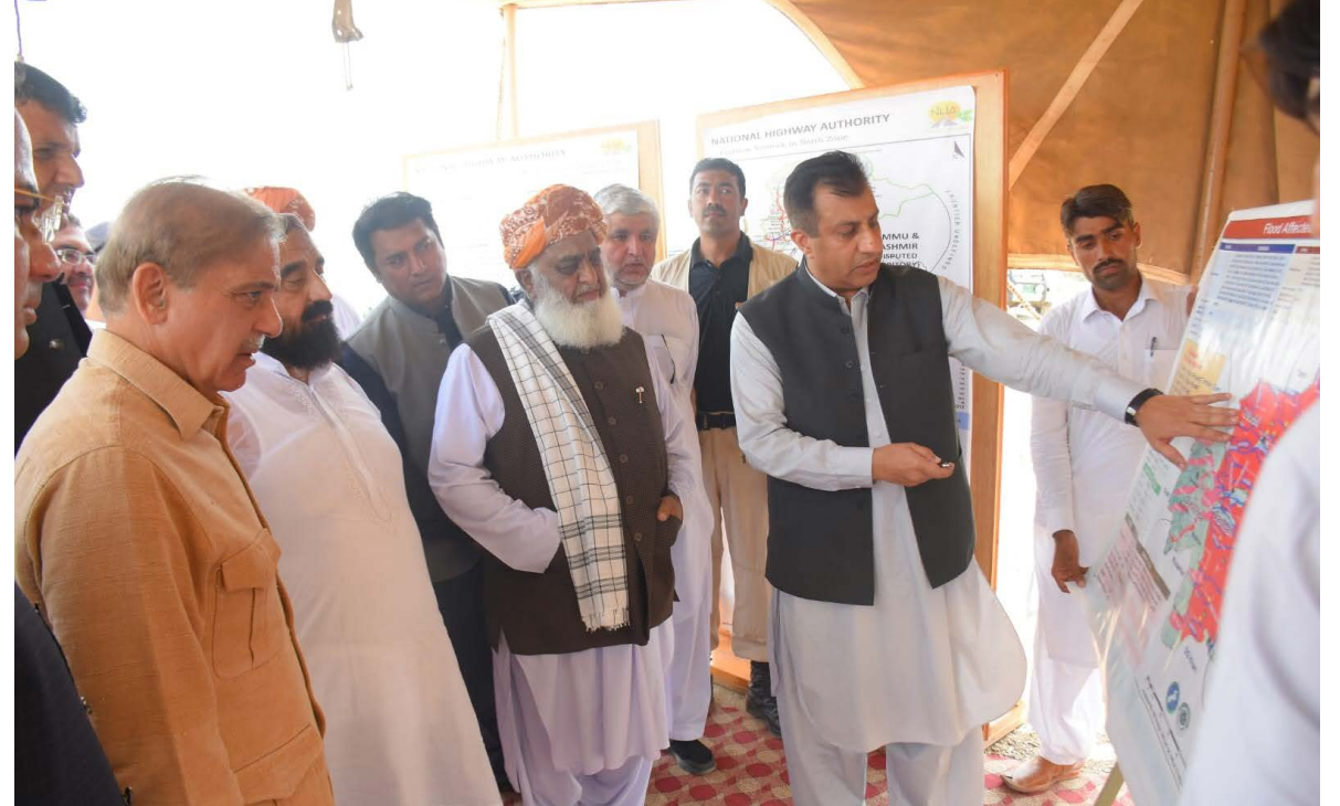
DERA ISMAIL KHAN: Commissioner Dera Ismail Khan Division briefing Prime Minister Muhammad Shehbaz Sharif regarding restoration work of Sagu Bridge over National Highway 50 (Dera Ismail Khan-Kuchlak).