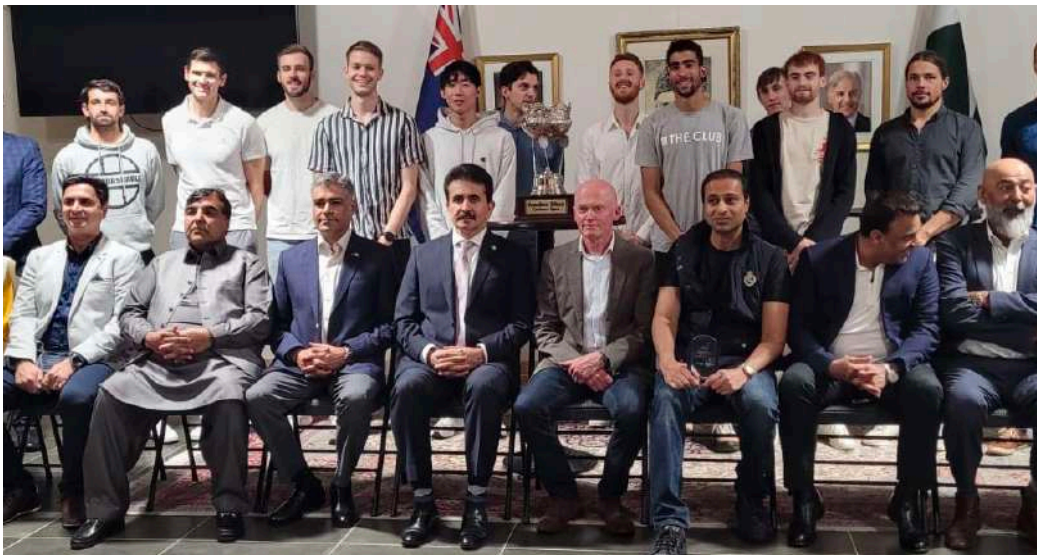
also known as "the fastest man in squash". Speaking on the occasion, High

ISLAMABAD: The inaugural Jansher Khan Canberra Open 2022 – a USD $20K Professional Squash Association (PSA) event, will be held at Woden Squash Centre, Canberra, Australia from October 18-22. To officially commence the Jansher Khan Canberra Open, an inaugural ceremony was held at the High Commission for Pakistan, Canberra. The event will see 24 top rating professional squash players from all over the world. Jansher Khan Canberra Open is named after the legendary Pakistani squash player. During his career, Jansher Khan won the World Open a record eight times, and the British Open a record six times. He is a winner of World Super Series and a Guinness World Records holder. Jansher Khan was