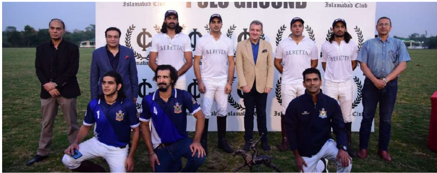
ISLAMABAD: Ambassador of Spain distributed prizes as Chief Guest at the final polo match of the Islamabad Open 2022 in Islamabad Club.

BERLIN: German Chancellor Olaf Scholz has said he will extend the operation of Germany's last three nuclear power plants, in what's been described as a snub to the Greens in his coalition government. Against the backdrop of an unprecedented energy crisis, the government had so far only agreed to keep two of the three power stations beyond the end of 2022, the date initially planned for a nuclear phase-out. A letter from Scholz to the government asks the economy, environment. —APP