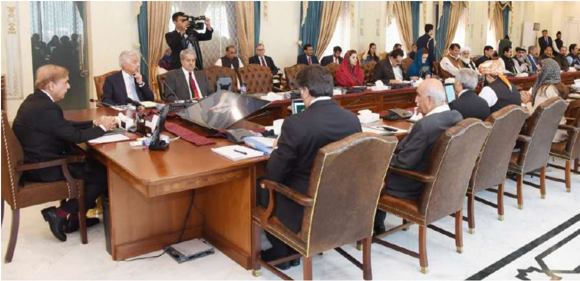
ISLAMABAD: Prime Minister Shehbaz Sharif chairs a meeting of federal cabinet.

ISLAMABAD: The Islamabad High Court (IHC) Tuesday disposed of a contempt of court petition against PPP leader Aitzaz Ahsan for his statement about state institutions. During the hearing, IHC Chief Justice Athar Minallah remarked that if Pakistan Bar Council or any other bar did have doubts about this court's impartiality, then why should the court should pay attention to an "irresponsible" statement of any person.