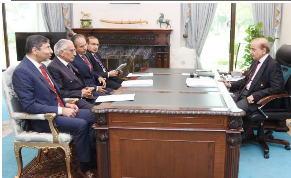
ISLAMABAD: Ambassador designate of Pakistan to France, Asim Iftekhar calls on Prime Minister Shehbaz Sharid.