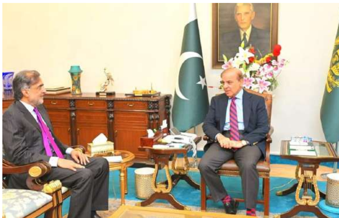
ISLAMABAD: Advisor to Prime Minister on Kashmir and Gilgit Baltistan Qamar Zaman Kaira calls on Prime Minister Shehbaz Sharif.