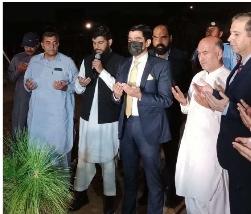
ISLAMABAD: The largest Miyawaki sector of Islamabad city has been built by the CDA administration in H-12. Chairman CDA is formally inaugurating the Miyawaki Forest.