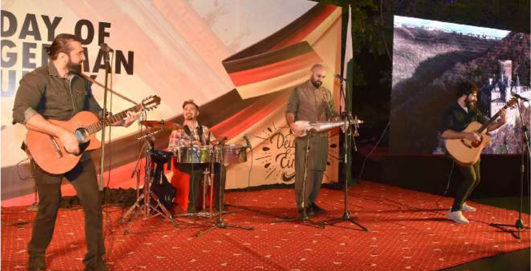
ISLAMABAD: A music band from Peshawar perform on the occasion of the Germany Unity Day.