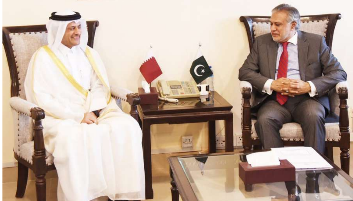
ISLAMABAD: H.E. Sheikh Saud bin Abdulrahman bin Faisal Al-Thani, Ambassador of the State of Qatar called on Federal Minister for Finance & Revenue Senator Ishaq Dar at Finance Division.

presented their work in Pakistan in video and stalls. The Peshawar based group Khumariyaan gave a musical performance. In line with the 70th anniversary of bilateral relations between Germany and Pakistan celebrated last year, commemorative coins were presented.