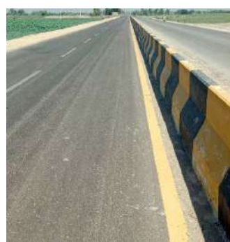
Nedro-Larkana Road constructed by W & S Sindh

& Services not dilapidated like the roads of NHA? The specifications and rates of the roads of Works & Services Department Sindh are very less compared to the roads of NHA. Despite this, the roads of W&S Sindh are in good condition. Roads of Provincial Highway Zone Sukkur visited Khairpur, Sukkur,