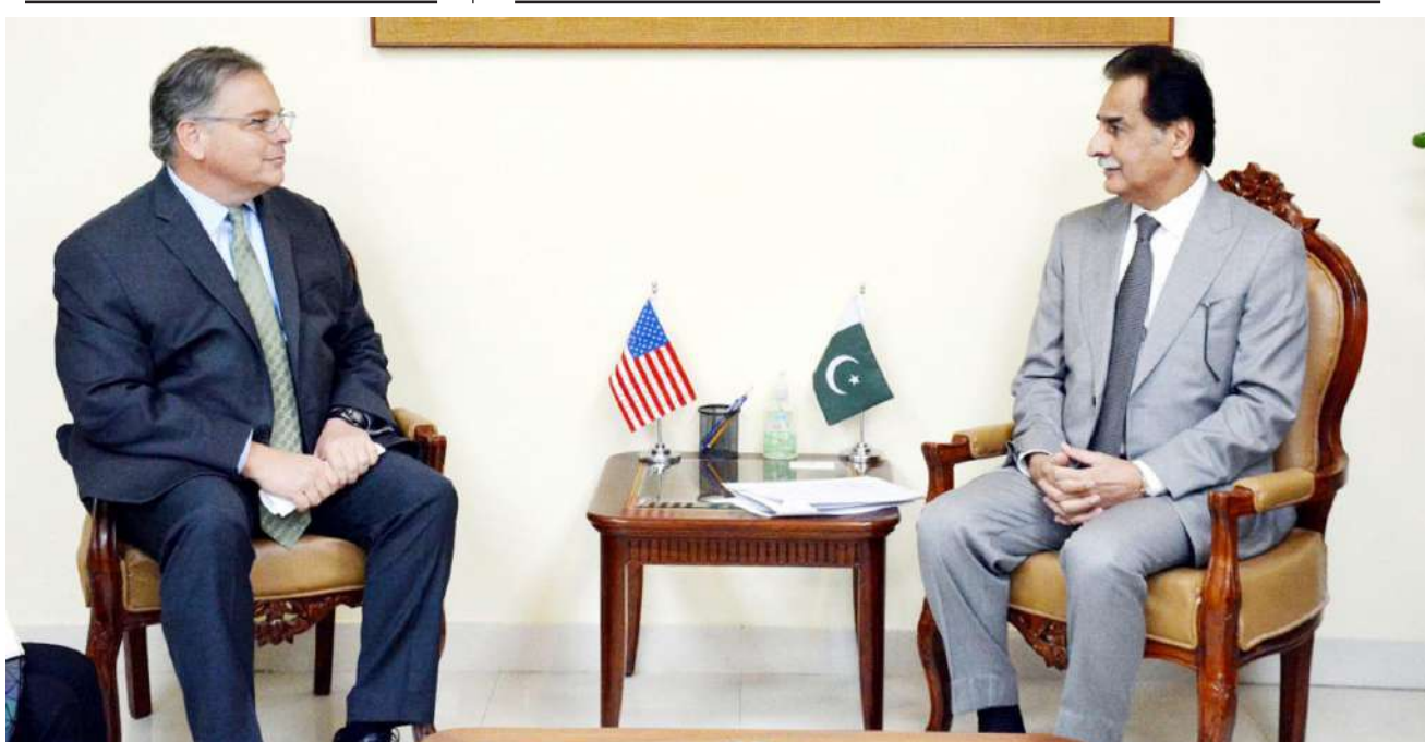
ISLAMABAD: Ambassador of USA, David Blome calls on Federal Minister for Economic Affairs Ayaz Sadiq.

Hundreds of thousands of people had been affected by the flash floods, besides losses of life and property, and standing crops, which was devastating, she added. Angela Rayner said the British Government had already donated 16.5 million pounds to the flood-affected people of Pakistan. Moreover, she added, the British Pakistani diaspora had immediately been incredible regarding the relief effort. "Many fundraisers and support have been offered, the Pakistani diaspora in the UK has been incredibly generous, and part of the reason why I'm here is that I wanted to, as a UK politician is that Pakistan hasn't been forgotten, even in my own constituency Ashton-under-Lyne underlying they've been from raising and doing so much to help the flood relief efforts." - APP