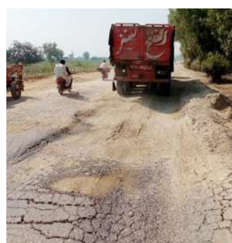
Road of NHA in Sindh

Shikarpur and Larkana Highway Divisions. All the roads were in good condition and in terms of quality all roads are in better condition than Punjab and KPK roads. Nudero Larkana road was constructed by the National Highways Authority, the other 16 km side of the same road was constructed