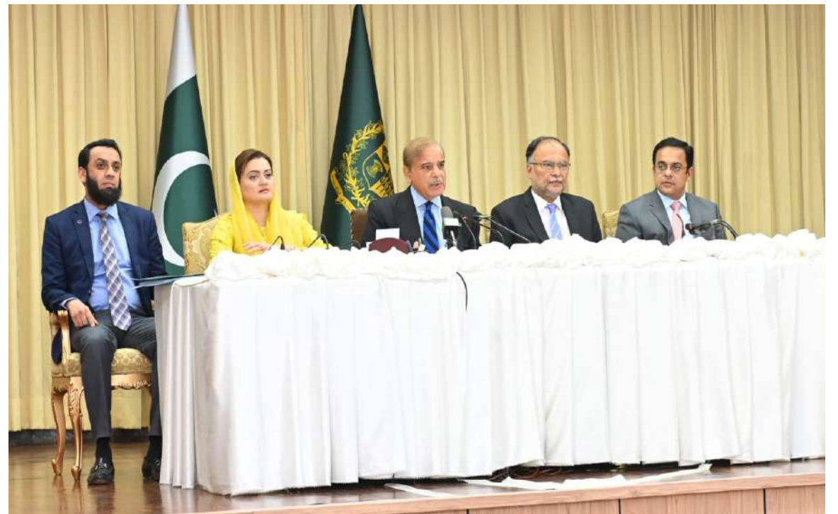
ISLAMABAD: Prime Minister Shehbaz Sharif addresses a press conference. Information Minister Marriyum Aurangzeb is also present on the occasion.

The joint session of the National Assembly today was called in line with articles 54(1) and 56(3) of the Constitution. The session was sparsely attended, with the majority of MNAs missing from both benches. Those in attendance were seen freely mingling and talking amongst one another while the president was speaking. Meanwhile, Jamaat-i-Islami Senator Mushtar Ahmed chanted slogans calling for