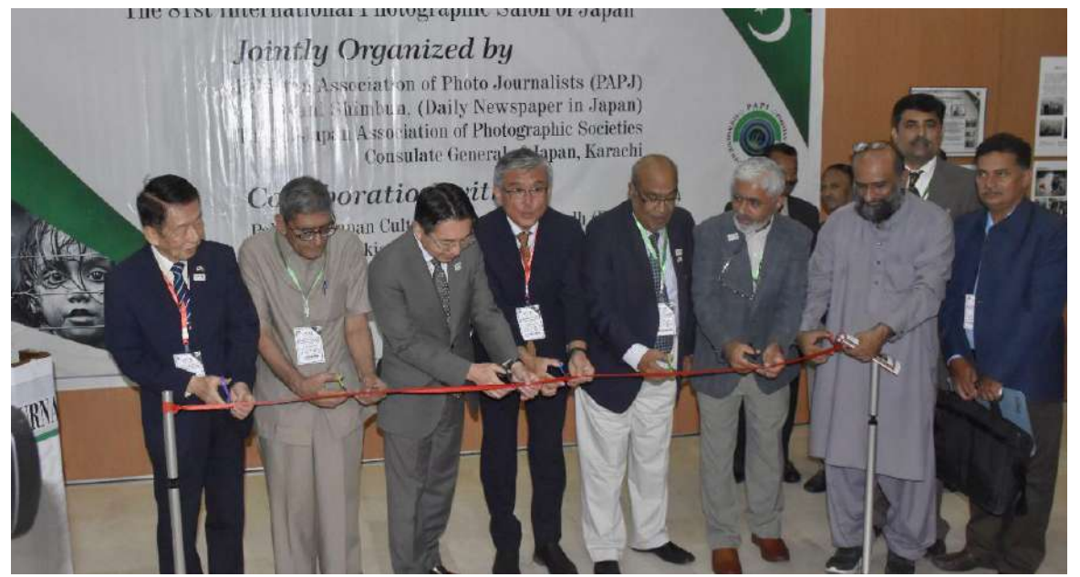
KARACHI: Japanese CG inaugurated international photo exhibition

ment was going to face, he added. The workshop consisted of four sessions: Involving Introduction of Enhancing SDG 6 Water Quality Monitoring in Pakistan led by KOMIR, Perspective of Water Quality Monitoring in development agenda of Pakistan led by MoCC, Water Policy in Korea led by K-Water and Climate Change and Water Resource Management in Pakistan led by MoCC. Korea International Cooperation Agency (KOICA) is a government aid agency of the Republic of Korea (ROK), founded in 1991. KOICA implements Korea's grant and technical cooperation of the ROK, supporting the socio-economic development of many developing countries. In 2010, KOICA opened its regional office in Islamabad, Pakistan. The office implements various projects in Transport, Energy, Water Management and Health, Rural Development. Similarly, Capacity Building on Water Quality Monitoring and SDG 6 (6.1) Reporting Project was signed as agreement to extend cooperation on enhancing water quality monitoring and to improve capacity of the Government of Pakistan to achieve SDG 6 between Ministry of Climate Change (MoCC) and Korea International Cooperation Agency (KOICA) with a cost of $7.42 million from 2019 to 2024.