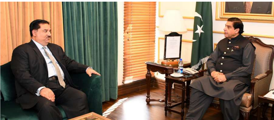
ISLAMABAD: Federal minister for power, Khurram Dastgir Khan calls on Speaker National Assembly Raja Pervaiz Ashraf. —DNA

continent and Pakistan's access to those markets can help its economy, he remarked. The High Commissioner noting the cultural and historic similarities between the two countries said the cooperation could be extended in this area of common interest. Mauritius, Rashidally said, stood by the people of Pakistan in the times of calamities and his country's government and people's recent air shipment of relief goods for the flood affected here was testimony to this. —Agencies