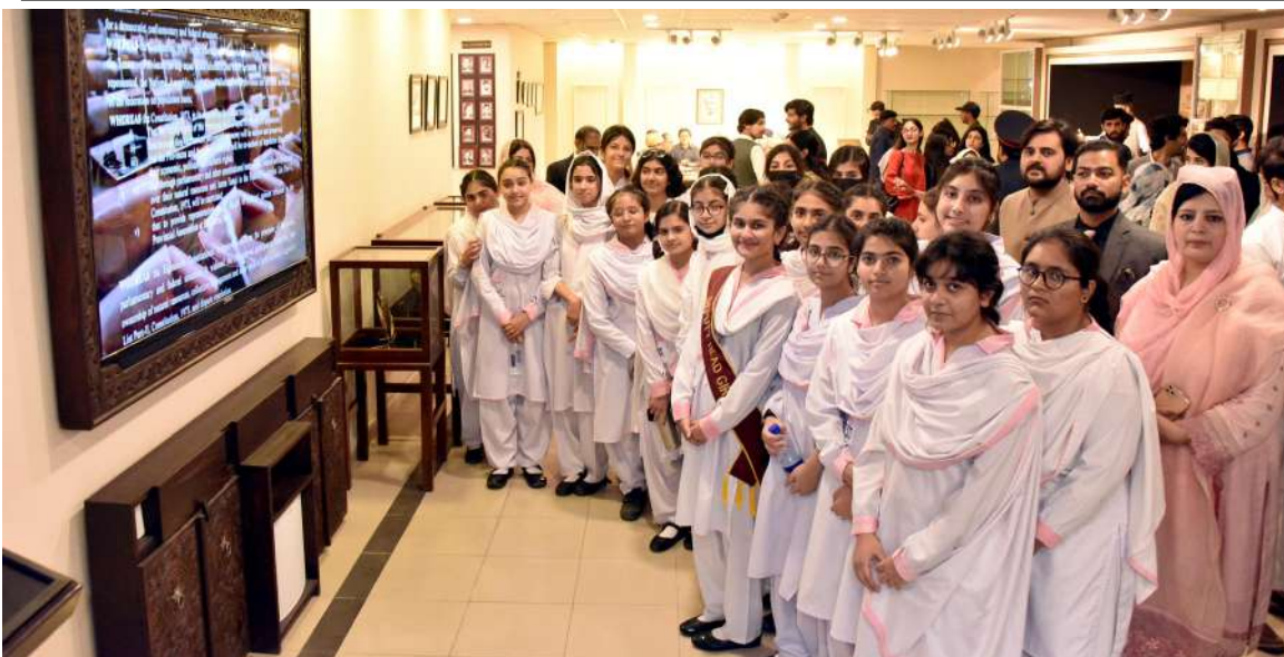
ISLAMABAD: Students and Teachers of Fazaia Education System School, E-9, Islamabad visiting Senate Museum at Parliament House.—DNA.

The second question asks whether people's general view of China get better or worse during the previous three years and why.—APP