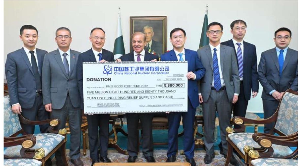
ISLAMABAD: A delegation of China National Nuclear Corporation Overseas presents a cheque for PM flood relief fund.