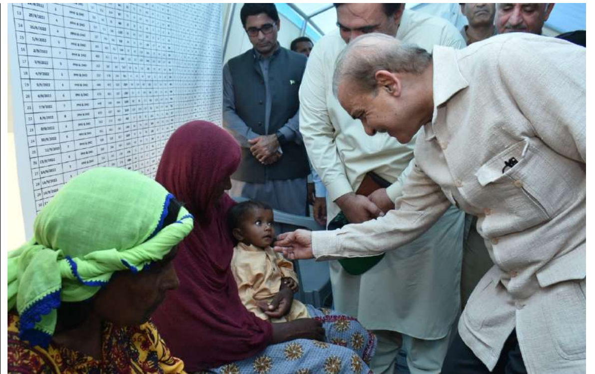
SUHBATPUR: Prime Minister Shehbaz Sharif meets flood affectees of District Suhatpur.