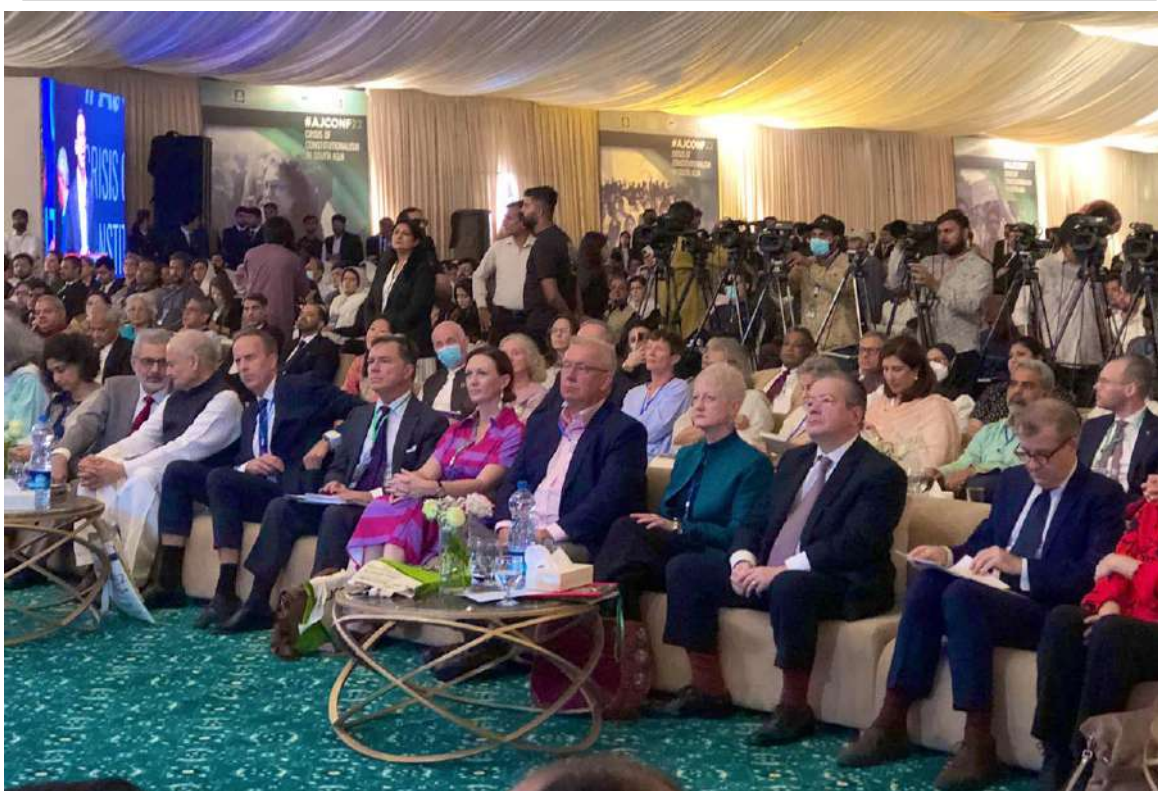
LAHORE: Ambassadors of EU, France, Spain, Sweden and others attending Asma Jahangir conference, in Lahore.

The crossings link the regions occupied by Turkish-backed militants from the so-called Free Syrian Army (FSA) to the areas controlled by Hay'at Tahrir al-Sham Takfiri terrorists. A top FSA member told Enab Baladi that Turkish forces have been stationed in the district where these two military bases are expected to be built, but the construction has not started yet.—APP