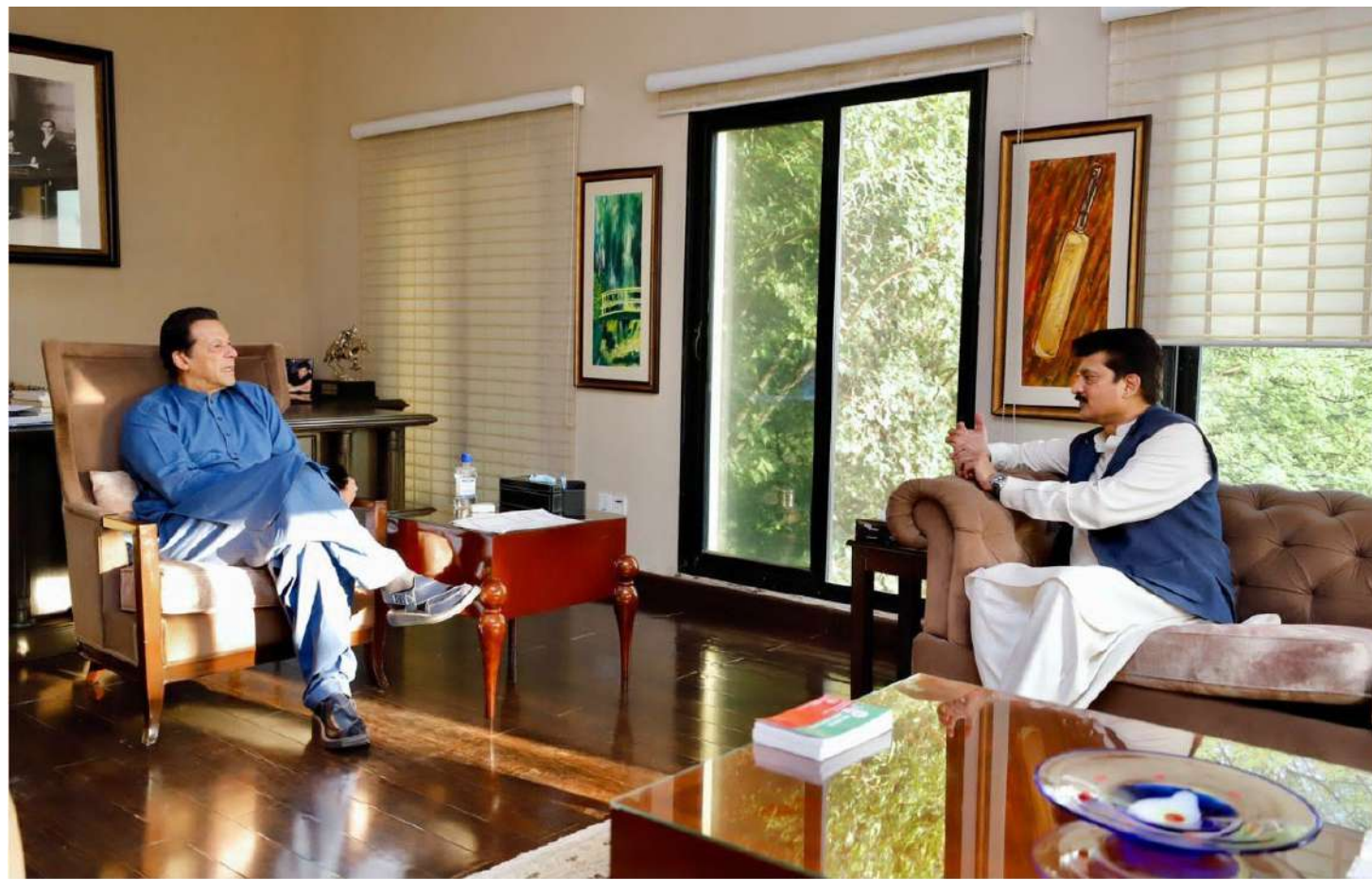
ISLAMABAD: Leader of the Opposition in Senate Dr. Shahzad Waseem calls on PTI Chairman Imran Khan.

The report also suggested the development of a national flood forecasting and early warning system based on big data technologies, improving application and early warning capabilities of satellite, radar and other monitoring systems, establishing community-oriented national mountain torrents disaster monitoring and early warning system, formulating a community-based evacuation plan and household know-how to enhance people's awareness of disaster prevention and emergency response.