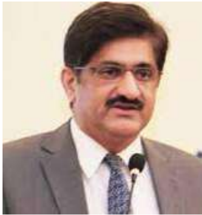
the chief minister that the bank has committed $475 million to the federal gov-

mate change victims of Sindh have lost around 1.8 million houses during the heavy downpour and floods, adding that the initial estimates showed that Rs1,500 billion were required to construct 1.8 million houses. The CM said that the world bank has pledged Rs110 billion ($500 million) against a total requirement of Rs1,500 billion. "We shall be thankful if the Asian bank meets the shortfall of Rs1,390 billion so that all the homeless people could be provided with shelter/house," he said. The visiting ADB DG told