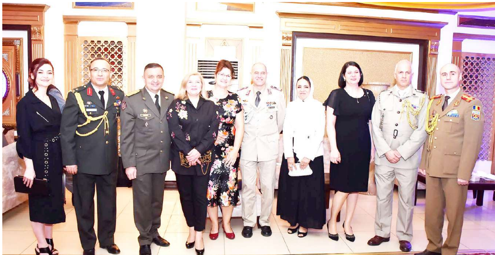
ISLAMABAD: Romanian Defence Attaché, his spouse and other guest posing for a picture on the occasion of the Armed Force Day of Romania.