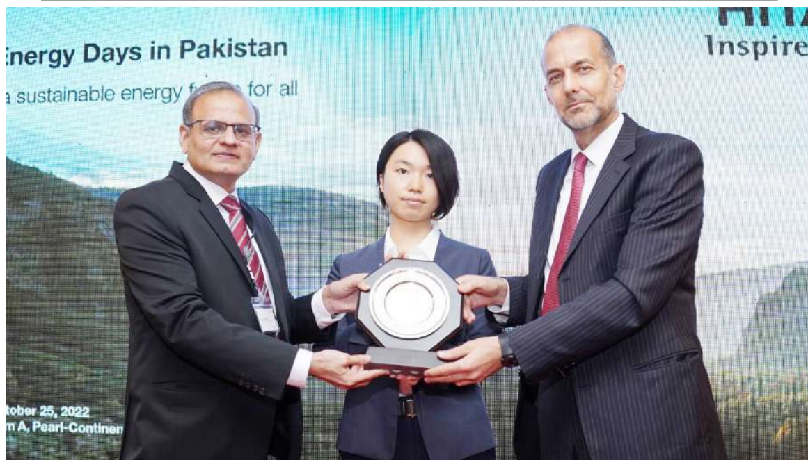
KARACHI: Ambassador of Switzerland to Pakistan George Steiner being presented souvenir during a function.

preserve national unity and tighten the noose around Israeli settlers. Meshaal went on to stress the need for turning Jenin, Nablus and other West Bank towns and villages into a strong fortress of resistance against Israel. "Al-Quds serves as a source of inspiration in order to transform the path of popular uprising (intifada) and resistance, and secure the complete liberation of occupied lands as well as return of Palestinian refugees to their ancestral homes," he stated. Early on Tuesday morning, large numbers of Israeli forces stormed the city of Nablus, located approximately 49 kilometers (30 miles) north of al-Quds. According to the Palestinian Health Ministry, five Palestinians were killed by Israeli fire. Palestinian health and security officials said one of those killed was unarmed. They identified the victims as 26-year-old Ali Khaled Antar, Mishal Baghdadi, 27; Wadee al-Hawah, 31; Hamdi Qayyem, 30; and 35-year-old Hamdi Mohamed Sharaf.