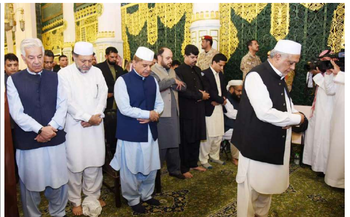
MADINAH: Prime Minister Shehbaz Sharif and others offering prayers led by Finance Minister Ishaq Dar at Roza-e-Rasool.