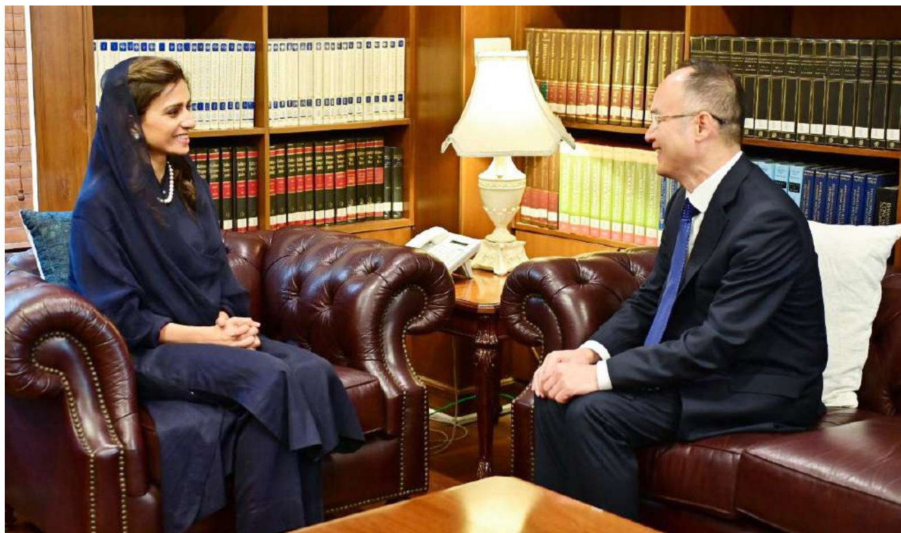
ISLAMABAD: Chinese Ambassador Nong Rong calls on State Minister for Foreign Affairs Hina Rabbani Khar. DNA

ISLAMABAD: In the latest political move, PTI approached on Wednesday the Islamabad High Court (IHC) through a petition filed for the approval of the resignations tendered by the party law makers following Imran Khan's ouster as prime minister. All the PTI MNAs resigned en masse on April 11, two days after PTI Chairman Imran Khan was ousted as the prime minister through a no-confidence motion moved by the then-opposition. Former deputy speaker Qasim Suri - who was performing his duties as acting NA speaker after Asad Qaiser resignation - had accepted all the resignations on April 15. However, once Raja Pervez Ashraf was elected as the speaker, he decided to verify the resignations by interviewing lawmakers individually.