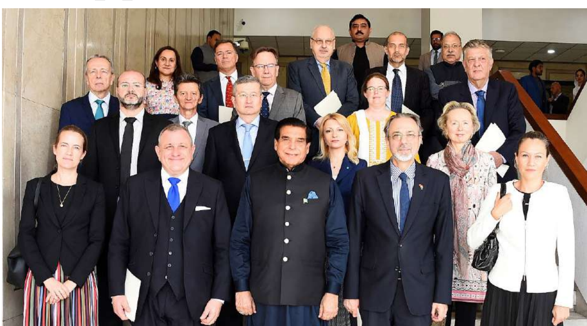
ISLAMABAD: Speaker National Assembly Raja Pervez Ashraf in group photo with Ambassadors / High Commissioners of Group 12+ countries.

ISLAMABAD: Speaker National Assembly Raja Pervez Ashraf said on Wednesday that the developed nations should lend immediate and judicious financial support to help climate-vulnerable countries like Pakistan to better cope with the impacts of climate change. "The Climate catastrophe in Pakistan is a reminder for the global community to take immediate climate action", he added. The National Assembly Speaker expressed these views in his meeting with the Twelve Plus group of the Inter-parliamentary Union