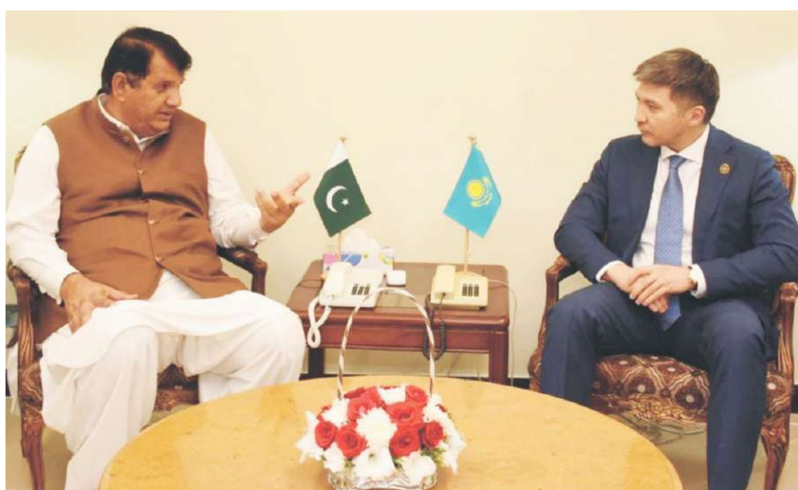
ISLAMABAD: Yezhan Kistafin, Ambassador of Kazakh stand to Pakistan called on Adviser to Prime Minister for Political, public Affairs and national Heritage & Cultural Engr Amir Muqam.

mu (Inflows 16200 cusecs and Outflow 5700 cusecs) and Panjnad (Inflows 14100 cusecs and Outflows 3100 cusecs) respectively. Similarly, in Tarbela, whose minimum operating level of 1398 feet was operating at 1533.16 feet, the Maximum water conservation level of the dam is 1550 feet, and live storage today is 4.879 million acre-feet (MAF).