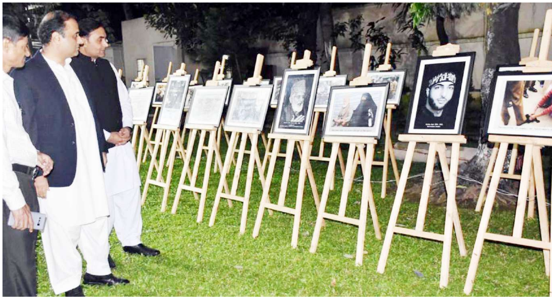
DHAKA: Pakistan's High Commissioner to Bangladesh, Mr. Imran Ahmed Siddiqui visiting Photo Exhibition organized in connection with Kashmir Black Day at Pakistan's High Commission, Dhaka.

ISLAMABAD: The 100-index of the Pakistan Stock Exchange (PSX) witnessed bearish trend on Friday, losing 462.52 points, a negative change of 1.11 percent, closing at 41,140.34 against 41,602.86 points on the last working day. A total of 177,761,063 shares were traded during the day as compared to 203,560,788 shares the previous day, whereas the price of shares stood at Rs 4.656 billion against Rs 6.364 billion on the last trading day. Some 322 companies transacted their shares in the stock market, 87 of them recorded gains, and 220 sustained losses, whereas the share price of 15 companies remained unchanged. The three top trading companies were WroldCall Telecom with 25,722,000 shares at Rs 1.32 per share, K-Electric Ltd with 13,204,000 shares at Rs 2.73 per share, and Nenergyco PK, 10,383,017 shares at Rs 4.66 per share. Sapphire FiberXD witnessed a maximum increase of Rs 81.46 per share price, closing at Rs 1,259 whereas the runner-up was Premium Tex XD with a Rs 46.01 rise in its per share price to Rs 698. Bata (Pak).—APP