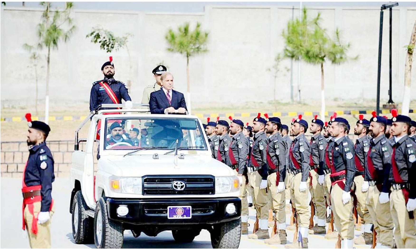
ISLAMABAD: Prime Minister Muhammad Shehbaz Sharif reviewing parade during his visit to National Police Academy to attend the passing out ceremony of 48th STP of PSP.