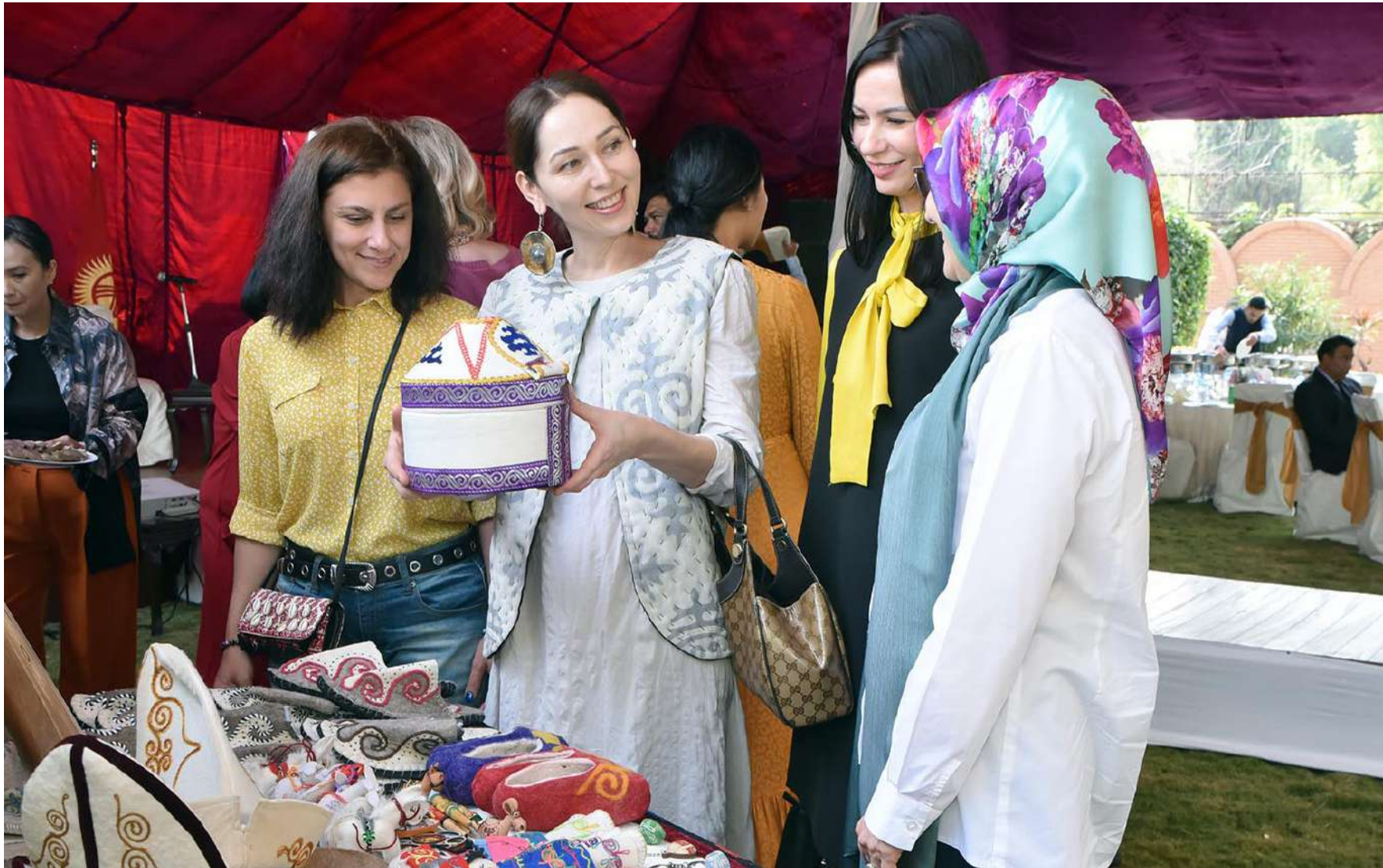
ISLAMABAD: Women taking interest in various items during a cultural event organized by the Kyrgyz embassy in Islamabad.

ISTANBUL: Turkish inflation surged past 85 percent in October, its highest level since 1997, official data showed Thursday, as President Recep Tayyip Erdogan sticks to unorthodox policies to combat a cost-of-living crisis. Central banks worldwide are raising borrowing costs in efforts to tame soaring consumer prices, but Turkey has bucked the global trend, with Erdogan calling higher interest rates his "biggest enemy". Last month, Turkey's central bank cut its policy rate for a third consecutive time, bringing it down to 10.5 percent from 12 percent. With an election looming next year, Erdogan argues that high rates are the cause of inflation, not the opposite, in defiance of orthodox economic theories. Turkey's inflation has steadily risen since reaching a low of 16.6 percent in May 2021. It hit 85.51 percent in October, according to state statistics agency TUIK, up from 83.45 percent in September. - APP