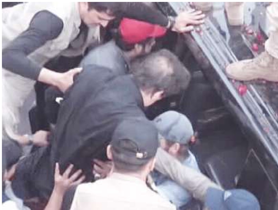
WAZIRABAD: PTI Chairman Imran Khan being shifted to armored car after he got injuries in firing incident (left). Senator Faisal Javed got bullet injuries (top right). Alleged shooter records his confessional statement before the police (bottom right).