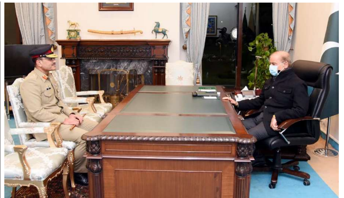
ISLAMABAD: Chief of the Army Staff (Designate) Gen. Syed Asim Munir and Chairman Joint Chiefs of Staff Committee (Designate) Gen. Sahir Shamshad Mirza called on Prime Minister Muhammad Shehbaz Sharif in separate meeting.