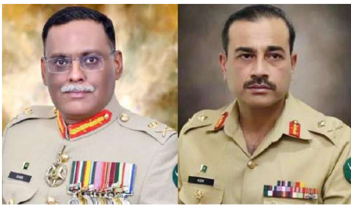
Gen. Sahir Shamshad Mirza

Appointments sealed after President approves PM's nominees for COAS, CJCSC