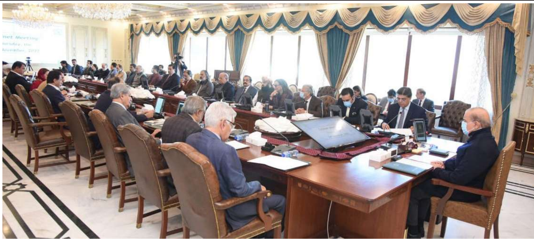
ISLAMABAD: Prime Minister Muhammad Shahbaz Sharif chairs federal cabinet meeting.