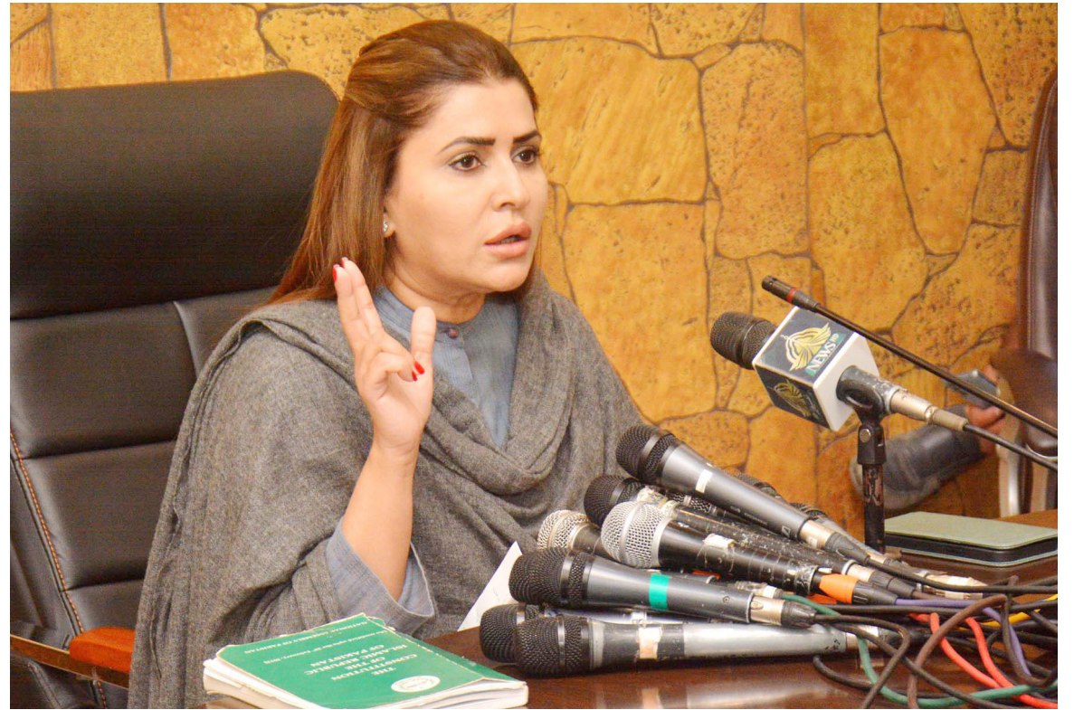
KARACHI: Federal Minister for Poverty Alleviation and Social Safety Shazia Marri addressing a press conference.