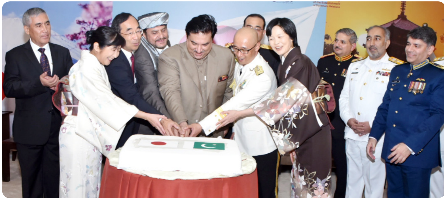
ISLAMABAD: Federal Minister for Power Khurram Dastgir, Ambassador of Japan, Defence Attache of Japan, Lt. Gen Asim Munir, Quarter Master General Pakistan Army and others cutting cake to celebrate Self Defence Forces Day of Japan. - DNA