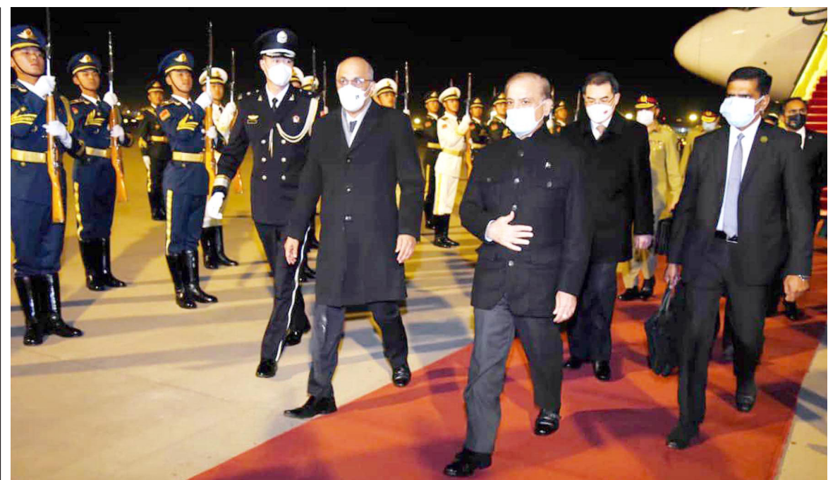
BEIJING: Prime Minister Shehbaz Sharif being presented with guard of honour upon his arrival in Beijing.

Both leaders reiterated the desire to further enhance bilateral relations in all fields, the ISPR said. The visiting dignitary expressed his grief over the devastation caused by floods in Pakistan and offered sincere condolence to the families of the victims. The French ambassador also appreciated Pakistan's efforts for regional stability and pledged to play his role in further improvement in diplomatic cooperation with Pakistan at all levels.