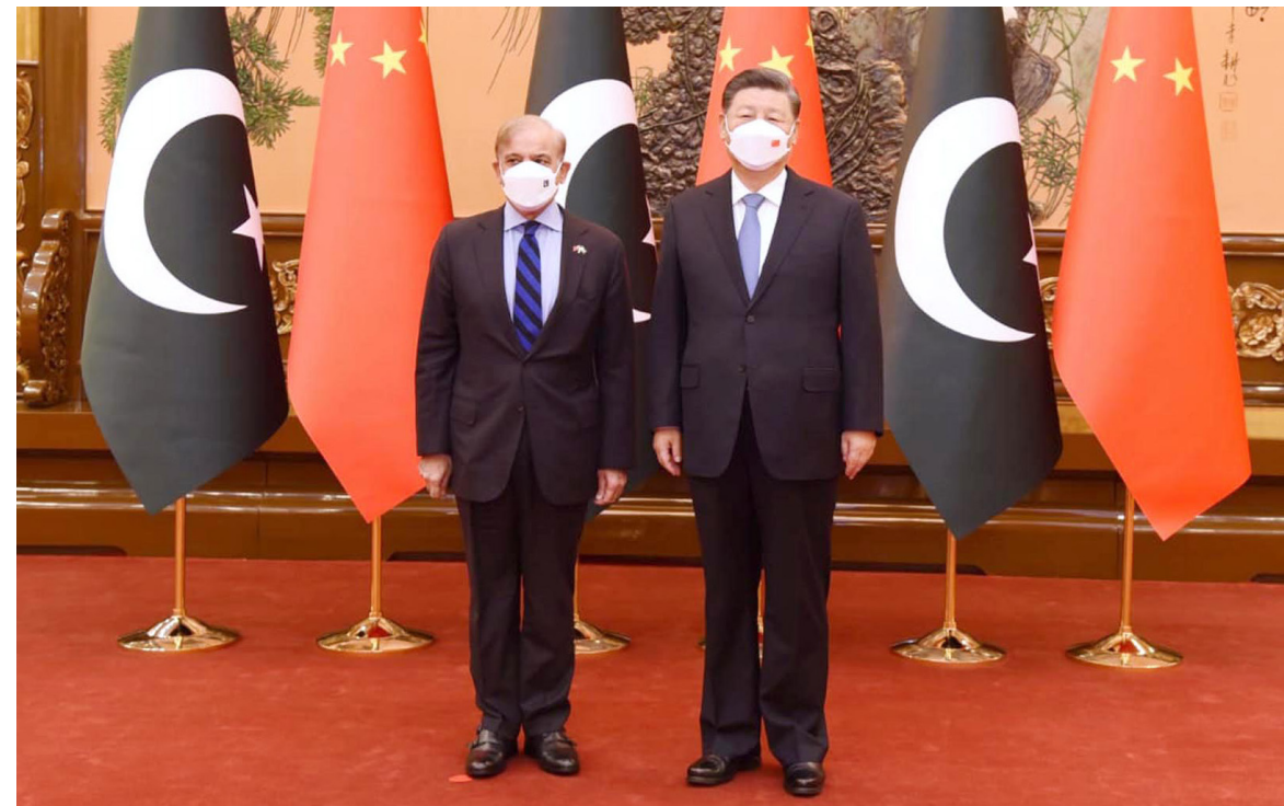
BEIJING: China's President Xi Jinping and Prime Minister Shehbaz Sharif pose for a photo before their meeting.