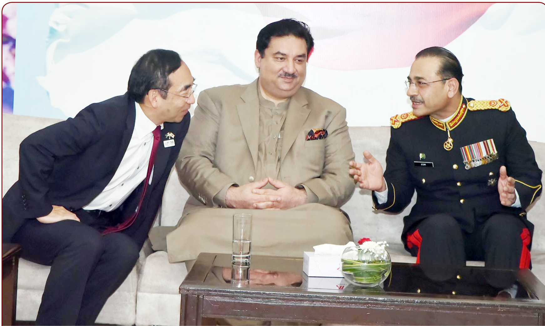
ISLAMABAD: Federal Minister Khurram Dastgir, Quarter Master General Pakistan Army Lt. General Asim Muneer and Ambassador of Japan confer on the occasion of the Self Defence Forces Day of Japan.

Timely issuance of new electricity connections, delivery of electricity bills at accurate address should be made 100% possible, he added. He asked the chief executive to ensure the availability of electricity meters, transformers, cables, poles and other materials in stores.—APP