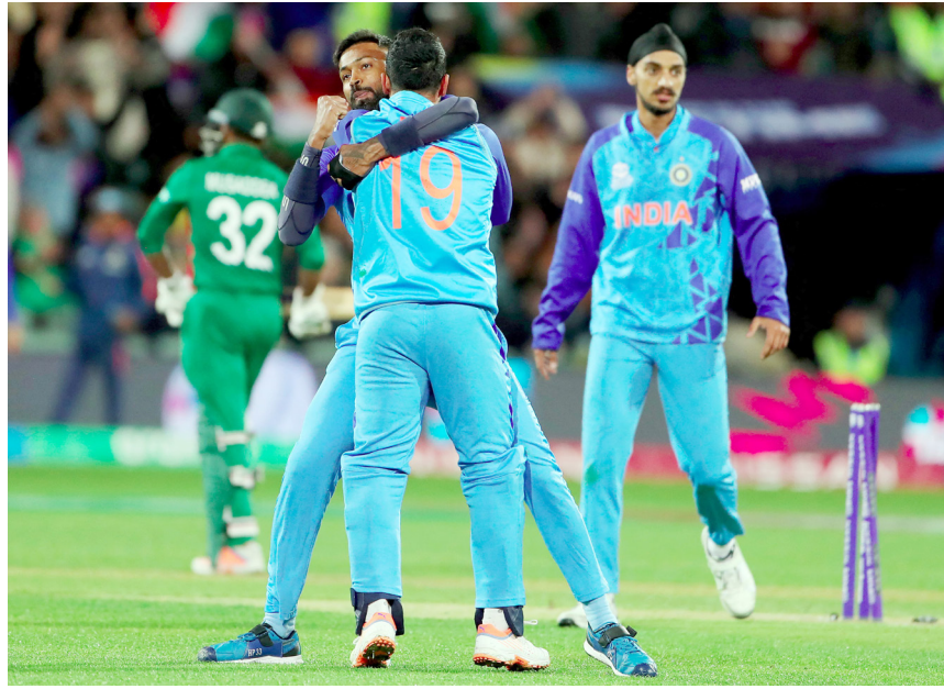
Pandya took two wickets in the 13th over as Bangladesh slumped from 98-2 to 108-6 and despite Hasan's 14-ball 25, fell short of their DLS method target. It was Kohli, who hit an unbeaten 64, and

ADELAIDE: Virat Kohli became the highest run-scorer in Twenty20 World Cup history Wednesday as India edged Bangladesh by five runs in a crunch rain-hit Twenty20 World Cup clash in Adelaide that went to the last ball. India got top of Group 2 and can clinch a semi-final spot with a win against Zimbabwe in their final Group 2 match on Sunday after Bangladesh faltered in their revised chase of 151 in 16 overs. Kohli's unbeaten 64 had steered India to 184-6 but Bangladesh had looked on course for victory after racing to 66-0 in seven overs when rain stopped play causing four overs to be lost. Opener Liton Das hit a 27-ball 60 but his run out after the 50-minute interruption heralded a Bangladesh collapse and ended on 145-6. Needing 20 off the final over, Nurul Hasan gave them hope with a six and a four but left-arm quick Arshdeep Singh held his nerve on the last ball to hand India their third win in four matches. It leave Bangladesh all but out of the semi-finals picture. Das gave the team a blazing start, reaching his fifty in 21 balls, but once he fell to KL Rahul's direct hit India came roaring back. Arshdeep struck twice in one over including the prize of captain Shakib Al Hasan for 13 to turn the tables. Hardik