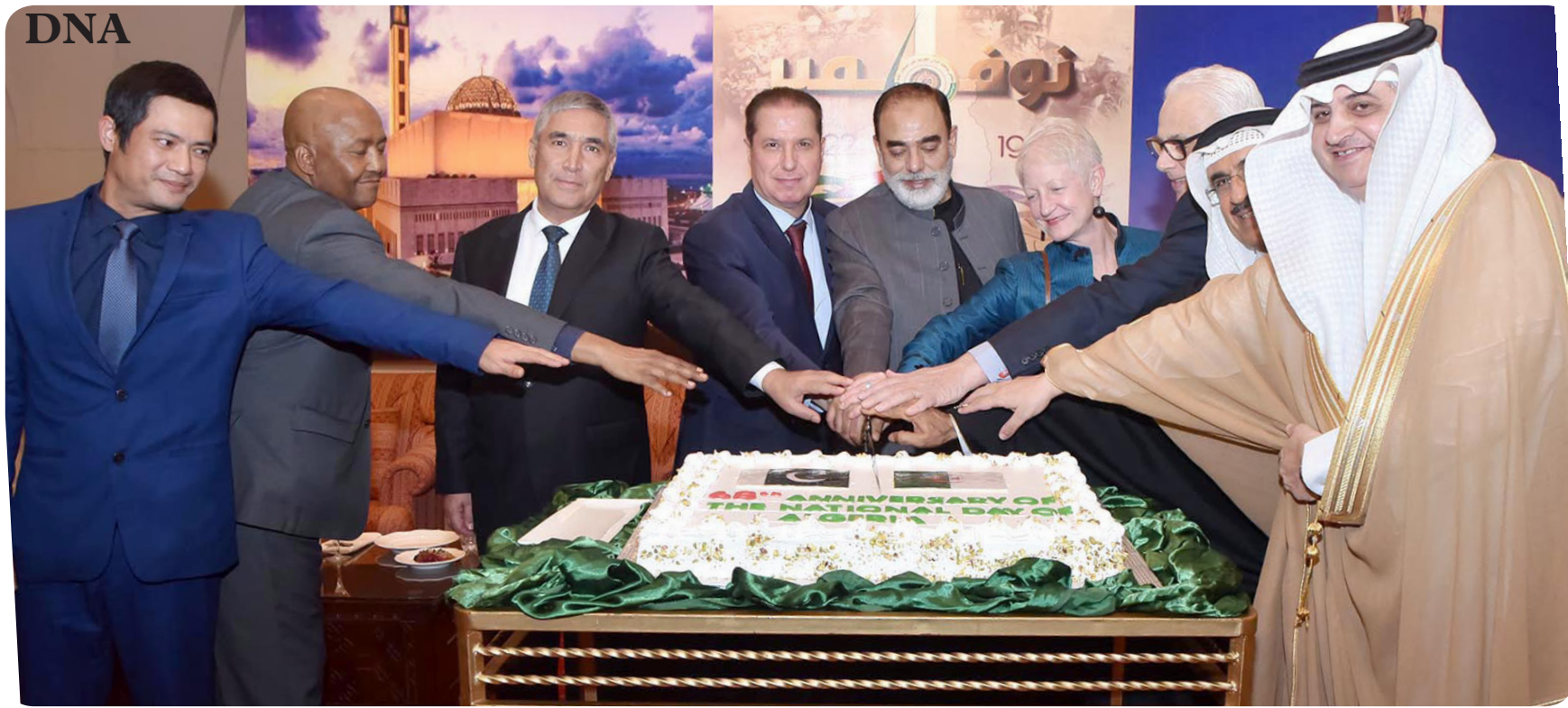
ISLAMABAD: Chief guest Senator Talah Mahmood, Minister for SAFRON, Ambassadors of Vietnam, South Africa, Algeria, EU, Brazil, Bahrain and Saudi Arabia cutting cake to celebrate National Day of Algeria. – DNA