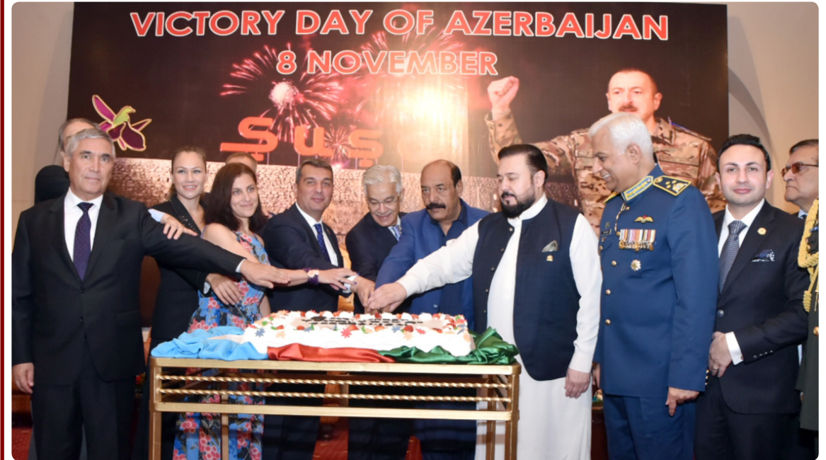
ISLAMABAD: Chief Guest Defence Minister Khawaja Muhammad Asif, Israr Tareen Minister for Defence Production, Ambassador of Azerbaijan Khazar Farhadov and others cutting cake to mark Victory Day of Azerbaijan.