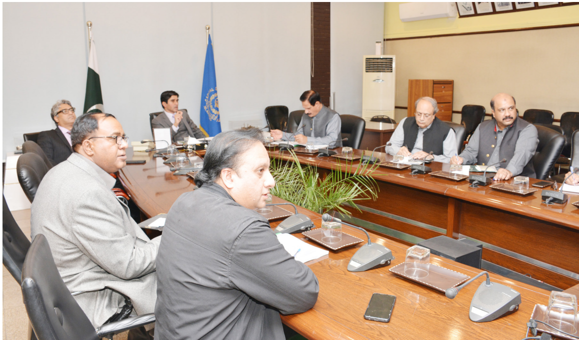
ISLAMABAD: Chairman CDA Capt Usman presiding over a high level meeting.

abad. He further said that the existing two colors should be used for color coding of curb stones. Similarly, where the length of the road is longer, yellow and black colors should be used, and where the length of the road is less, only yellow color should be used. It is pertinent to mention here that the color coding of curb stones will help in determining the driving speed on every road of Islamabad city. In this regard, a comprehensive plan has also been submitted to Chairman CDA for approval by the concerned departments. On this occasion, Chairman CDA issued instructions and asked the Director Traffic Engineer to prepare the entire plan according to international standards and re-submit the plan for approval. Chairman Capital Development Authority Captain (R) Muhammad Usman Younis further said that these measures will not only save fuel and time of the citizens but also help control environmental pollution.