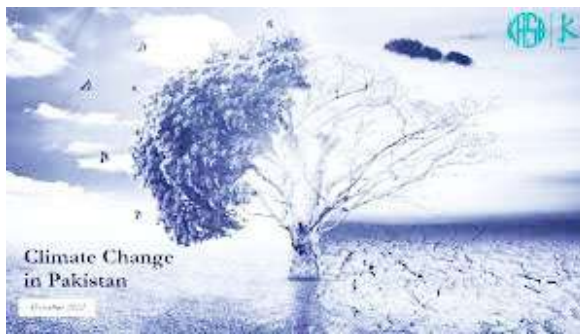
Climate Change in Pakistan

According to the report discussed during the seminar, the developed countries should shoulder more. As per the United Nations Framework Convention on Climate Change, the developed world should bear a greater financial responsibility in tackling climate change and bear more financial obligations. There should be a fair and reasonable reduction in emissions, climate finance mechanisms, increased technical and financial support and urged for a stabilized global supply chain of new energy. "solar is the most