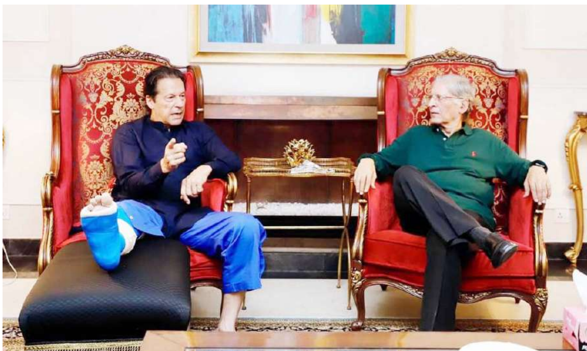
LAHORE: PPP leader Barrister Aitzaz Ahsan meets Chairman PTI Imran Khan to enquire about his health.