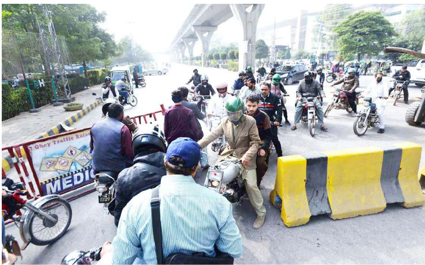
RAWALPINDI: Peoples are facing severe difficulties due to the closure of the road by the protest of Tehreek-e-Insaf at Murree Road.