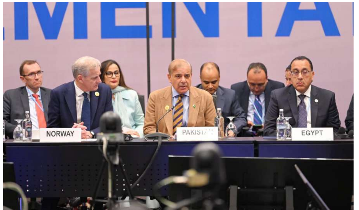
SHARM EL-SHEIKH: Prime Minister Shehbaz Sharif co-chairs a high level round table during COP-27 summit. - DNA

arrests of culprits involved in this act. So far no any arrest was made. Media believe that watchman of the school was also picked up by alleged terrorists. However he was made free on Tuesday morning. The newly established and constructed Girls Middle School recently are operative with two female teachers and two watchmen. It enrolled 68 female/Girls students in its 7th classes. In Gilgit Baltistan similar attacks against schools and other terror acts are taking place from last two decades. In early August of 2018, unknown militants attacked at least 14 Girls schools in Chilas area of Diamir Dubudion. Likewise several foreign mountaineers were included amongst killed in militants attacks in 2013. And at least 18 Shia pilgrims upon return from Iran have been disembarked from a passenger bus and brutally assassinated in this particular area in 2012.