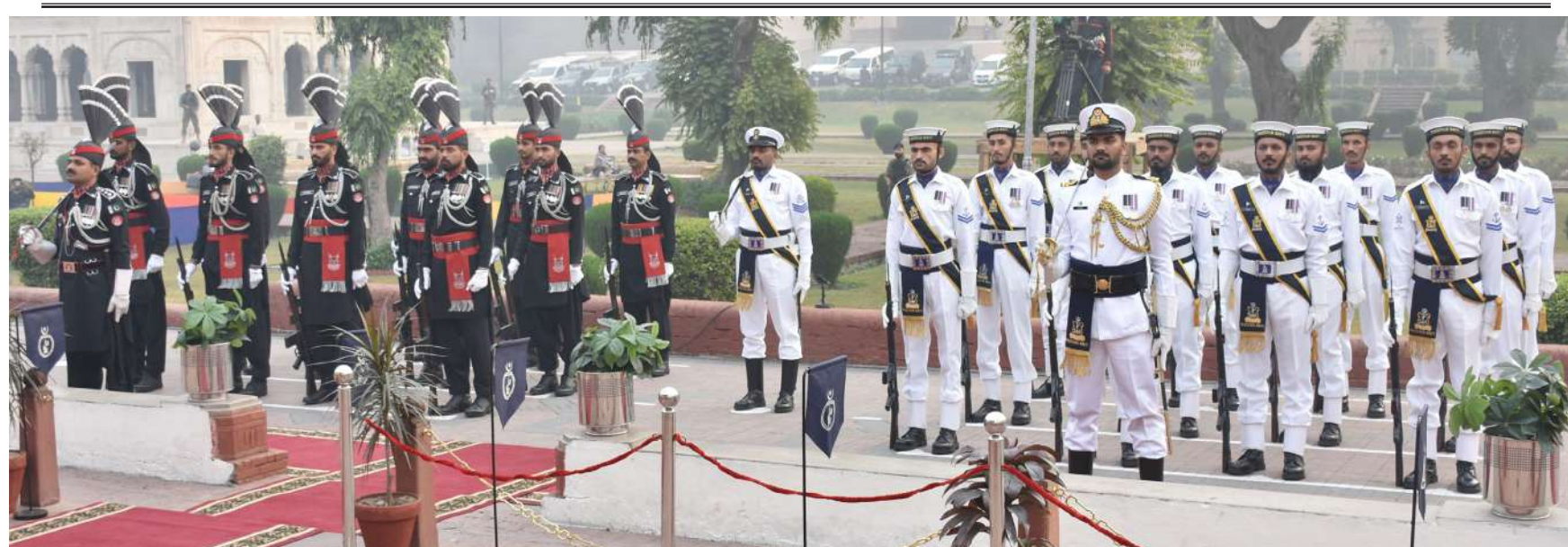
LAHORE: Change of guard ceremony being held at Mazar-e-Iqbal.

LAHORE: Jamaat-e-Islami ameer Sirajul Haq inquired after the health of PTI chairman Imran Khan at Zaman Park on Wednesday. He prayed for the recovery of the PTI workers injured in the attack. During the meeting, Sirajul Haq proposed to introduce the proportional representation to make the electoral issues transparent. Imran Khan agreed to forward the proposal in party meeting. Talking to the media after the meeting, Sirajul Haq said that the general elections are of no use without electoral reforms. "Under the present circumstances, no one will accept the election." He welcomed the decision of the establishment, saying that the politicians should let the establishment away from politics.