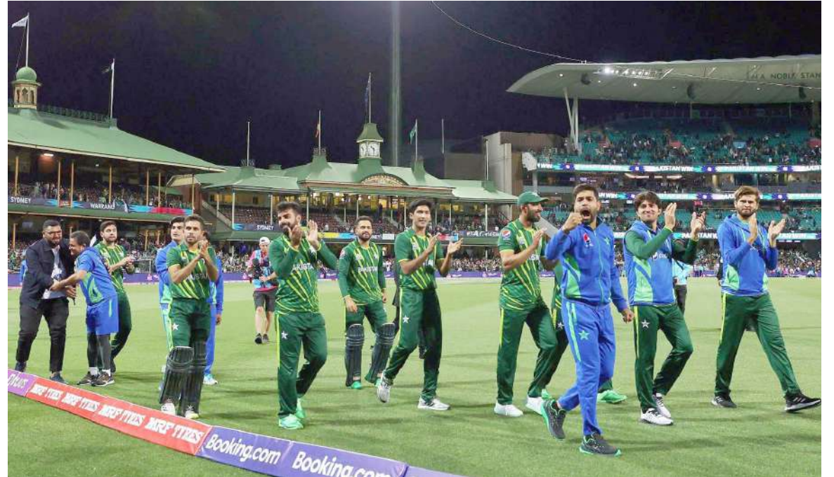
SYDNEY: Pakistan cricket players greet fans after booking their place in T20 WC Final.