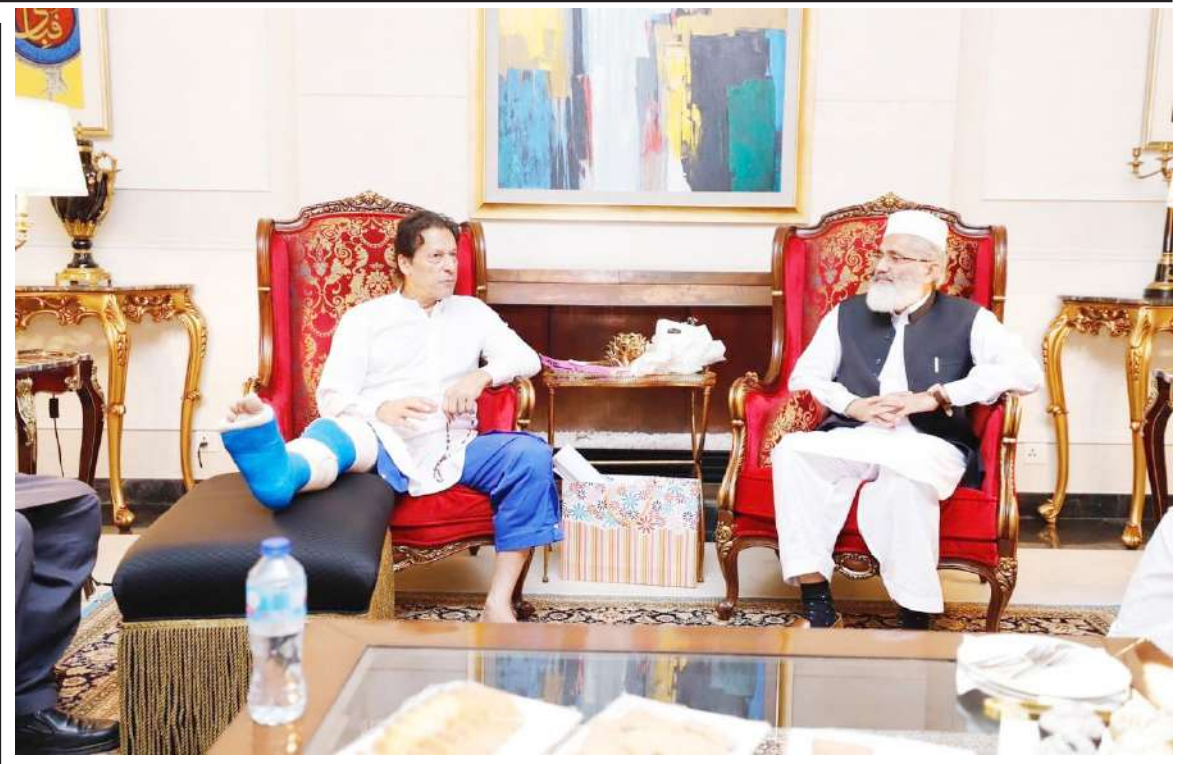
LAHORE: Ameer Jamaat e Islami Pakistan, Senator Siraj ul Haq meets Former PM Imran Khanto acquire about his health.

The president appreciated the digital transformation initiatives of KP government and emphasised the need to further speed-up the efforts in this regard.