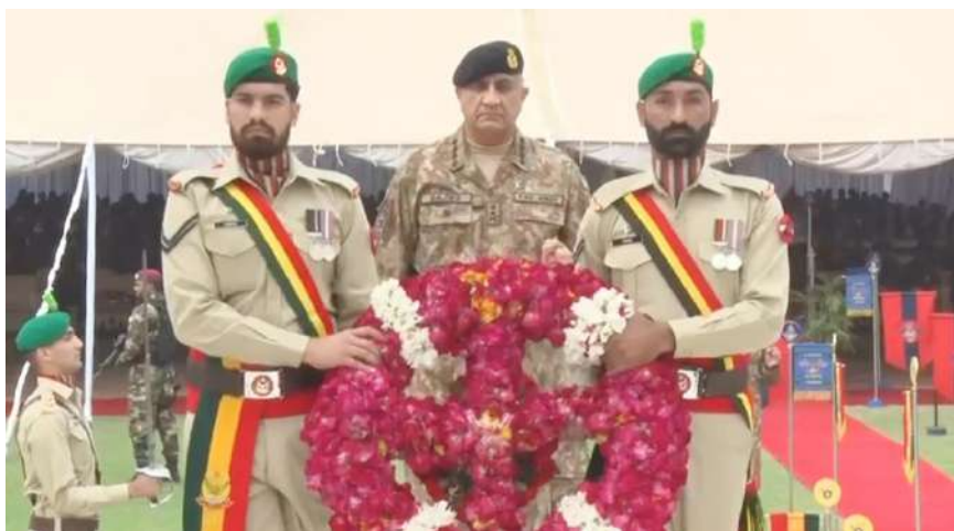
PESHAWAR: Chief of Army Staff General Qamar Bajwa laying a floral wreath at Yadgare-Shuhada during visit to Peshawar Corps HQ.