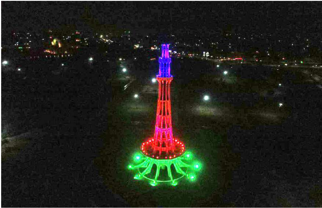
LAHORE: "Minar-e-Pakistan" - the historical & beautiful monument of Pakistan was lit up with the Azerbaijani flag colors to celebrate the 2nd anniversary of the Victory Day of Azerbaijan. First time in its history, this monument was illuminated with any foreign country's flag.