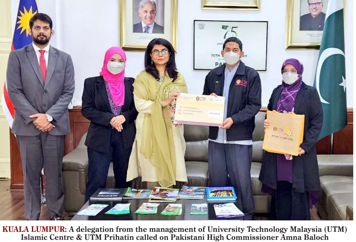
to present a donation cheque for the flood-affectees in Pakistan.

BRUSSELS: Qatar's labor minister responded to allegations about the conditions of migrant workers involved in construction work for the World Cup, saying a mechanism is already in place for those seeking compensation. In response to boycott calls from some politicians and human rights organizations in European countries following reports of some workers dying or being injured during the construction work, Ali bin Samikh Al Marri said: "Have you ever boycotted any previous editions of the World Cup?" "I just would like to confirm that each and every one of you is welcomed in Qatar to attend the matches," he added. Touching on allegations that some workers in Qatar have been unjustly treated, Al Marri said "there is a mechanism to which everyone can resort in order to seek remedy and get compensation." "At least $350 million has been given as compensation to workers," he said. The allegations about his country may have derived from a lack of communication, he said, adding the proper information on the issue should be received from the right source. Al Marri invited everyone to Qatar for the FIFA World Cup, saying: "I can confirm to you that the Qatar World Cup will be the best in football history." The 2022 World Cup, hosted by Gulf nation of Qatar, is set to kick off on Nov. 20 and end on Dec. 18. - APP