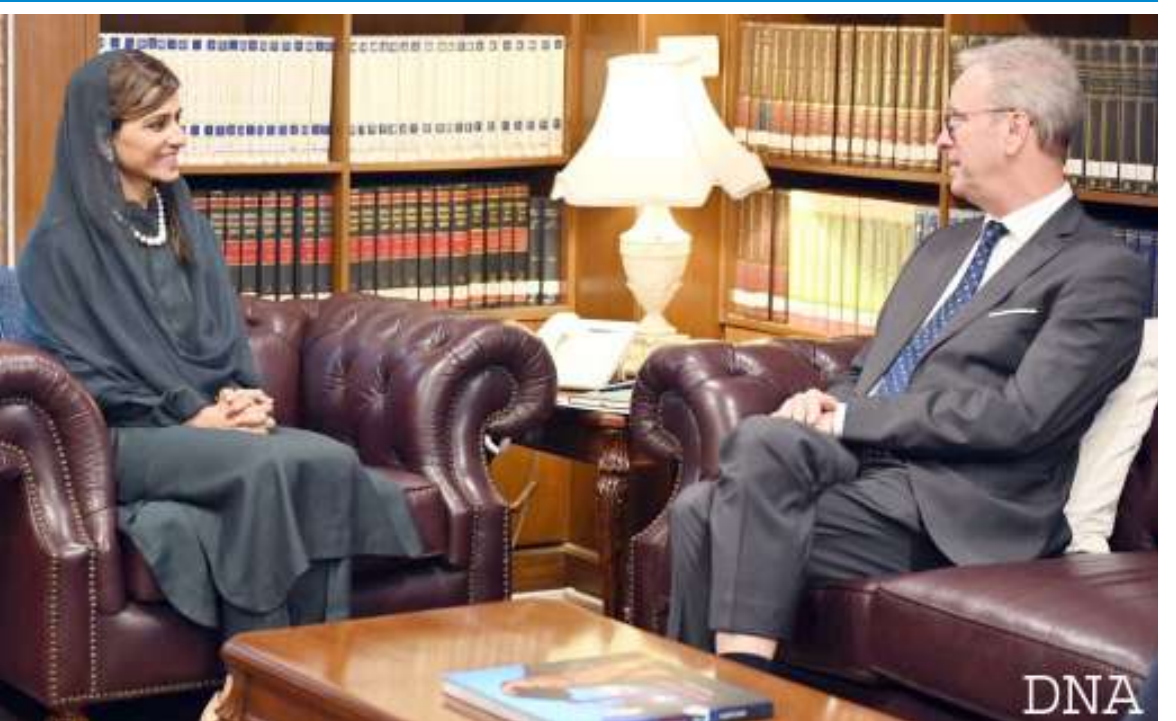
ISLAMABAD: Mr. Charles Delogne, Ambassador of Belgium in Pakistan called on Minister of State for Foreign Affairs Hina Rabbani Khar. They took stock of bilateral relations while stressing the need for further enhancing trade and investment ties. Important regional and global matters were also discussed.