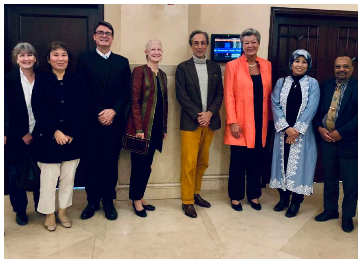
ISLAMABAD: Heads of the UN organizations based in Pakistan posing for a picture with the visiting EU commissioner.

The Islamabad Museum is the entity of the Federal Department of Archaeology and Museums, National Heritage and Culture Division. The Museum was established in September, 2002. In the Museum, an effort has been made to delineate the saga of evolution of cultures and civilizations in Pakistan through display of artifacts, and works of arts. The Museum covers the history of Pakistan through the artifacts displayed in chronological order, incorporating one of the earliest man-made tool, dating back to 2 million years, collected from Soan Valley, nine thousands years old objects from Mehrgarh (Balochistan), artifacts of world celebrated Indus valley civilization and statutory of Gandhara Civilization. The antiquity representing Kot Digi, Gandhara Grave Culture.—APP