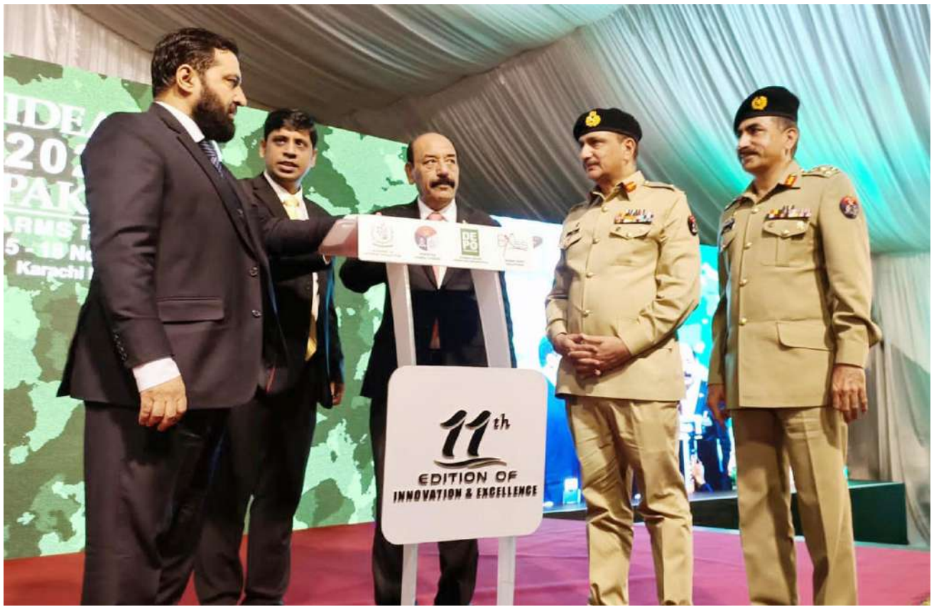
KARACHI: Federal Minister for Defense Production Muhammad Israr Tareen reveals logo of Ideas 2024 at closing ceremony of Ideas 2022.

be the North's most powerful such test yet. US Vice President Kamala Harris convened a meeting on the sidelines of an Asia-Pacific summit in Bangkok to discuss the launch with regional leaders. North Korea has fired scores of ballistic missiles this year – far more than any other year on record – and recent launches have been increasingly provocative, including firing a missile over Japan last month, triggering a rare air raid warning. On November 2, Pyongyang fired 23 missiles, including one which crossed the de facto maritime border and landed near the South's territorial waters for the first time since the end of hostilities in the Korean War in 1953. Seoul called it "effectively a territorial invasion". The next day, North Korea fired an ICBM – although Seoul said it appeared to fail mid-flight. – APP