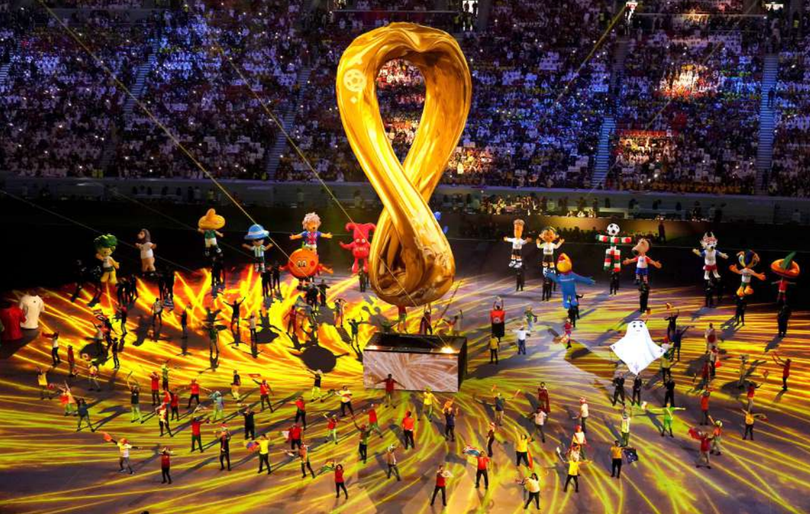
AL KHOR: Performers doing the act during the opening ceremony of FIFA World Cup 2022.

DNA JEDDAH: Planning Minister Ahsan Iqbal on Sunday categorically dismissed rumours related to Pakistan's default risks, terming them the "PTI's propaganda" for mere politicking. His remarks come after former premier Imran Khan and his party members raised alarms about the economic situation and alleged that govt is not able to control it. In an address at Pakistani Consulate in Jeddah, Iqbal said the government had adopted a path of stability and saved the country from going towards a default.