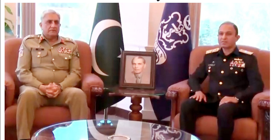
ISLAMABAD: Army Chief General Qamar Javed Bajwa in a meeting with Chief of Naval Staff Admiral Muhammad Amjad Khan Niazi.

Visits Rawalpindi Corps HQ and lays a floral wreath at Martyrs' Monument