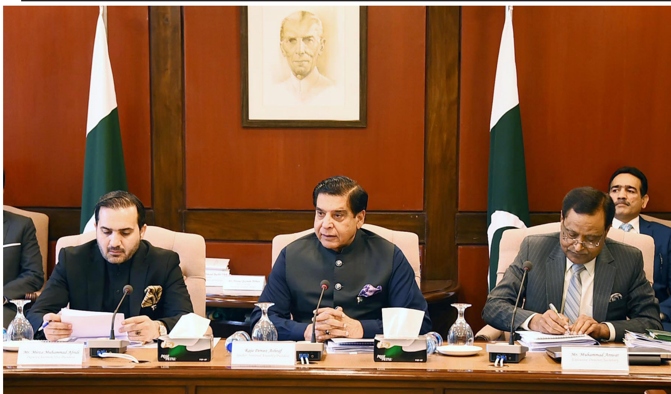
ISLAMABAD: Speaker National Assembly Raja Pervez Ashraf chairing meeting of the PIPS Board of Governor at PIPS.

BEIJING: China's capital warned on Monday that it was facing its most severe test of the COVID-19 pandemic, shutting businesses and schools in hard-hit districts and tightening rules for entering the city as infections ticked higher in Beijing and nationally. China is fighting numerous COVID-19 flare ups, from Zhengzhou in central Henan province to Chongqing in the southwest. It reported 26,824 new local cases for Sunday, nearing the country's daily infection peak in April. It also recorded two deaths in Beijing, up from one on Saturday, which was China's first since late May. Guangzhou, a southern city of nearly 19 million people that is battling the largest of China's recent outbreaks, ordered a five-day lockdown for Baiyun, its most populous district. It also suspended dine-in services and shut night clubs and theatres in the city's main business district. The latest wave is testing China's resolve to stick to adjustments it has made to its zero-COVID policy, which calls for cities to be more targeted in their lockdown measures and steer away from widespread lockdowns and testing that have strangled the economy and frustrated residents.