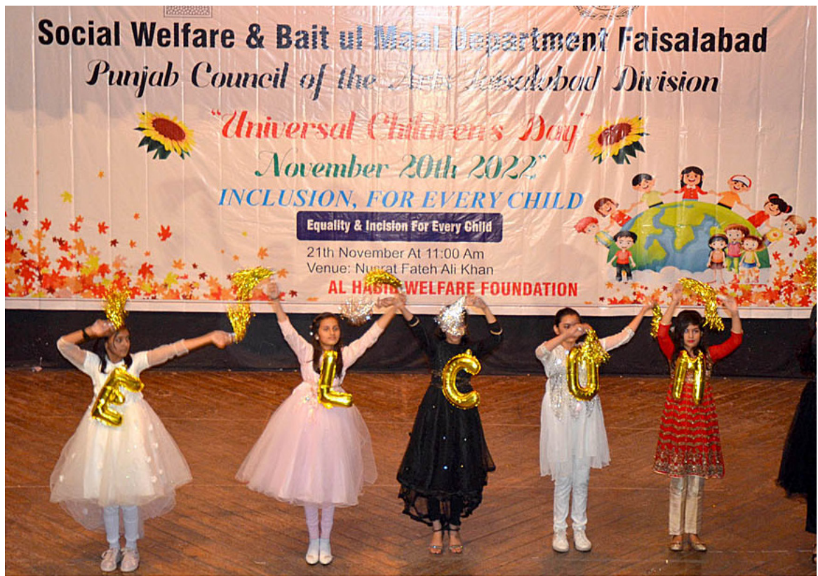
FAISALABAD: Students performing tableau at the Universal Children Day at Faisalabad Arts Council.