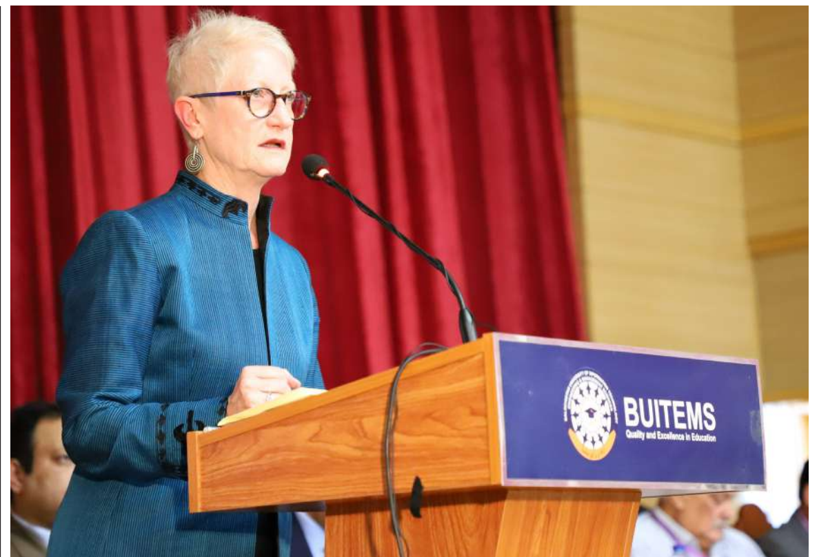
QUETTA: Ambassador of European Union to Pakistan, Riina Kionka addressing 36th AGM and Conference of PSDE.

which would pave way for Pakistan & Morocco's businessmen to explore new dimensions for boosting bilateral trade. He was of the view that Morocco was a potential market for Pakistani textiles and fabrics as it enjoys duty-free access from USA & EU. Both countries can exploit the available opportunities to boost trade and economic development. Stressing the need for undertaking joint ventures, President KCCI said that Moroccan investors can capitalize on exciting investment opportunities in Pakistan's various sectors such as agriculture, textile, renewable energy, food security, industrial & infrastructure development, sports, tourism and hospitality. "Both countries can exchange innovative ideas in the field of tourism to promote and develop tourism economy through joint ventures & exploring the economic opportunities", he added. He noted that as Moroccan economy has a well-established Tangier port with a handling capacity of 9 million containers a year, Pakistan can learn from Moroccan experience to develop Gwadar port, which is the gateway to regional economic transformation. Tariq Yousuf said that Pakistan has tremendous investment opportunities in Energy, Transport Infrastructure, Gwadar, Socio-Economic Development, Science & Technology & Agriculture Cooperation. "We want to further enhance, promote and deepen the business, trade and economic relationships of multi-domains between the two countries."