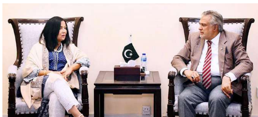
ISLAMABAD: Ms. Yasmin Qureshi, Member Parliament UK-House of Commons/Co-Chair of All Parties Parliamentary Group on Pakistan called on Federal Minister for Finance and Revenue, Senator Mohammad Ishaq Dar at Finance Division.