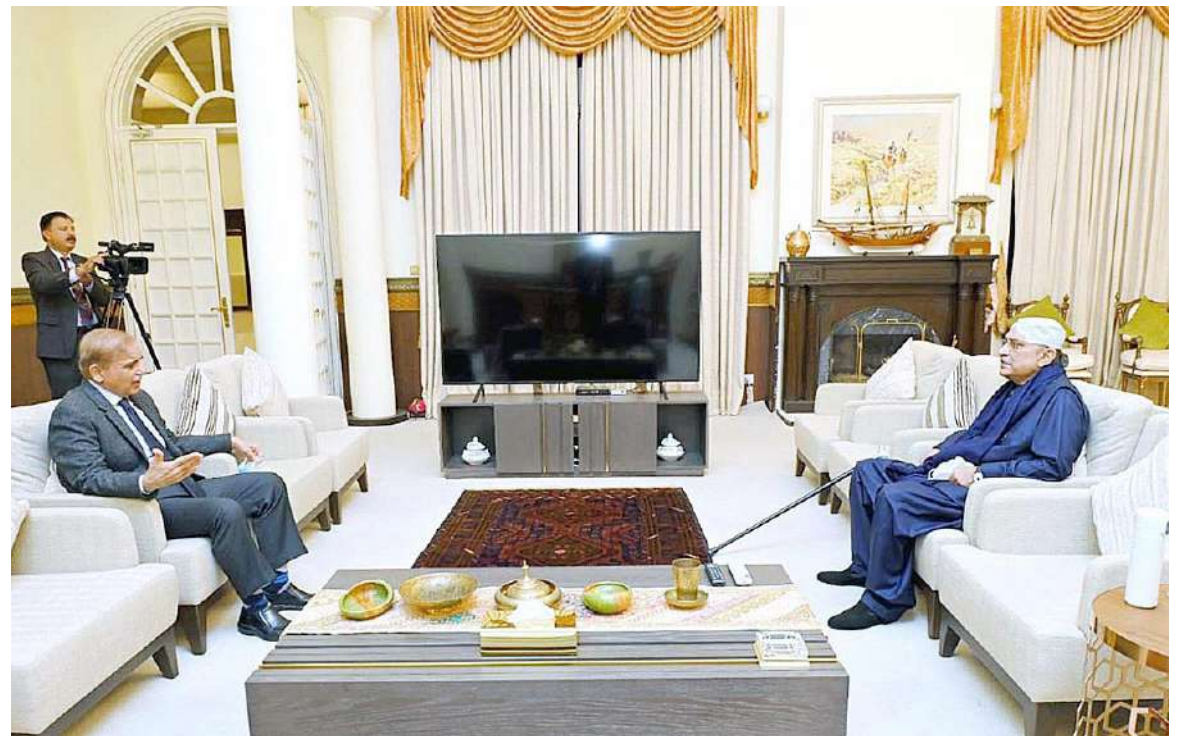
ISLAMABAD: PPP Co-Chairman and former President Asif Zardari in a meeting with the Prime Minister Shehbaz Sharif.