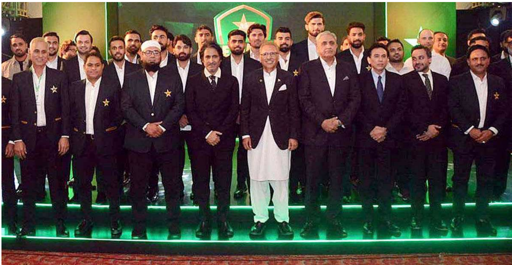
ISLAMABAD: President Dr. Arif Alvi, COAS, General Qamar Javed Bajwa, in a group photo with Pakistan Cricket Team and PCB management, in Federal Capital.

FROM PAGE 01 there to expel those in my party who do wrong. "This will strengthen my party," Imran told host that he never thought of appointing his own army chief and that appointees should be on merit. "Merit is what strengthens institutions." "These two corrupt, mafia clans that have ruled the country for 30 years... just look at history, it has been their attempt to have their own judge, their own IG. "They destroyed the police." "These criminals need control so no one catches them. They have control of NAB, control everyone... but the military is the strongest, the one institution they could not harm. "They destroyed every other institution in 30 years. The one [institution] that's remaining is the army. They're trying their best to control it. That's why they want their own chief." He also said it was the government that "made the army chief controversial". "I believe they made the army chief controversial because they took the stance that 'we like this man.'" He maintained that "Nawaz Sharif has no right to choose the army chief, because he is an absconder and a convict — and neither does Shehbaz Sharif, because his sons were about to be sentenced in a Rs16bn FIA case." "Are such people qualified to make on merit such an important appointment? To choose the head of national security? I believe they shouldn't have."