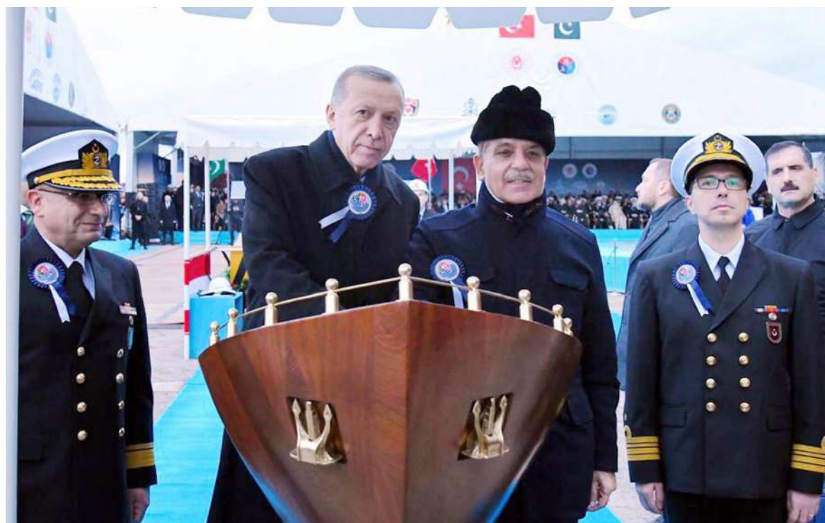
ISTANBUL: Prime Minister Muhammad Shehbaz Sharif and Turkish President Recep Tayyip Erdogan jointly launch PNS Khyber, third of four MILGEM Corvette ships for Pakistan Navy.