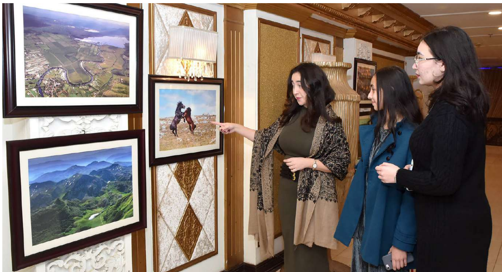
ISLAMABAD: Women taking interest in paintings displayed on the occasion of National day of Bosnia and Herzegovina.—DNA