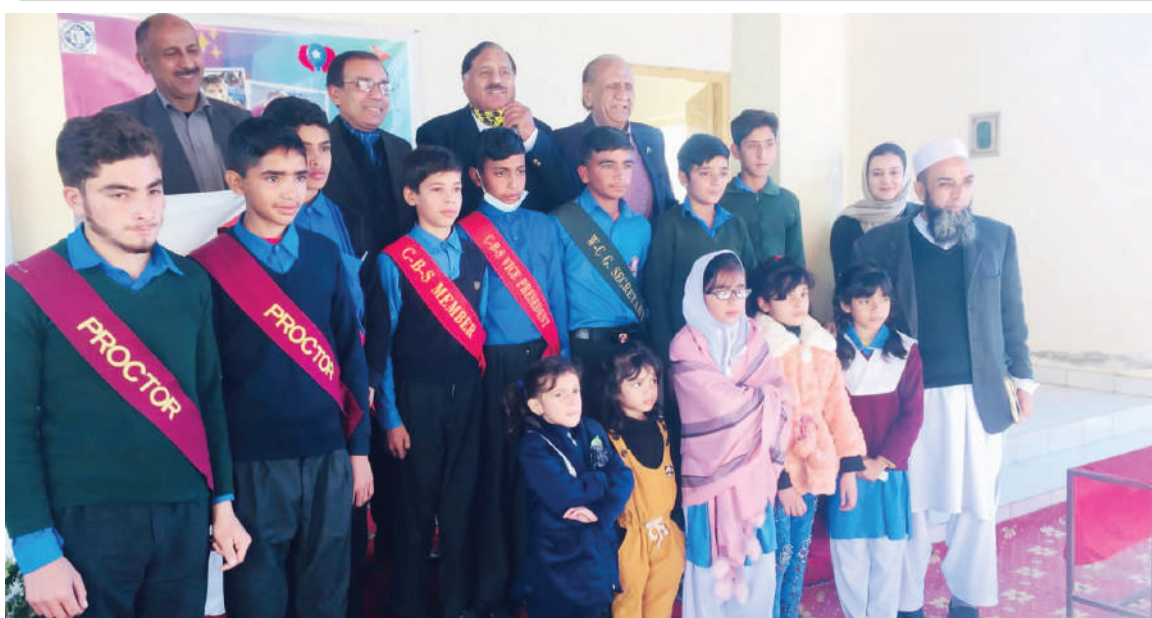
ISLAMABAD: The President of the Rural Development Forum posing for a picture with students during an annual function.