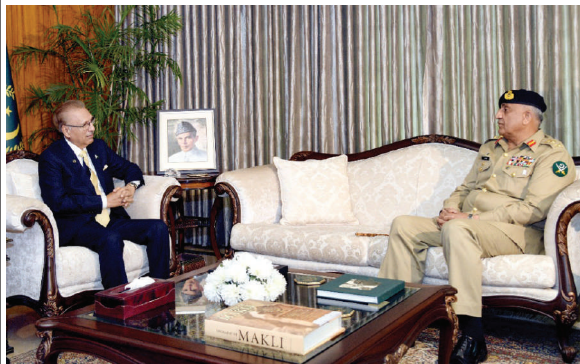
ISLAMABAD: Outgoing Chief of the Army Staff General Qamar Javed Bajwa paid a farewell call on President Dr. Arif Alvi at Aiwan-e-Sadr.