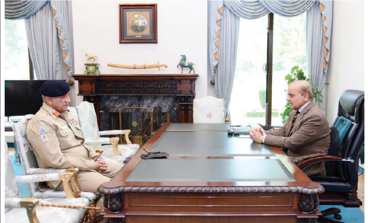
ISLAMABAD: Outgoing Chief of Army Staff (COAS) General Qamar Javed Bajwa pays a farewell call on Prime Minister Shehbaz Sharif.