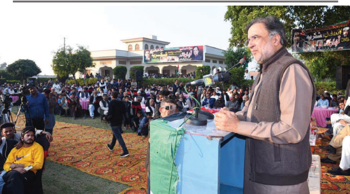
PASWAL/LALAMUSA: Advisor to Prime Minister on Kashmir Affairs and Gilgit Baltistan, Qamar Zaman Kaira addressing a public gathering.

MIRPUR (AJK): Azad Jammu and Kashmir Prime Minister Sardar Tanveer Ilyas Khan, while appreciating the peaceful conduct of the first phase of LG polls in AJK, Muzaffarabad Division, and termed it as a victory of democracy. Talking to media in the State metropolis on Monday the PM said, "I appreciate office bearers and workers of all the political parties who have played an important role in advancing politics and democracy in the state". Lauding political leadership for demonstrating maturity, the PM said that despite less security the poll process remained peaceful. "It shows the high level of political consciousness amongst the people and political leadership on one hand while it highlights the quality administration, capacity and capability of the security apparatus of the state of Azad Jammu Kashmir on the other," he said. While congratulating the victorious candidates of his ruling party, the PM said, "I congratulate the lion-hearted workers of Tehreek-e-Insaf ran a successful campaign during the local body elections. Referring to his party's victory in the polls, he asserted, "It has been proved now that his party has become stronger due to its performance in Muzaffarabad". He expressed the hope that his ruling party would also show its performance in the second and third phase of elections being held in Poonch and Mirpur divisions as well. - APP