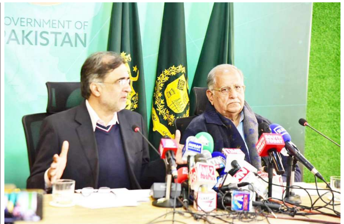
ISLAMABAD: Advisor to the Prime Minister on Kashmir Affairs and Gilgit Baltistan Qamar Zaman Kaira and Federal Minister for Human Rights Mian Riaz Hussain Pirzada addressing a press conference.

ICCIA highlighted that the BOE series is a platform that has been designed to bring the relevant stakeholders together and will continue to enlighten, educate, and inspire young entrepreneurs to contribute to a greener Pakistan and the world through regular rounds and series to touch base on common challenges and needs. It is the platform to introduce the sectors of the future that Pakistan needs to consider as part of its strategic vision in building a resilient and sustainable economy.