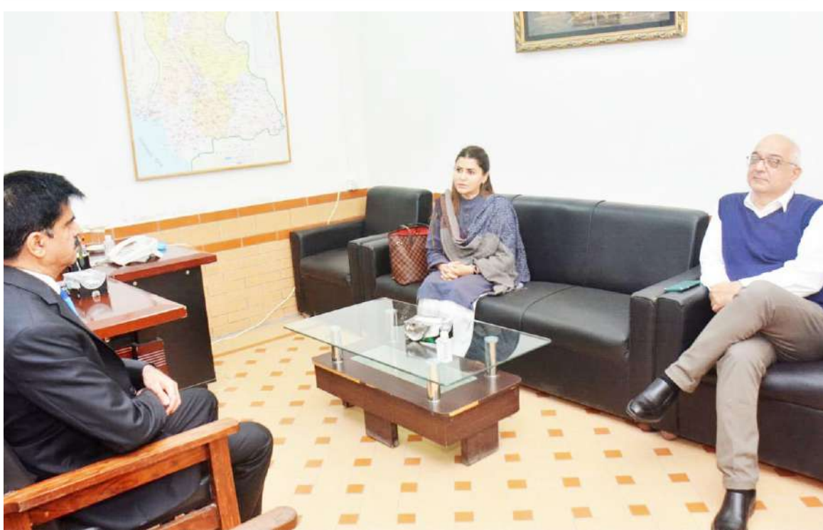
KARACHI: Ms Shazia Marri Federal Minister for Poverty Alleviation and Social Safety presiding over a meeting with officers at DG office Central Zone Benazir Income Support Program.—DNA