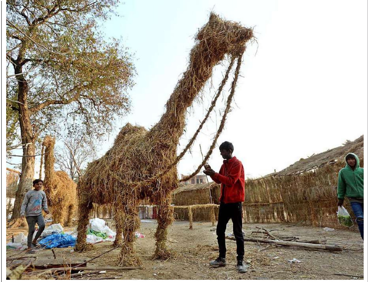
ISLAMABAD: Christian youngsters busy in decoration for upcoming Christmas and New Year's celebrations at G-7.-APP