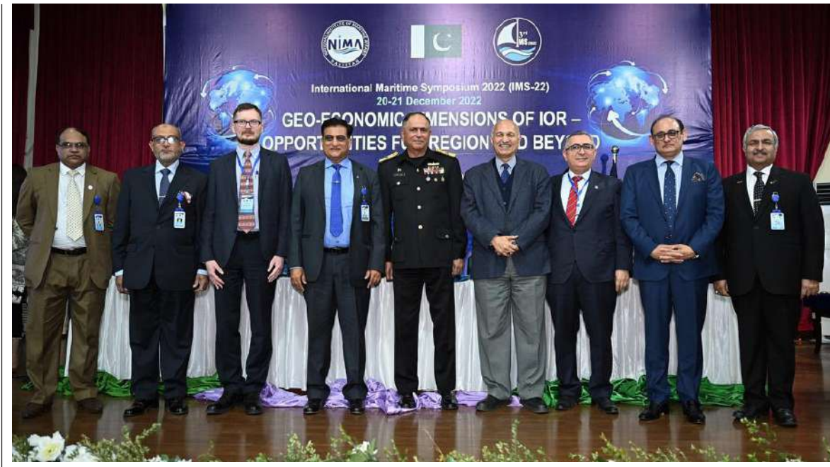
ISLAMABAD: Participants of International Maritime Symposium (IMS), on the topic Geo-economic Dimensions of Indian Ocean Region Ocean Region posing for a group photo.