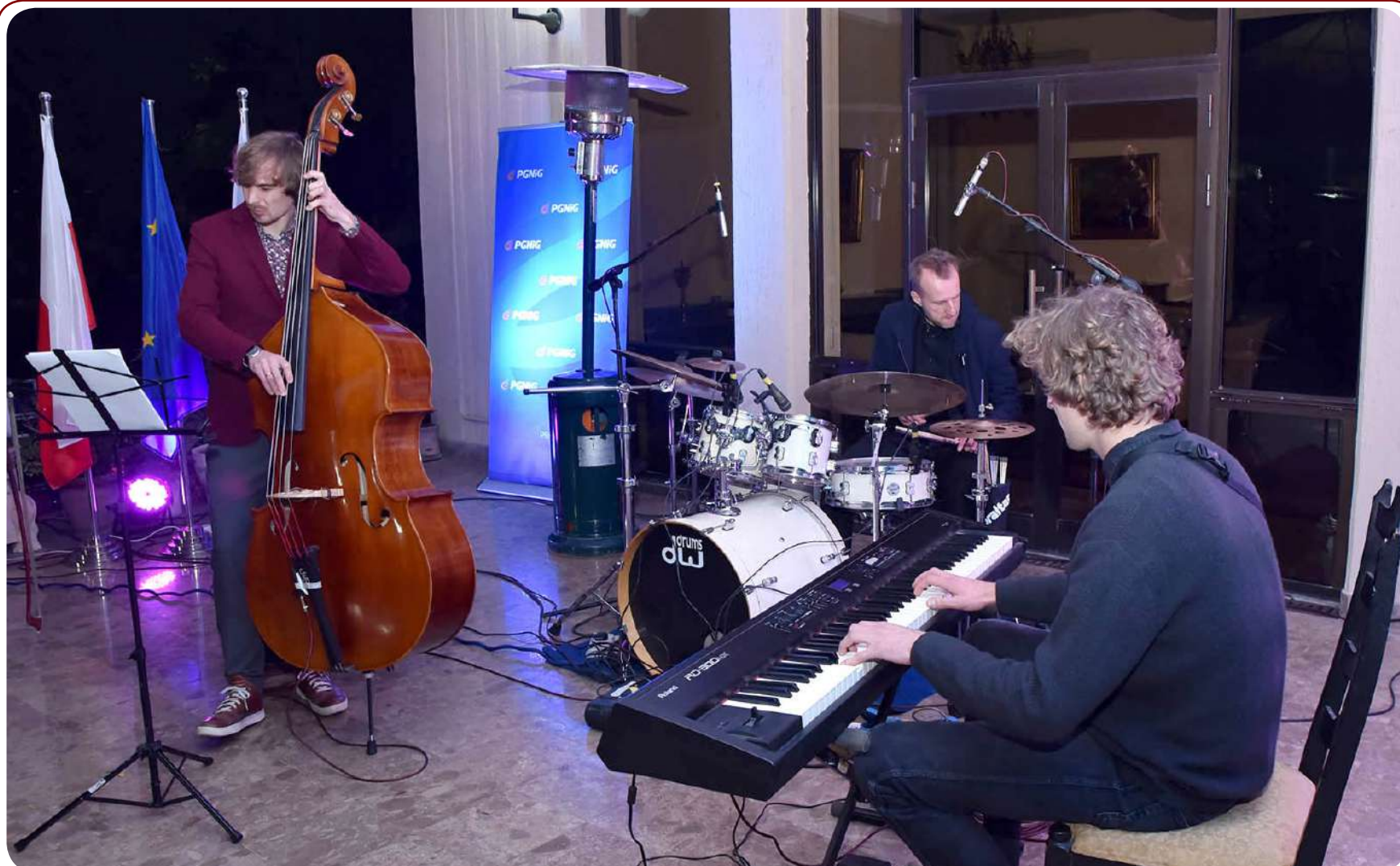
ISLAMABAD: Polish musicians presenting JAZZ performance on the occasion of the Independence Day and Armed Forces Day of Poland. The event was organized by the Polish Ambassador Maciej Pisarski and Bogdan Obuchowski, the Defence Attache, at his residence.-DNA

GENEVA: Christmas will not be as glittering as before in Switzerland under the shadow of compulsory energy-saving policies that could dim the holiday spirit. Like all European countries, Switzerland is tightening its belt to deal with a Russia-induced energy crunch during the winter, which includes a series of measures that would affect Christmas decorations, lighting, and stores and holiday markets. In most cities, measures such as energy-saving LED lights, candles, using biogas for heat, and restricting lighting hours are being used to conserve energy while still encouraging a festive atmosphere. Electric heaters are not allowed at the English Garden in the harbor, which this time of year is transformed into a Christmas Garden. The garden is covered with biogas-heated chalets. Illumination at the Christmas markets will be provided with LEDs, while illuminated signs will be turned off at night.