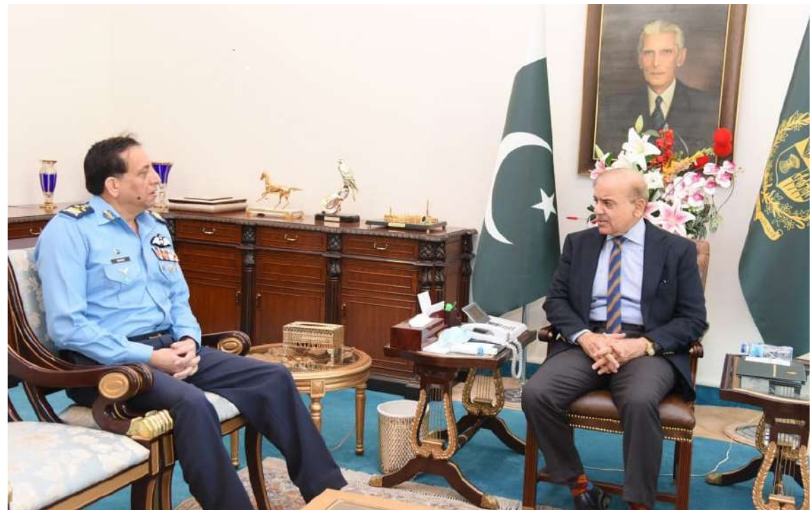
ISLAMABAD: Chief of the Air Staff Air Chief Marshal Zaheer Ahmed Babar calls on Prime Minister Shehbaz Sharif.

ISLAMABAD Minister of State for Foreign Affairs Hina Rabbani Khar called on Prime Minister Shehbaz Sharif here on Thursday and apprised him about her recent visit to Afghanistan. Khar, who paid a day-long official visit to Kabul on Tuesday, informed the prime minister about the outcome of her meetings with the interim Afghan leadership. Shehbaz Sharif said Pakistan desired a peaceful Afghanistan and vowed to extend every possible support to the Afghan brethren. He called upon the international community to play its role in improving the situation in Afghanistan as the war-torn country faced the challenges of economy and security.