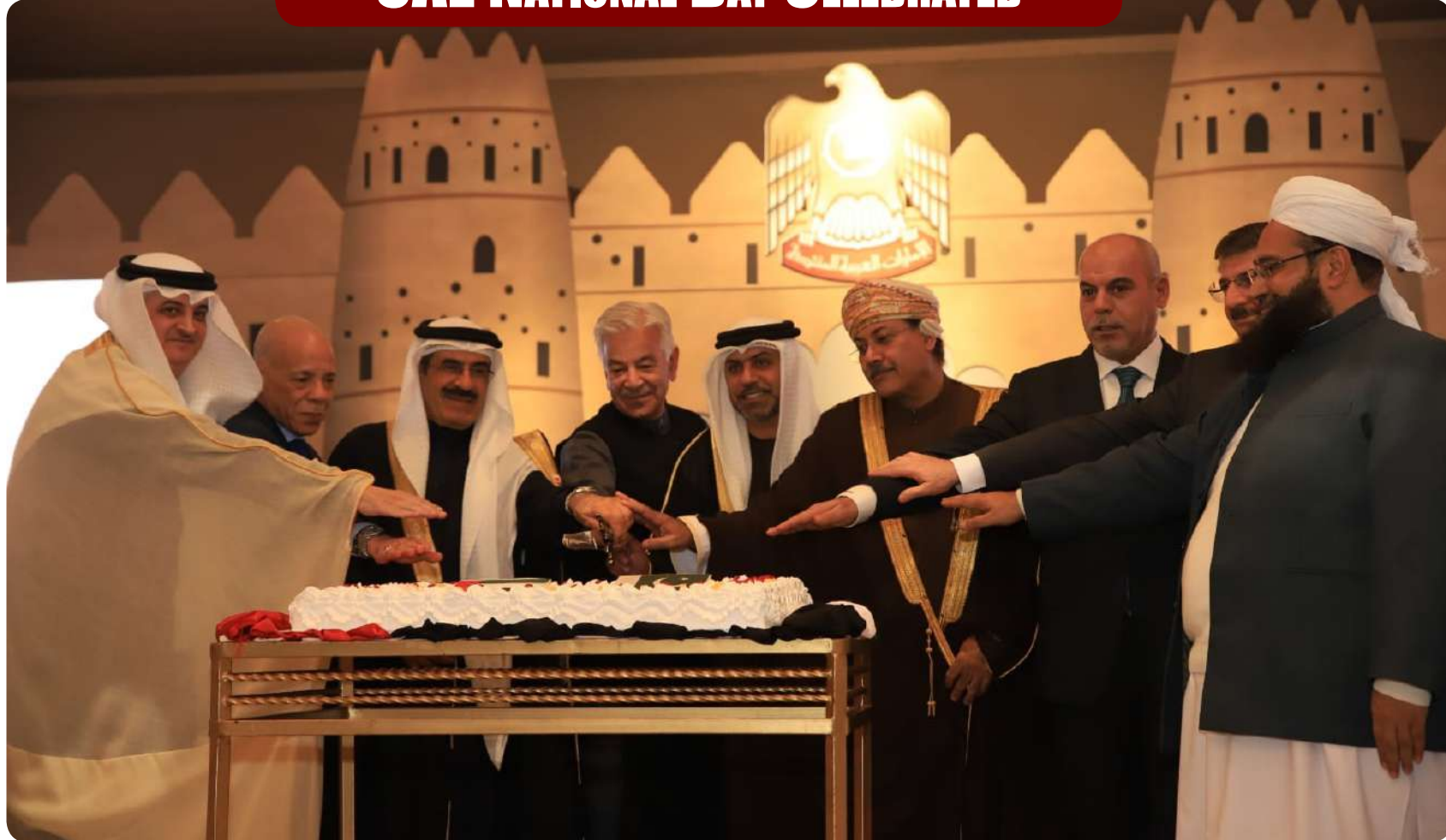
ISLAMABAD: Defence Minister Khawaja Asif, Ambassador of UAE Hamad Alzaabi and others cutting cake to celebrate 51st National Day of the United Arab Emirates (UAE), at Islamabad Serena Hotel.

Russia has already told civilians to leave towns within 15 km of the river and withdrawn its civilian administration from city of Nova Kakhovka on bank