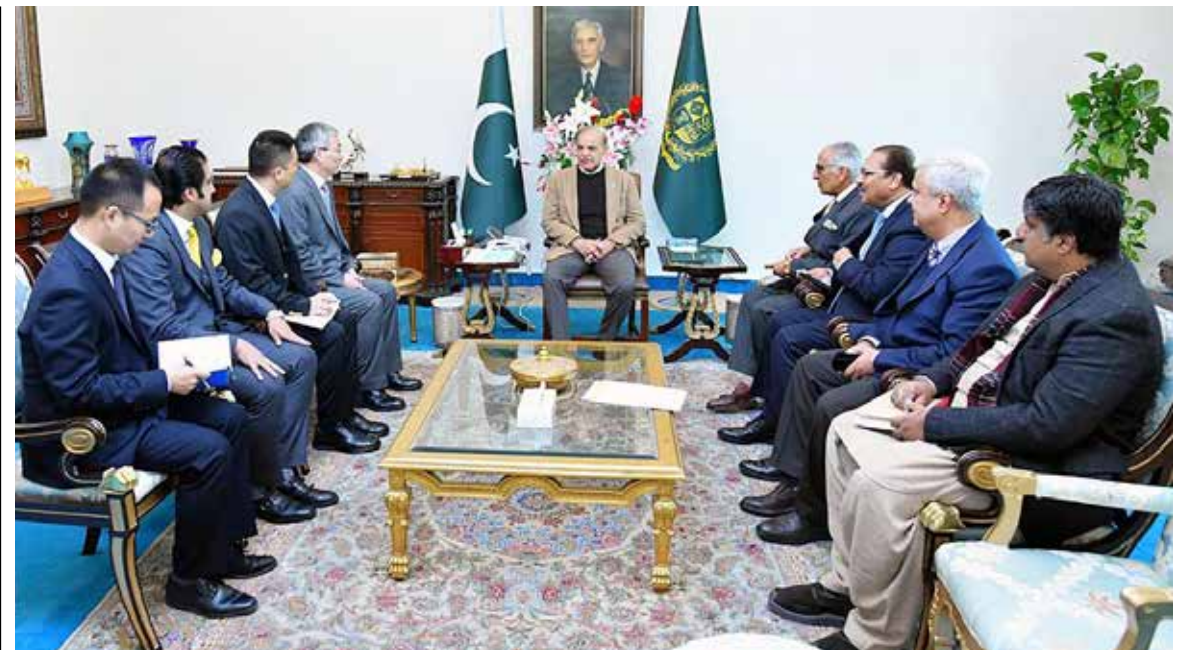
ISLAMABAD: Prime Minister Shehbaz Sharif in a meeting with delegation of China Construction Third Engineering Bureau.

PM invites Chinese companies to invest in energy