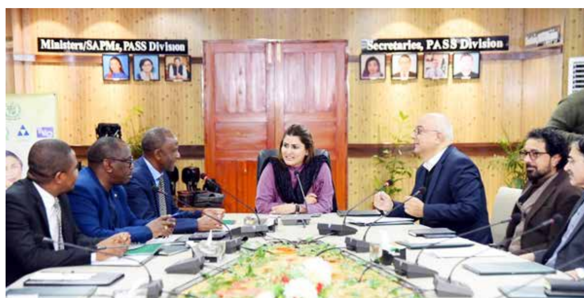
ISLAMABAD: Shazia Marri, Federal Minister and Chairperson Benazir Income Support Programme meeting with delegation of Social Action Fund of Tanzania in Islamabad.

completion will usher in a new era of development in the area. According to details, the 80 kilometers long Swat Motorway Phase 2 is being constructed from Chakdara Interchange to Fatehpur.