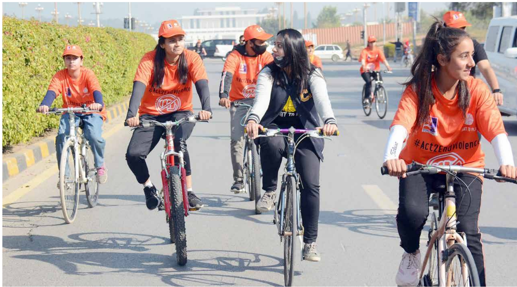
ISLAMABAD: Cyclists take part in cycling Sunday to support campaign against "Femicide" 16 Days of activism.

OCCUPIED WEST BANK: Israeli warplanes have attacked sites in the Gaza Strip after a rocket landed in southern Israel and as tensions reach a boiling point in the occupied West Bank, where 10 Palestinians have been killed by Israeli forces since last week. The Israeli military said the air raids in the early hours of Sunday targeted a weapons manufacturing facility and an underground tunnel belonging to Hamas, according to the Associated Press news agency. "The strike overnight continues the progress to impede the force build-up", the Israeli army said in reference to Hamas, AP reported. No group has claimed responsibility for the rocket, reportedly the first fired in a month, which the Israeli military said landed in an open area near Israel's separation fence on Saturday evening without causing casualties or damage to property. The air attack on Gaza follows outrage over the shooting at point-blank range of a young Palestinian man, Ammar Mufleh, 23, by an Israeli soldier in broad daylight on Friday, which was captured on video. The harrowing footage has sparked widespread anger among Palestinians and calls on social media to escalate resistance against the Israeli occupation.