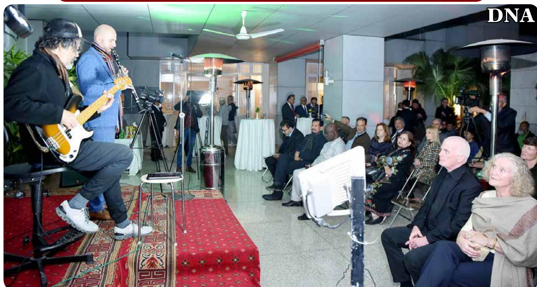
ISLAMABAD: Ambassador of Switzerland Georg Steiner organized a JAZZ music night at his residence. Renowned artist from Switzerland had flown all the way from Switzerland to perform in Pakistan. The trio consisted of clarinet, guitar and bass and presented different styles of jazz including swing, blues bossa nova and many more. The musicians will perform at the PNCA and then in Lahore as well. (More coverage in the coming issue of Centreline magazine). - DNA