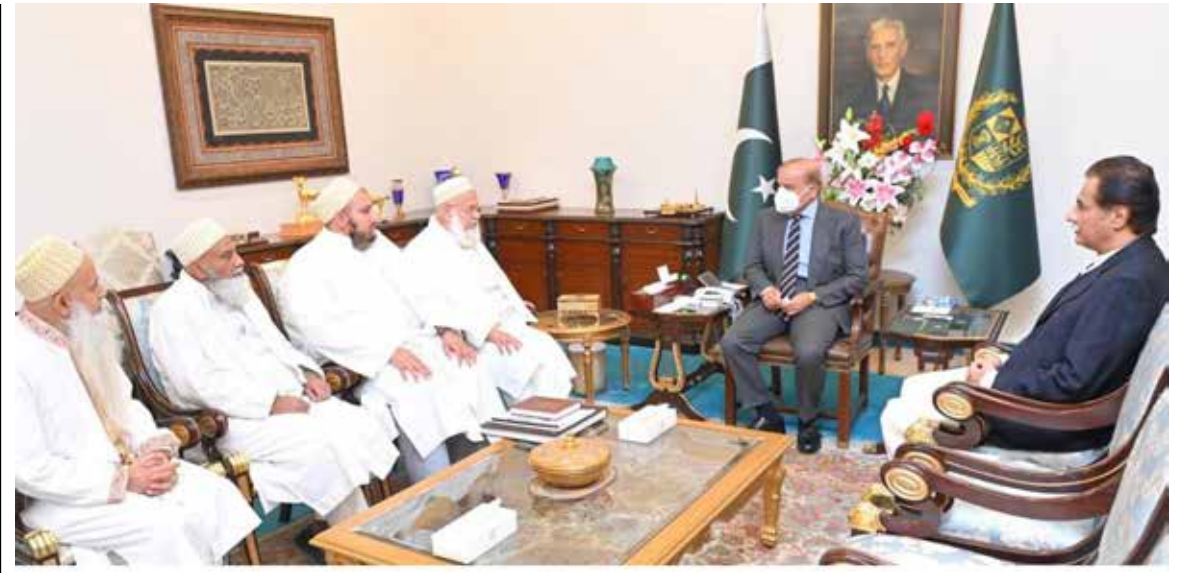
ISLAMABAD: A delegation of Dawoodi Bohra community calls on Prime Minister Muhammad Shehbaz Sharif.