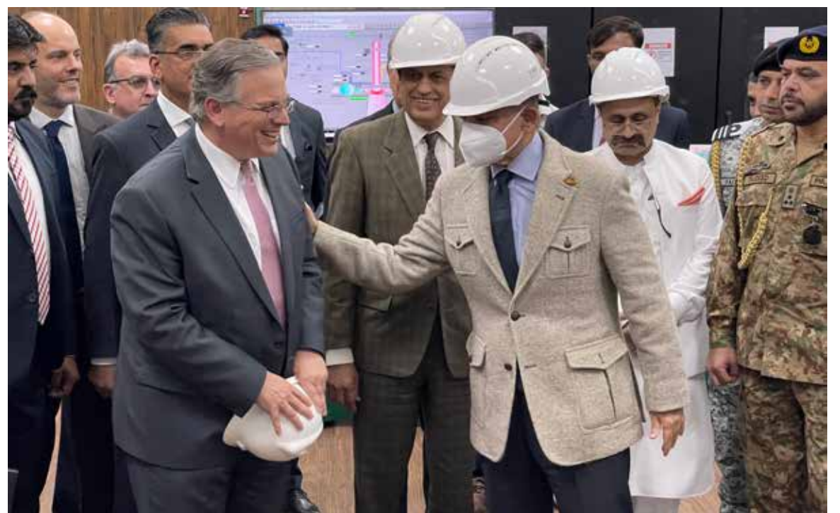
MANGLA: Prime Minister Shehbaz Sharif interacts with US Ambassador while reviewing refurbishment project of Mangla Dam and operations of the newly inaugurated units.

curity officials said they had recovered weapons, ammunition and explosives from the possession of the terrorists. Last week, security forces killed a notorious terrorist commander, Muhammad Noor alias Sarakai, in an exchange of fire in the North Waziristan district. The ISPR said that on December 2 an exchange of fire took place between terrorists and troops in general area of Shewa. The slain terrorist remained actively involved in high-profile terrorist activities against security forces as well as kidnapping for ransom and was wanted by Counter Terrorism Department (CTD) in multiple cases, the military's media wing further said.