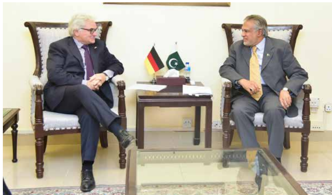
ISLAMABAD: Ambassador of Germany, Alfred Grannas calls on Finance Minister Ishaq Dar.

ISLAMABAD: Ambassador of Germany Alfred Grannas called on Minister for Finance Senator Mohammad Ishaq Dar in Islamabad on Monday. The Finance Minister highlighted bilateral relations between the two countries and stated that Pakistan highly values its bilateral relations with Germany. He also pointed the importance of enhancement in trade and economic relations between both countries. The Finance Minister briefed Alfred Grannas about the economic policies of the present government aiming at promotion of trade and investment. He also shared the potential avenues for investment present in Pakistan through which both countries can further deepen the commercial and economic ties. Ambassador of Germany shared sentiments of gratitude with the Finance Minister on offering the cooperation and support for enhancing and strengthening bilateral relations between both the countries. The Ambassador also showed keen interest for getting benefit from investment opportunities in Pakistan in various sectors. The Finance Minister, in conclusion, thanked the German Ambassador Alfred Grannas and offered full support and cooperation for future investment endeavours in Pakistan.