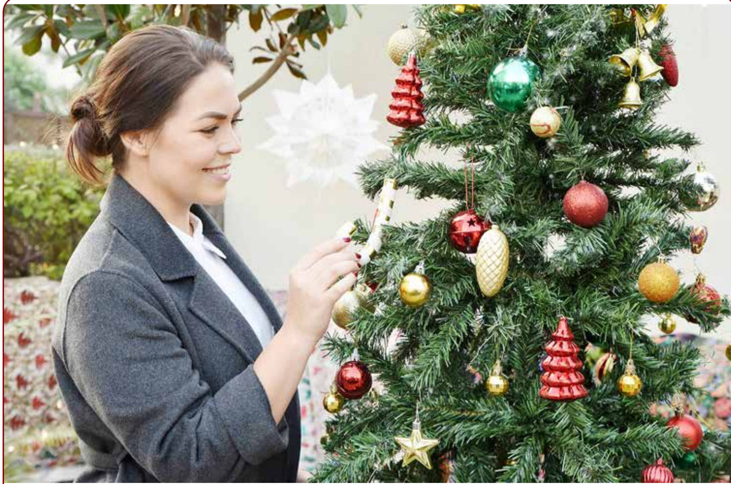
ISLAMABAD: A guest looking at the Christmas Tree installed on the occasion of German Christmas Market Bazar held at the Islamabad Serena Hotel.