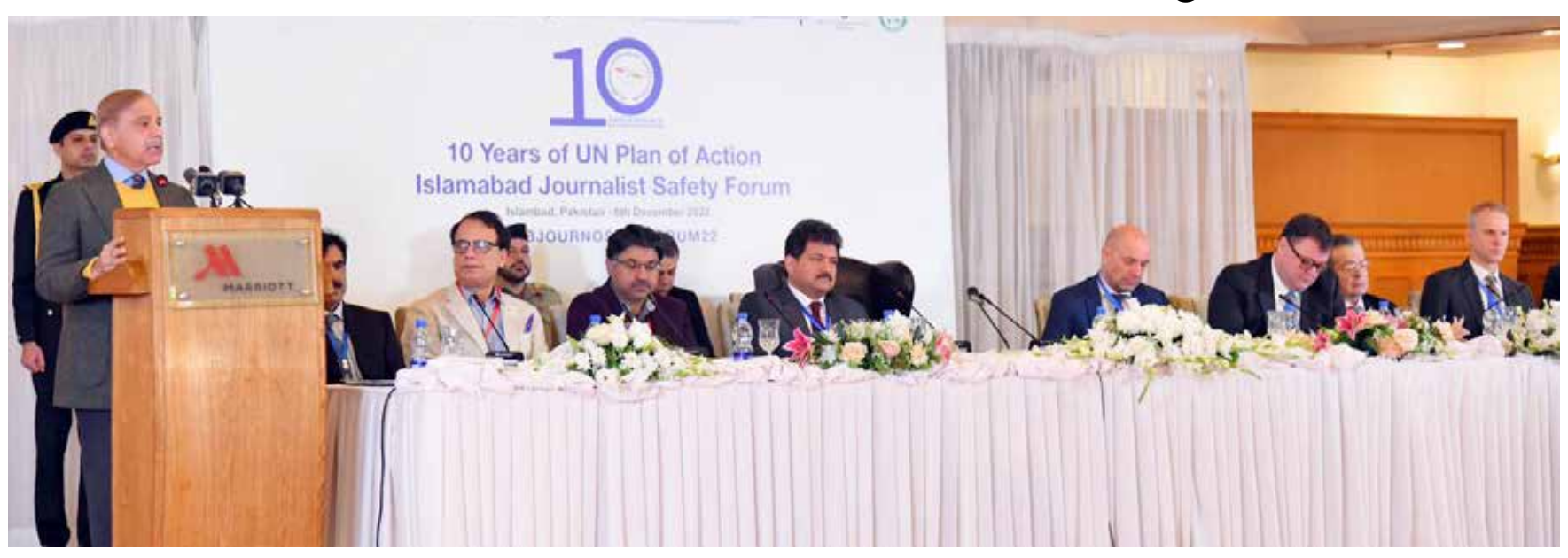
ISLAMABAD: Prime Minister Muhammad Shehbaz Sharif addressing at a seminar titled, "10 Years of UN Plan of Action on the Safety of Journalists and the Issue of Impunity in Pakistan" in Islamabad.