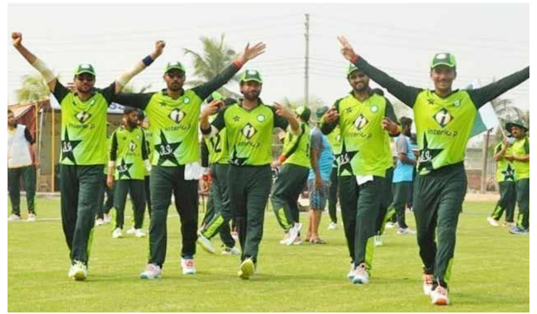
foreign ministry failed to issue a no-objection certificate (NOC)

LAHORE: The Government of India has declined to issue visas to the squad of Pakistan's blind cricket team for the ongoing T20 Blind World Cup 2022, it emerged on Tuesday. Expressing its disappointment at the Indian government's decision to not issue visas to the Pakistan blind cricket team, the Pakistan Blind Cricket Council (PBCC) said that New Delhi made the decision on "political grounds". In a statement, the PBCC said that Pakistan, a two-time runner-up, were a strong candidate to win the T20 World Cup. Pakistan's blind cricket team was to leave for India on Sunday to attend the international sports event. The T20 Blind World Cup is taking place in India from Dec 5 to 17. PBCA Chairman Sultan Shah, who is also the president of the World Blind Cricket Council (WBCC), disclosed that India's