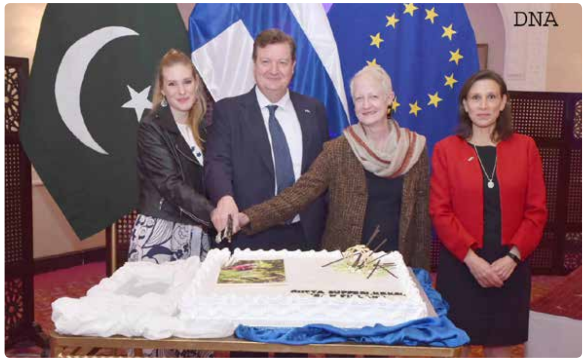
ISLAMABAD: Ambassador of Finland Hannu Ripatti, Ambassador of European Union Riina Kionka, spouse and daughter of Ambassador Ripatti cutting the cake to celebrate the 105th Independence Day of Finland. Finland has re-opened its embassy in Pakistan.