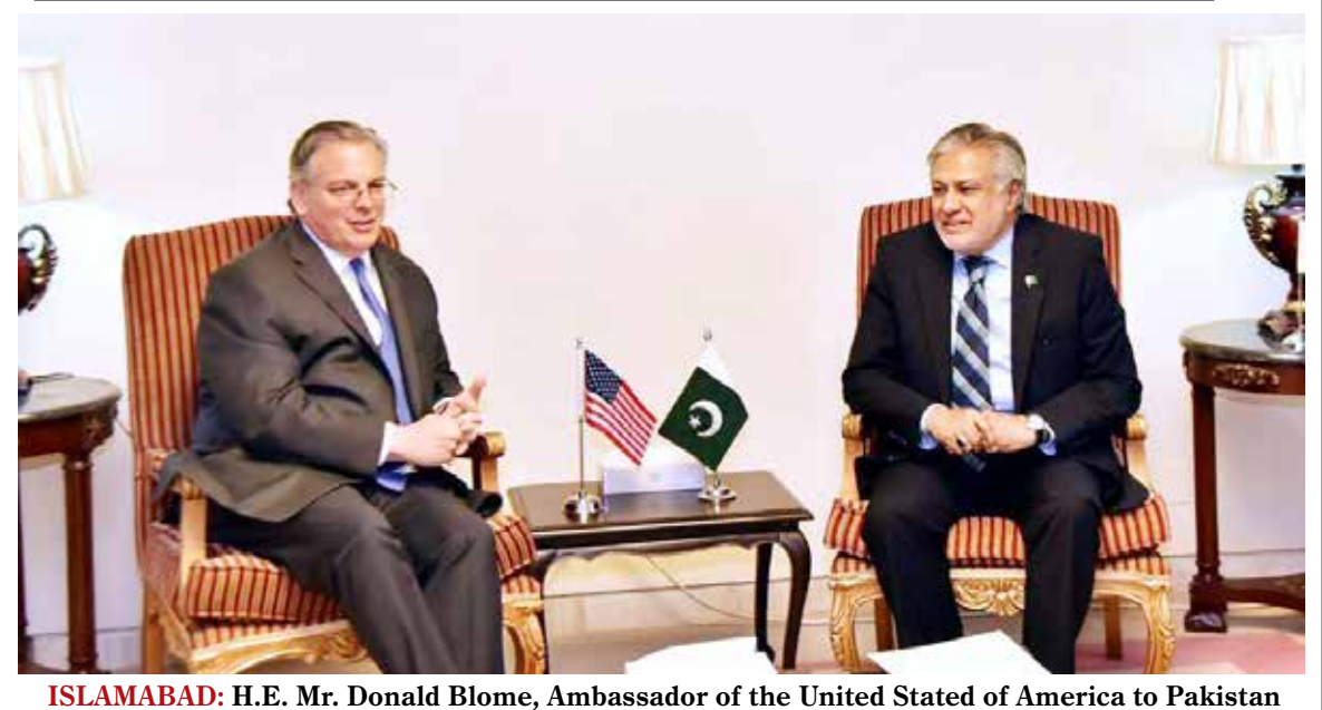
called on Federal Minister for Finance and Revenue Senator Mohammad Ishaq Dar.