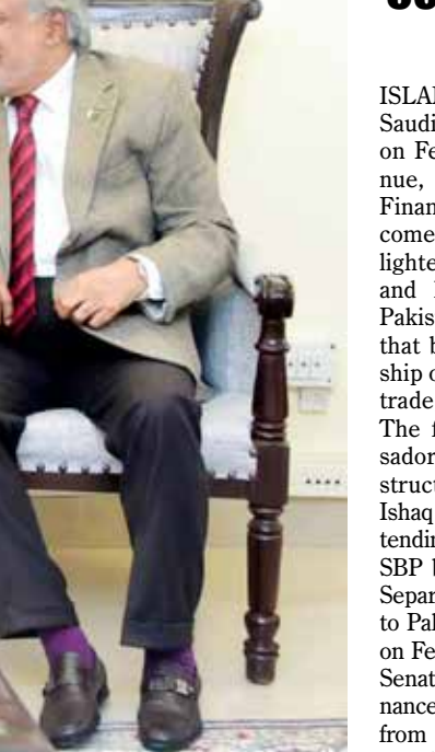
ISLAMABAD: Ambassador of Kingdom of Saudi Arabia, Nawaf Bin Said Al-Malki calls on Federal Minister for Finance and Revenue, Muhammad Ishaq Dar.