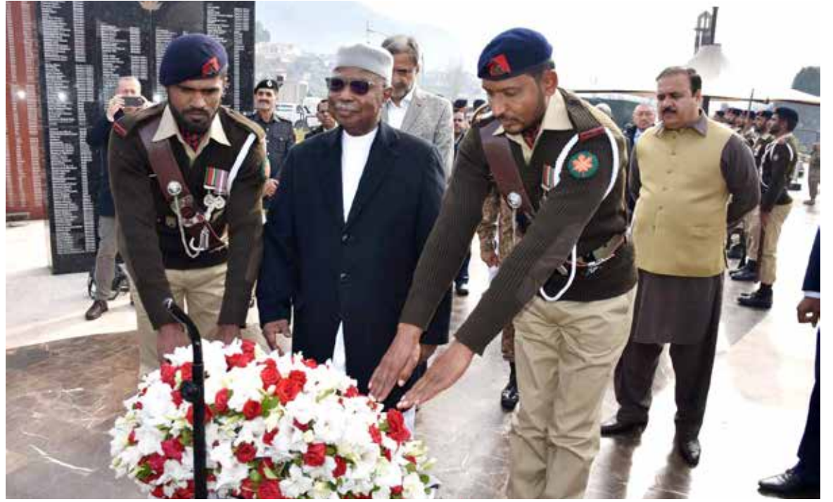
MUZAFFARABAD: Secretary General OIC, Hissain Brahim Taha laid wreath at the J&K Monument and offered Fateha in memory of people who sacrificed their lives for the Kashmir cause.

the delegation. Pakistan and Tajikistan enjoy excellent brotherly relations. Both countries are part of landmark CASA 1000 energy project. This project will bring energy from Tajikistan to Pakistan via Afghanistan. After completion of this project Pakistani people will have cheap energy. Both sides are also discussing resumption of air links between the two countries. The Tajik airline shall fly from Dushanbe to Lahore very soon.