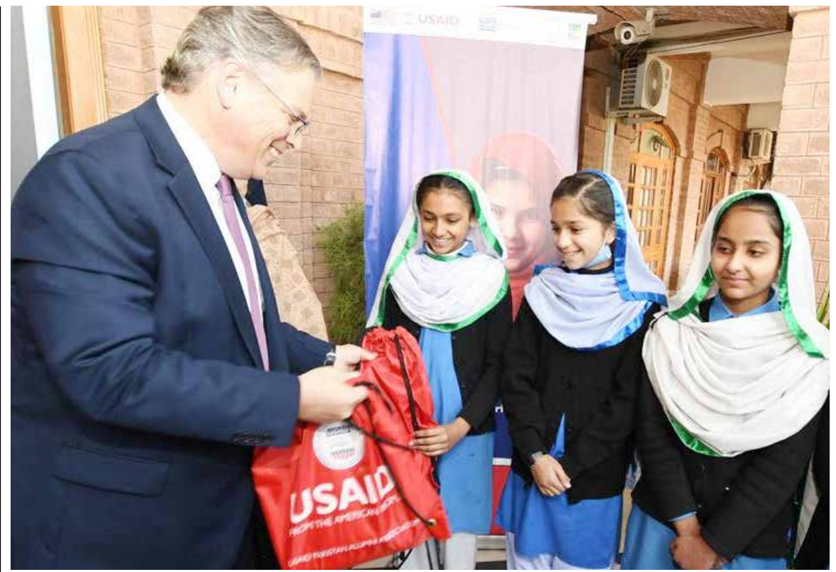
PESHAWAR: US Ambassador Donald Blome launched the US government-funded 'Improving Girls Education Activity' with an aim to provide quality education to girls in remote areas of KP.

cuss it with the federal government. He added that his efforts for the welfare of people and the province's rights would be supported. He said that the general election would be held on time and the strategy of the component parties of the PDM for contesting the next general elections would be decided in the future. He said that the PTI government caused damage to the country's relations with other countries. But now the country's foreign minister was striving to restore the trust of other countries and as a result, bilateral relations were gradually improving and the exchange of delegations had started with other countries. He said the government was focusing on rehabilitation activities at flood-affected areas and added that those countries who were responsible for polluting the environment which resulted in climate change, should contribute and support Pakistan in its efforts in rehabilitation activities in flood-affected areas. He said floods wreaked havoc on agricultural land and there were several areas where crops could not be sown and such a situation led to food scarcity. But the government was committed to bringing life to normal in the flood-hit areas and converting the situation into an opportunity, he added. As far as Dera Ismail Khan was concerned, Faisal Karim said, efforts were underway to lay the foundation stone of the Chashma Lift Canal which was a long-standing demand of the area. Similarly,