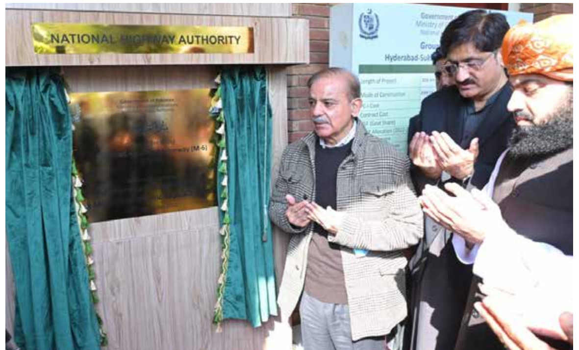
SUKKUR: Prime Minister Shehbaz Sharif offering prayer after laying the foundation stone of the Sukkur-Hyderabad motorway (M-6) during a ceremony.