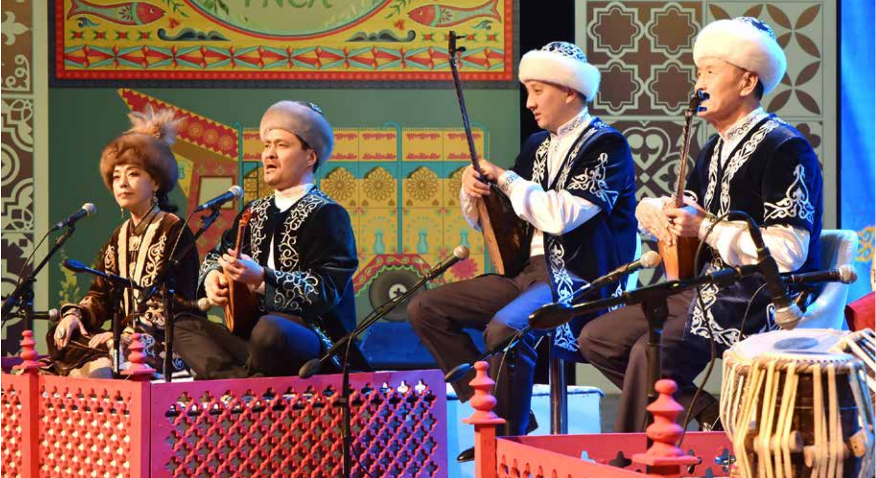
ISLAMABAD: Artists from Kazakhstan perform during a music concert held at the PNCA.