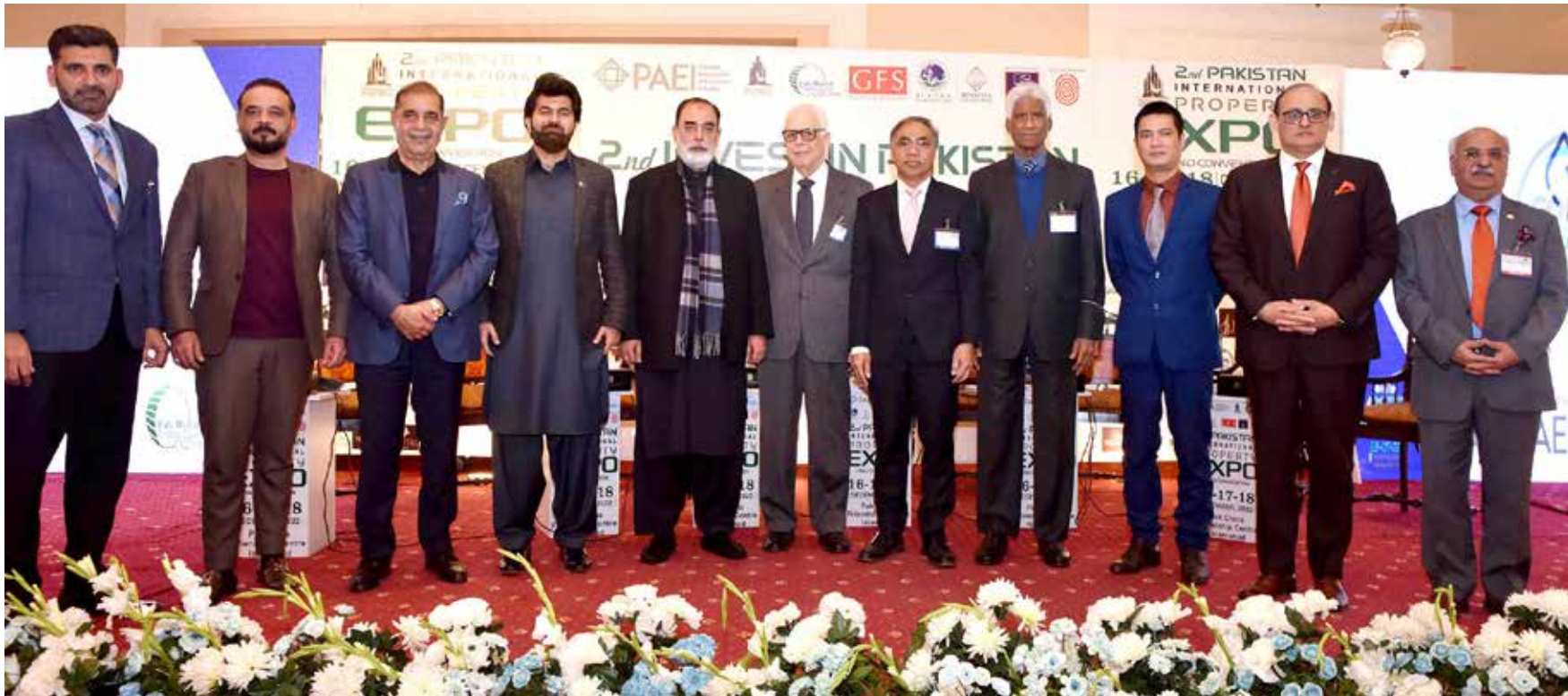
ISLAMABAD: Federal Minister Senator Talha Mehmood, Ambassadors of Brazil, Indonesia, Mauritius, Vietnam and others posing for a picture on the occasion of 2nd Investment in Pakistan conference organized by Khurshid Barlas under the aegis of PAEI, at Islamabad Serena Hotel.

The purpose of this conference was expressed by the speakers regarding investment in Pakistan. Special guest Federal Minister Senator Talha Mehmood while addressing the conference said that there will be a free foreign policy only with a strong economy