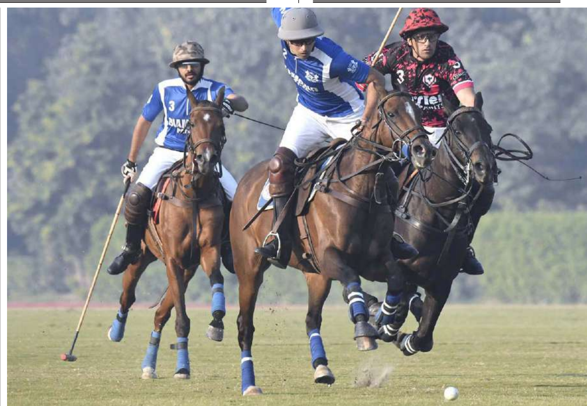
LAHORE: A view of Polo match playing between Diamond Paints and Master Paints Black during the Coca Cola Lahore Open Polo Championship 2022 at Lahore Polo Club.

CHITTAGONG: Shubman Gill and Cheteshwar Pujara each struck a century as India took control of the first Test against Bangladesh in Chittagong on Friday. The visitors declared their second innings on 258-2 in the third session of the third day to set a daunting 513-run target for the home side. Bangladesh were all out for 150 runs in their first innings, leaving India the overwhelming favourites to secure victory. Skipper KL Rahul called back his batsmen after Pujara brought up his 19th Test hundred with a four off Tajjul Islam soon after their lead surpassed the 500-run mark. Pujara, who also scored 90 in India's first innings total of 404, was unbeaten on 102 after smash-