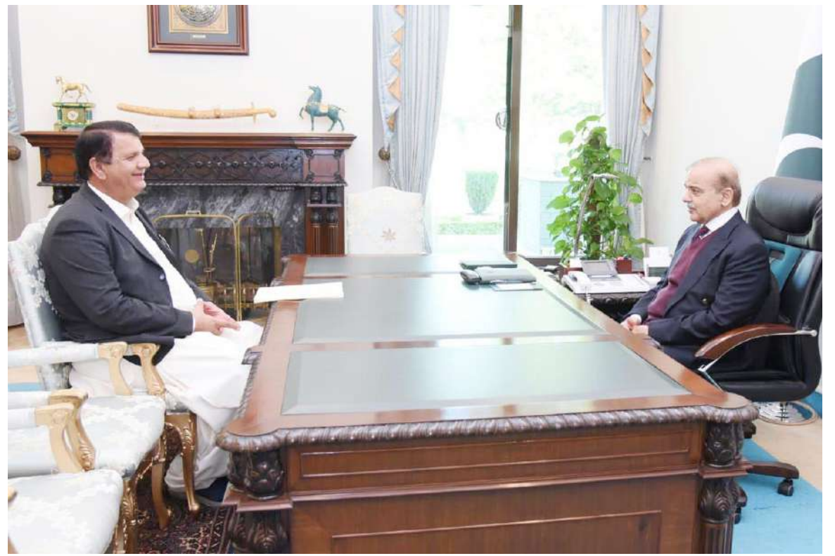
ISLAMABAD: Adviser to Prime Minister on National Heritage, Culture, Political and Public Affairs Amir Muqam meeting with Prime Minister Shehbaz Sharif.—DNA

The Minister directed the concerned departments and Ministries to ensure review progress on the implementation of the decisions taken in the 11th JCC meeting. Minister directed the concerned officials to expedite the development process on 1000 Acre Islamabad Special Economic Zone while also directing the Pakistani Embassy in Beijing to follow up the matters pertaining to CPEC projects. Minister expressed displeasure over the inaction on the part of concerned departments on matters concerning the uninterrupted power supply to Orange Line Project.