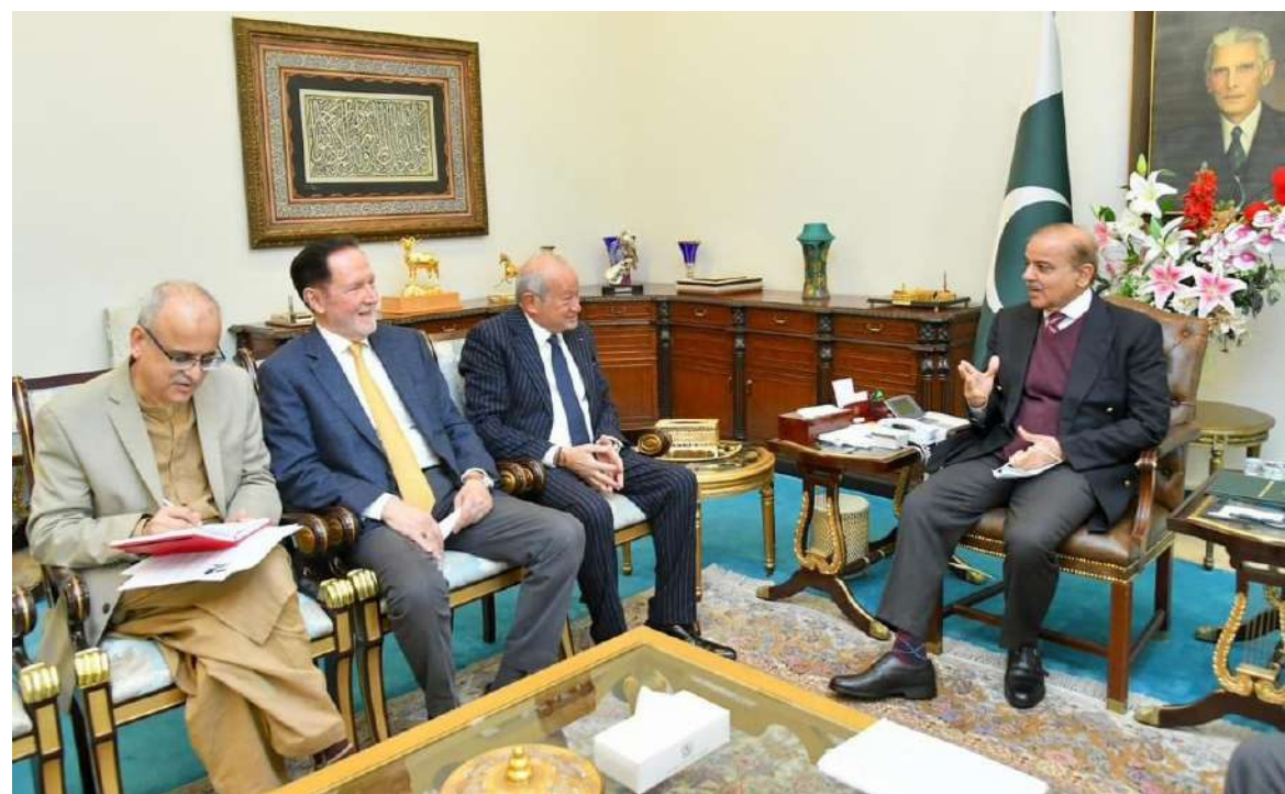
ISLAMABAD: Well Known Egyptian Businessman Naguib Sawiris calls on PM Shehbaz Sharif.

ECP seeks census result for timely polls PBS had to provide the provisional results of the census by Dec 31